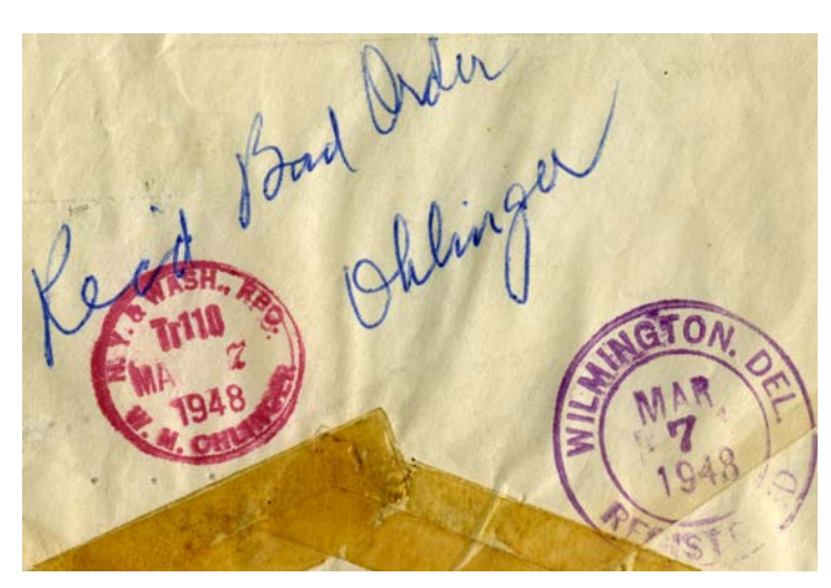
Figure 2. Reverse of cover in Figure 1

With ms Rec'd Bad Order/Ohlinger . Just below that is a red NY & WASH RPO with the same guy's name appearing at the bottom W.M. OHLINGER. The missing stamp plausibly had gone missing before it reached Ohlinger, so we can view the cover as if it were in fine condition . . . .