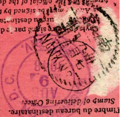
Figure 3. China AR card (1948)

No stamps applied. For a registered letter to Washington from Nanking, mailed 13 July, delivered 9 August, and the signed card returned to sender as intended (unfortunately the date on the receiver is entirely in Chinese characters, so I don't know what it is—any help would be appreciated).