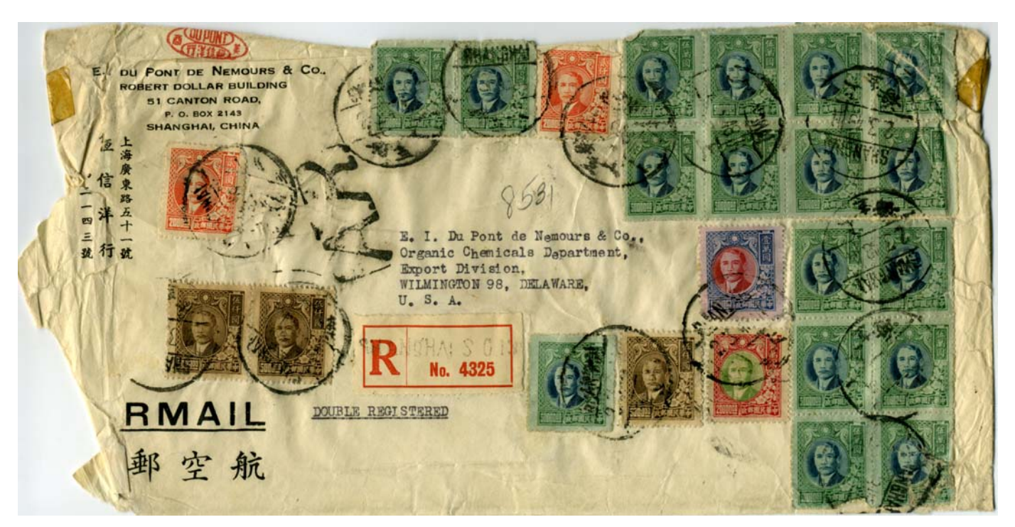
Figure 1. Shanghai—Wilmington, air registered AR (2 March 1948) Obliqued AR handstamp. From Shanghai office of Du Pont to home office.

THE massive cover shown in Figure 1 is somewhat damaged, and moreover, has been kept together by scotch tape (mostly on reverse and likely applied by a postal clerk), and worse, is missing a stamp. However, the latter can be excused, as the endorsement on reverse reveals (Figure 2; Rec'd Bad Order).