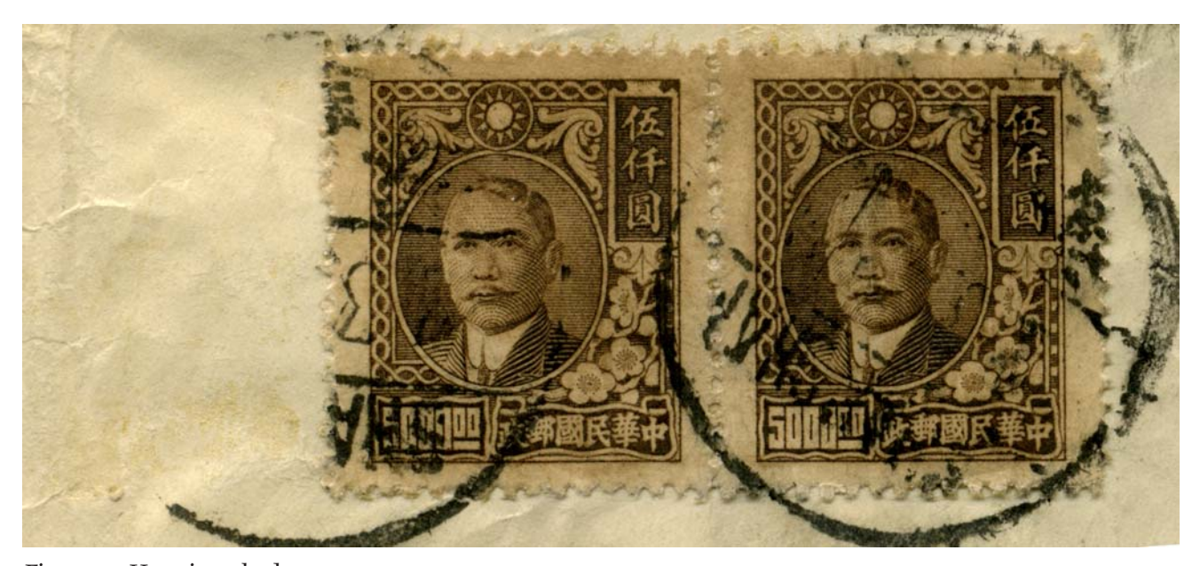
Figure 4. Hanging chads

Let's see what happens if we make an assumption about the missing stamp. It was beside a pair of $5,000 stamps, and there are some chads remaining in the perforations on the right (Figure 4), suggesting that the missing stamp was part of a strip of three (this is discussed in more detail in the Appendix). If we assume that the missing stamp was indeed denominated $5,000 and the envelope was sent first class, can we make the rates come out right?