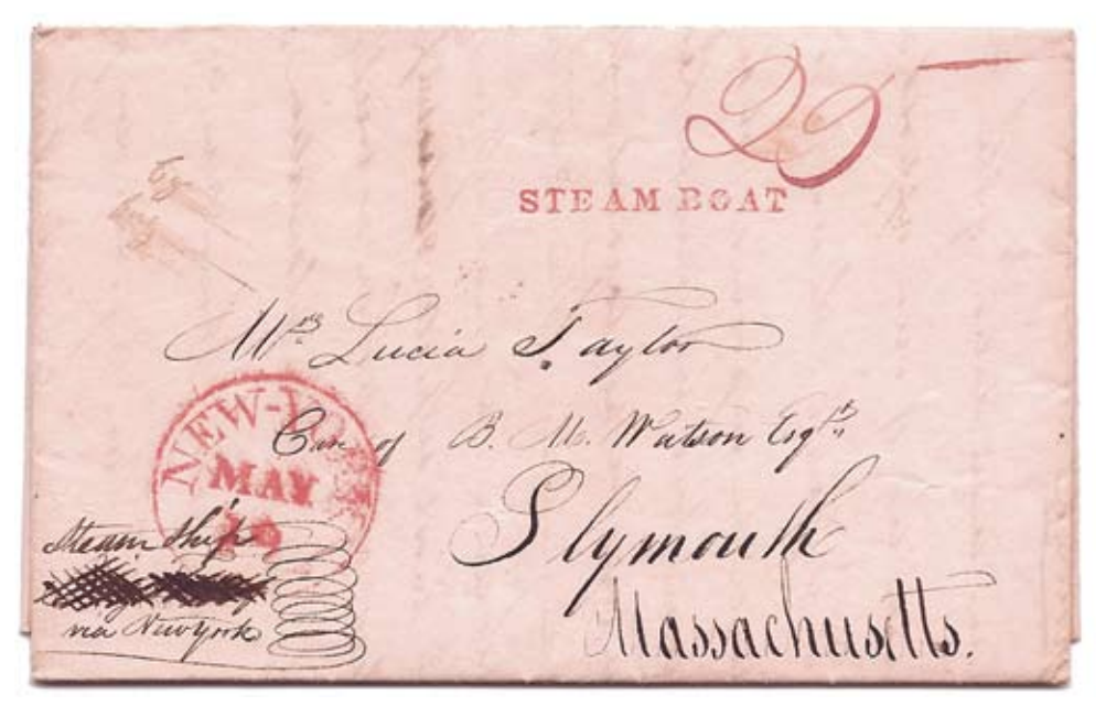
Figure 2. An 1823 letter from New Orleans carried by the steamship Robert Fulton to New York where it entered the mails and was rated as a steamboat use (carried over a postal route) shortly after this new rating procedure had been announced.

Ship sailing information for this voyage of the Robert Fulton , shown in Figure 4, was compiled from various newspaper notices. The steamer departed New Orleans with the Figure 2 cover on May 1, 1823, making stops at Havana and Charleston on her way to New