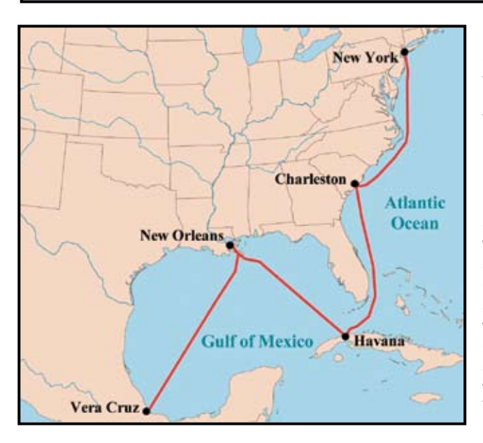
Figure 4. Above, sailing dates for the spring 1823 voyage of the steamship Robert Fulton from New York to Vera Cruz and back. Information compiled from contemporary newspaper sources. Dates in italic type are approximations based on the best information available. The full voyage is diagrammed on the map at left. The Figure 2 cover travelled on the return trip only, boarding the steamship at New Orleans and travelling onward to New York City.