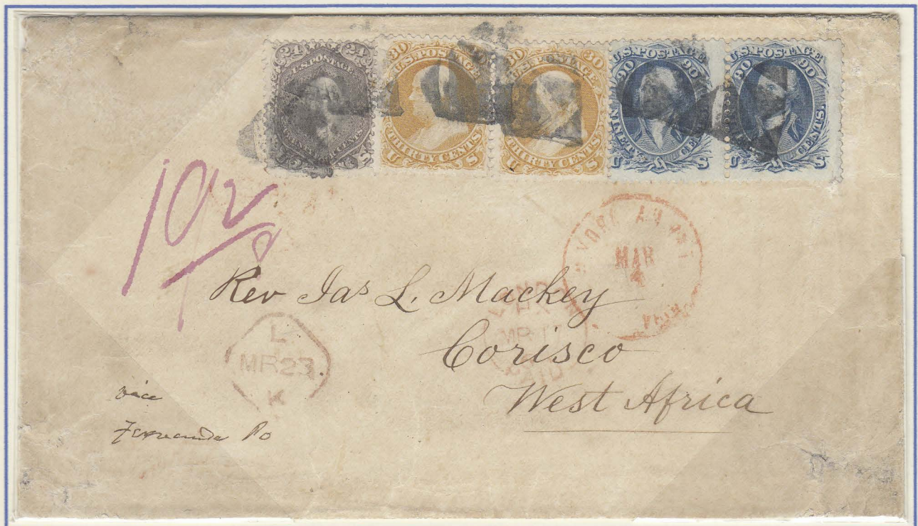
British mail, American packet via Fernando Po to Corisco Island , now claimed by Equatorial Guinea