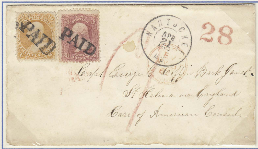
British mail, British packet to St. Helena (1200 miles West of African coast)