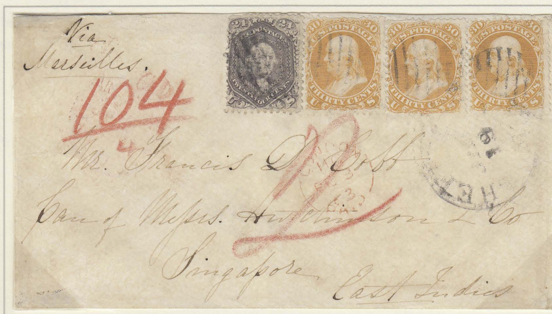
British mail, via Marseilles to Singapore, East Indies

2nd French rate step, 1st British rate step