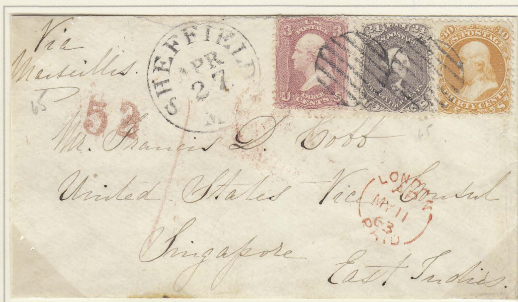
British mail, via Marseilles to Singapore, East Indies

57 cents for 1/4 - 1/2 oz. 12/61 - 6/63 e