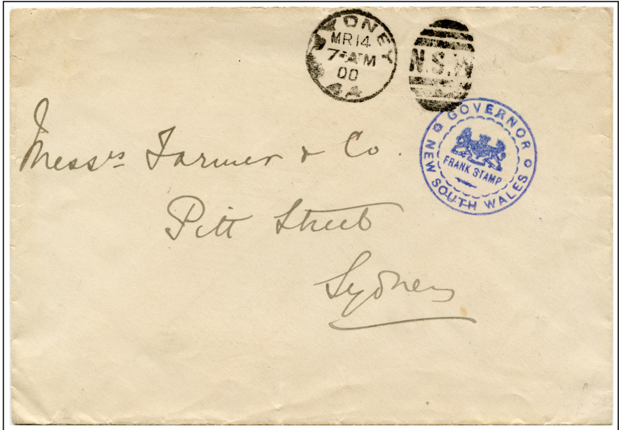
Sydney March 1900, in blue. Type 1 Government House red seal.