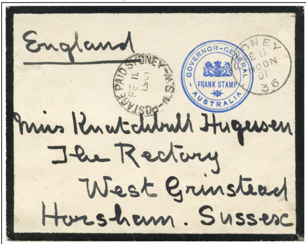
Sydney February 1901. Front only with "POSTAGE PAID SYDNEY NSW" handstamp indicating no postage due.