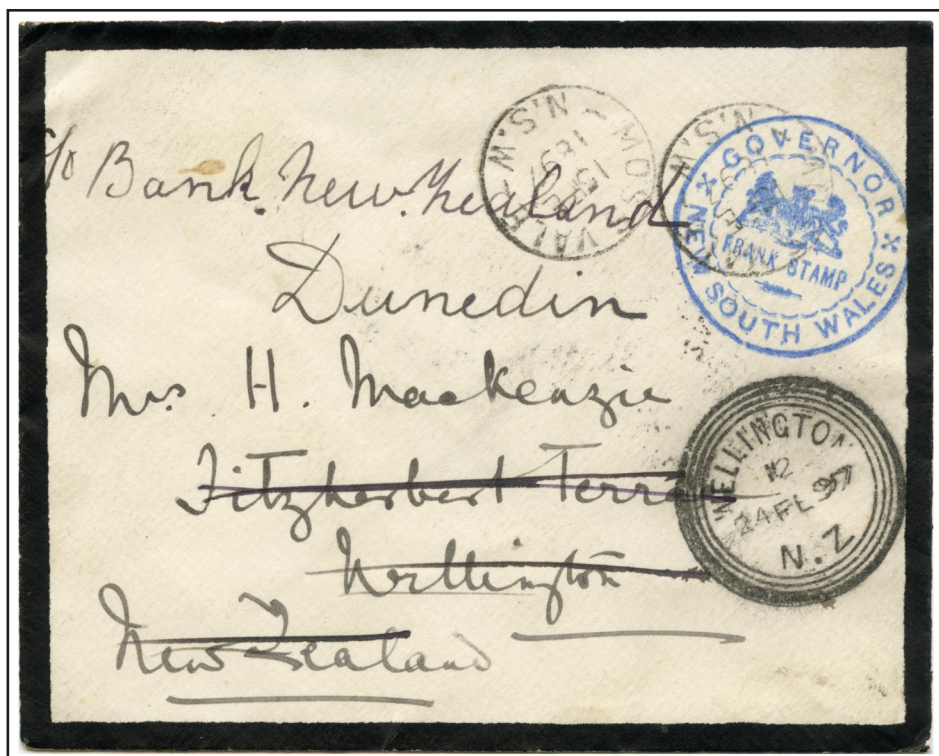
Moss Vale, February 1897. Cover forwarded from New Zealand North Island to South Island. Missing required "POSTAGE PAID SYDNEY NSW" handstamp. Type 1 Government House black seal.

Less than ten recorded uses outside of Sydney