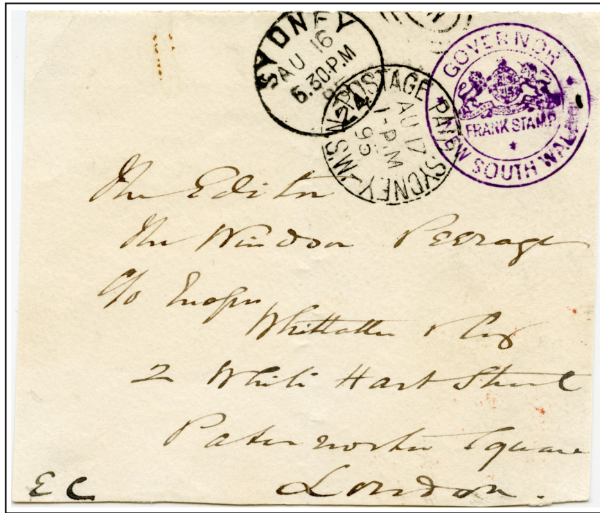
Sydney March 1900, in purple on front. "POSTAGE PAID SYDNEY NSW" handstamp indicates no postage due.