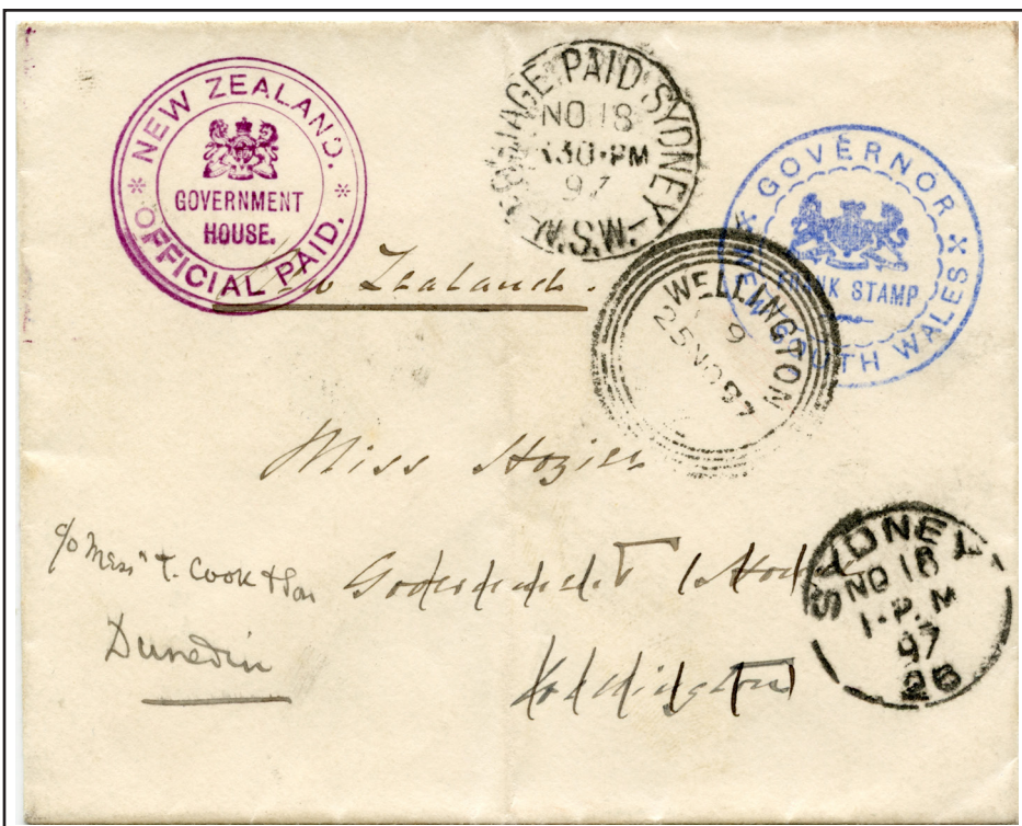
Sydney November 1897. "POSTAGE PAID SYDNEY NSW" handstamp indicates no postage due. Type 1 Government House red seal. Cover reentered into the mail with the New Zealand Governors "Government House Frank".