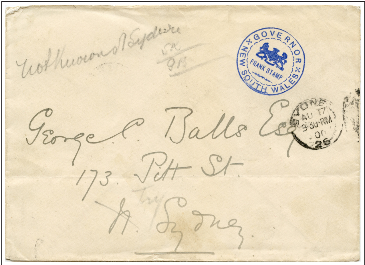
Sydney August 1900 . Type 1 Government House black seal, normally on mourning covers.