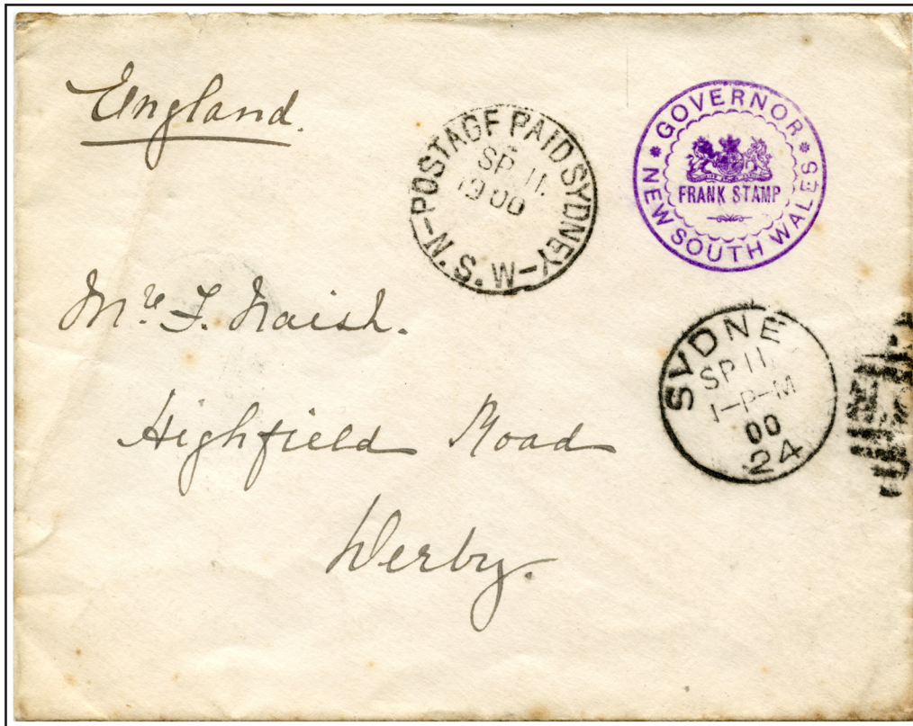
Sydney September 1900. "POSTAGE PAID SYDNEY NSW" handstamp indicates no postage due. Type 2 Government House red seal. Most recorded Type 2 seals are black.