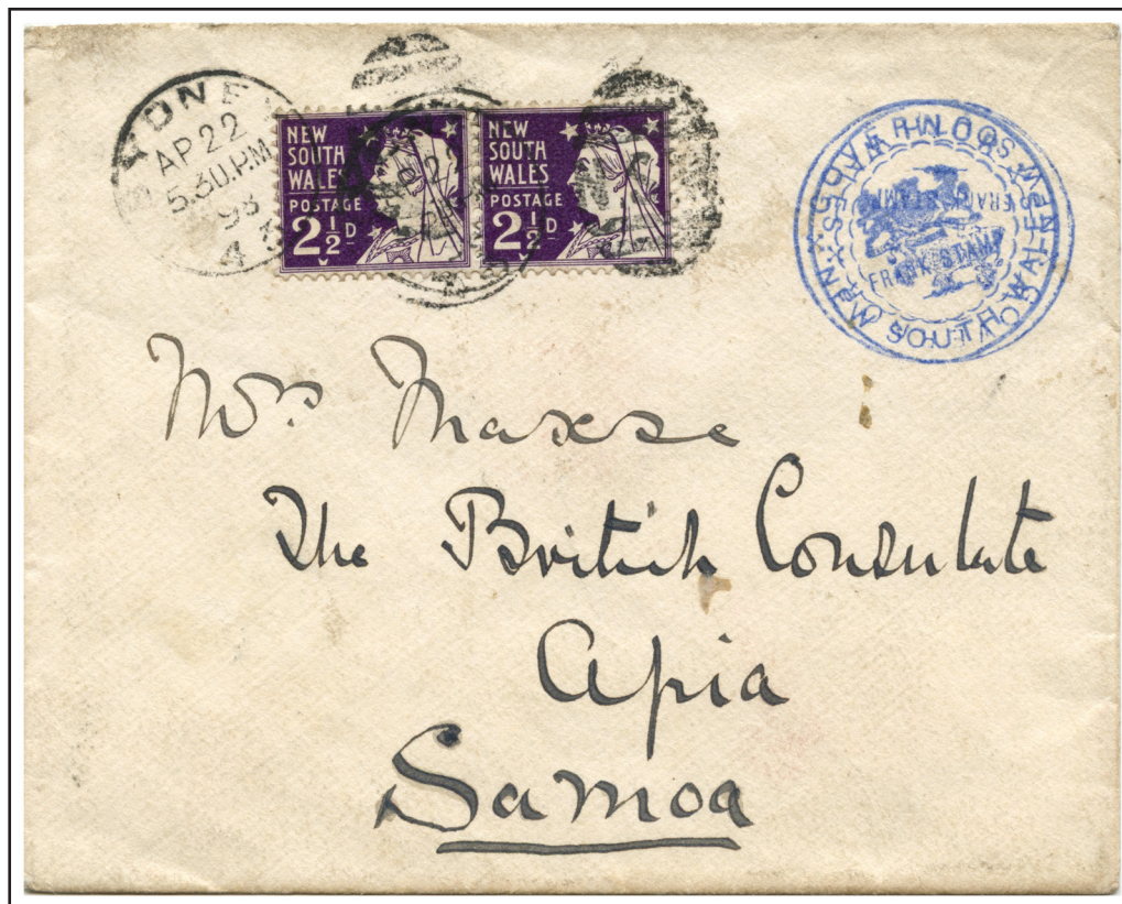
Sydney April 1898, 5d double UPU rate. Type 1 Government House red seal. Only recorded NSW Governors Frank to a non-British Empire country