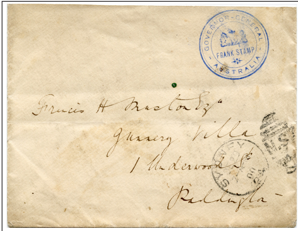
Sydney December 1900. Type 1 Government House red seal.

On January 1, 1901 the Commonwealth of Australia became an official entity of the British Empire. The Governor-General of Australia arrived on December 15, 1900 in Sydney and was provided a Frank Handstamp for his mail as a courtesy. Below are two Governor-General Free Franks. One before and one after he was officially in charge.