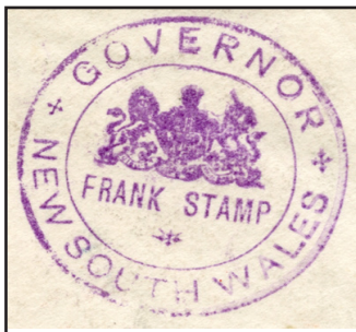
Type 1 N300.1 Frank

On the back flap of the envelopes are red and black seals. These seals were used exclusively by the Governor. Black seals are usually on mourning covers.