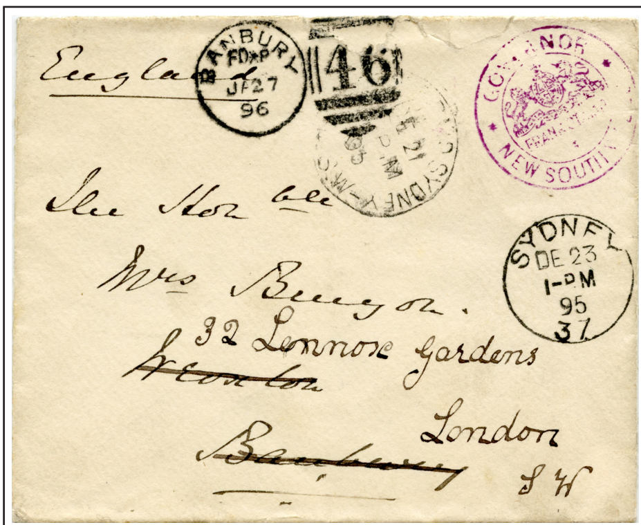
Sydney December 1895, in maroon. "POSTAGE PAID SYDNEY NSW" handstamp indicates no postage due. Type 1 Government House red seal.