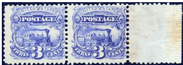
"END ROLLER" (MARGINAL) GRILL: ON SELVAGE