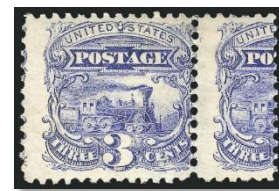
● UNIQUE "BISECT" 6 x 12