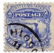
● HIO-PMK 3