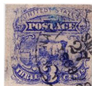
"NATIONAL BANK NOTE CO. N.Y. SEP. 27, 1869" DATE STAMP