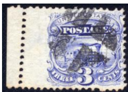
17 x 13