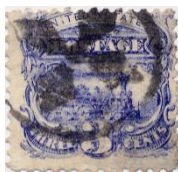
IRWIN STATION, PA