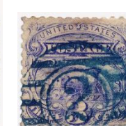
NC-4 APRIL, 1878