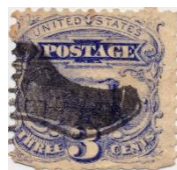
WATERBURY, CONN "CONGRESS GAITER"