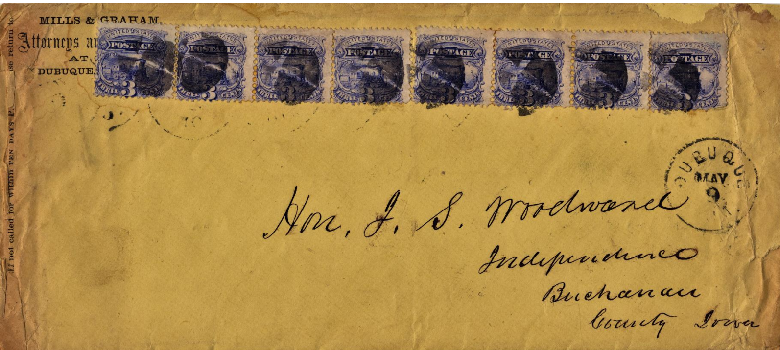
DUBUQUE, IOWA / INDEPENDENCE IOWA, MAY 9