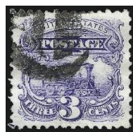
13 x 13