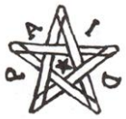
BONDS VILLAGE, MASS