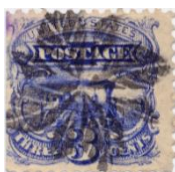
WATERBURY, CONN "HOLLY SPRIG"