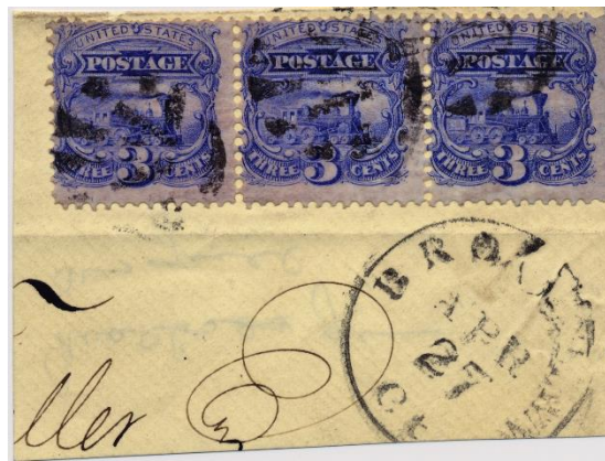
● GRAY PAPER, UNGRILLED (UNIQUE MULTIPLE ON PIECE)