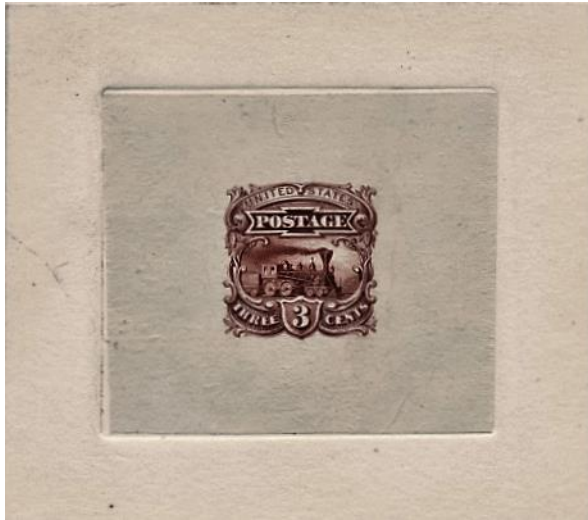
● CHOCOLATE UNIQUE ON CARD