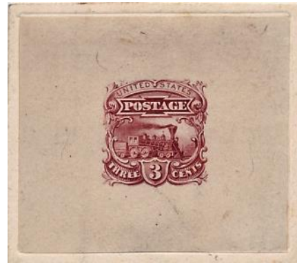
ROSE EX EARL OF CRAWFORD