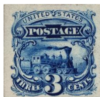
1891 ATLANTA TRIAL COLOR PLATE PROOFS