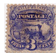
● ALL-OVER GRILL, NO DEFACEMENT