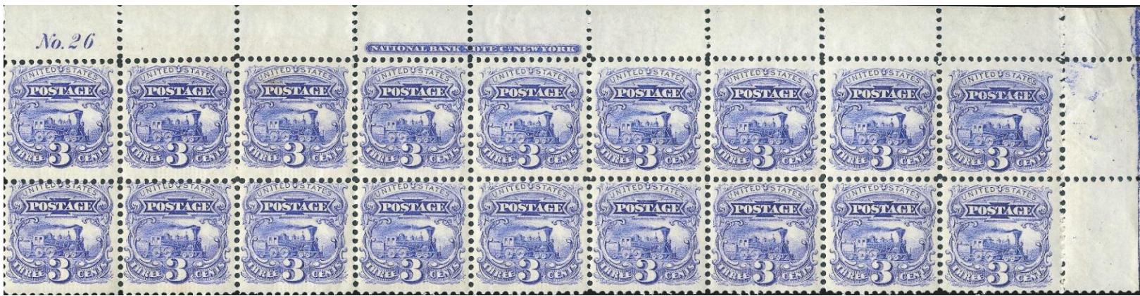
BLOCK OF 18, EX EUBANKS