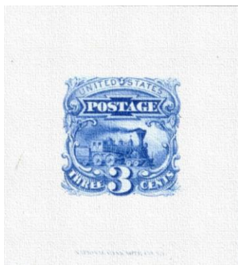
IMPRINT: "NATIONAL BANK NOTE CO. N.Y."