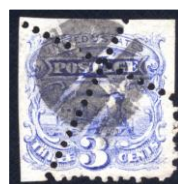
15 x 16