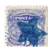
BLUE FREEPORT, ILL