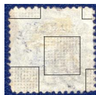
TRIPLE GRILL: A FULL GRILL AND TWO PAIRS OF SPLIT GRILLS