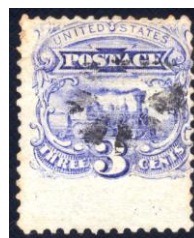
12 x 15