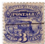
ALL-OVER GRILL, DEFACED