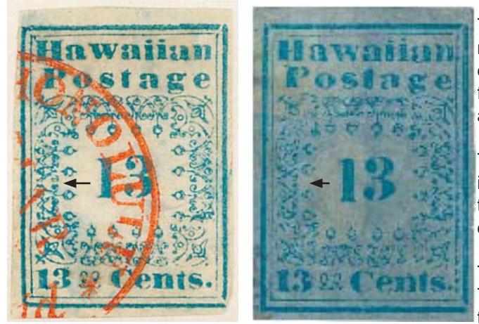
Figure 1. Genuine Missionary and "Grinnell Missionary".

Further evidence that the genuine 13¢ Type I Missionary in Grinnell's possession was used as a model to create the "Grinnell Missionaries" comes from an examination of the central heart in the left side ornaments as shown in Figure 1.