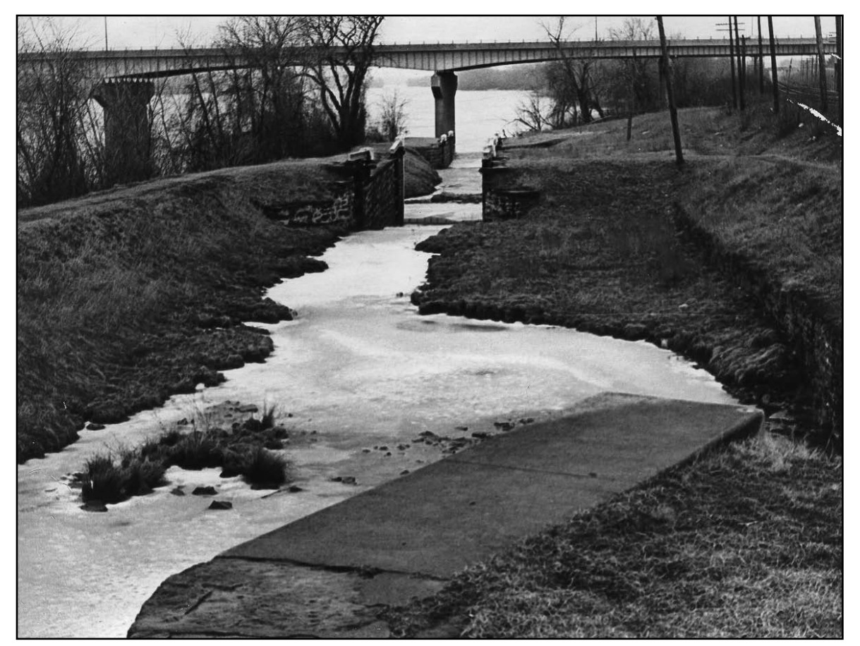
The Windsor Locks Canal looking south with the last locks opened before entering the river; I-95 bridge in background.