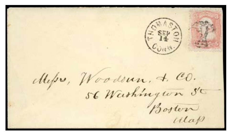
September 14, NYD Thomaston Charter Oak fancy cancel on #65 to Boston PFC #363729.

channels, sometimes called 'shading lines'. The difference is that they are cut vertically on the Windsor Locks handstamp. Of course, if the cancel was made of wood or cork, we could be looking at the grain pattern. In all likelihood however, the grain would not have been as pronounced. The passage of time has made the unanswered questions unanswerable.