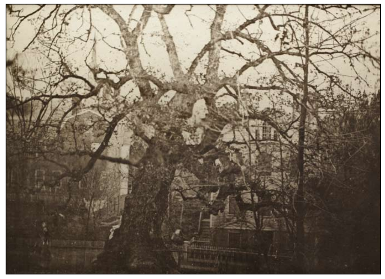
The Connecticut Charter Oak tree standing on Wylls Hill in 1855 photographed just one year prior to its demise by Nelson Augustus Moore.

Fast-forward 170 years. Imagine the great storm that occurred August 21, 1856, which caused the demise of the cherished oak. At ten minutes before one o'clock in the morning high winds brought it crashing to the ground amid crackling and rustling of its heavy foliage. A city watchman who was within two hundred feet of it said that it reeled "convulsively in the air" for a moment after the fall.