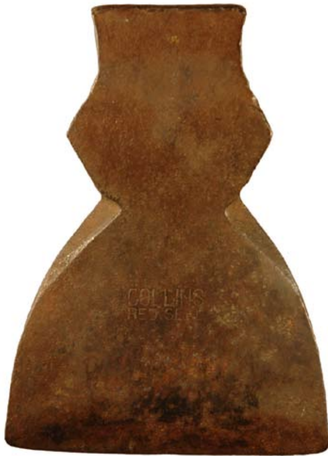
Collins Red Seal Broad Head Hatchet Blade Design similar to postal markings