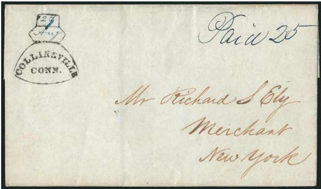
Collinsville August 12, NYD — Large Axe postmark to New York.