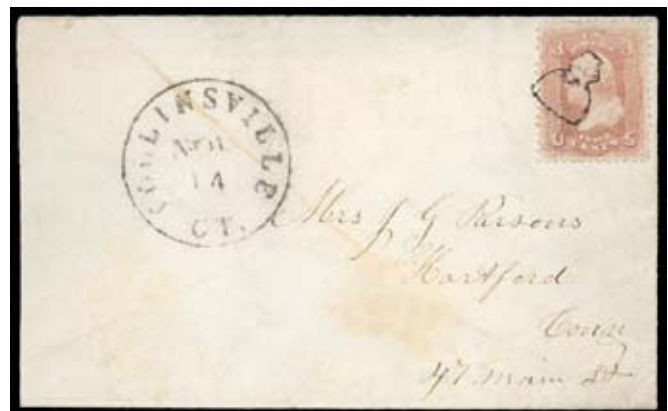
Black 32mm COLLINSVILLE/CT. Nov 14, NYD CDS, with Hatchet fancy cancellation tying Sc #65