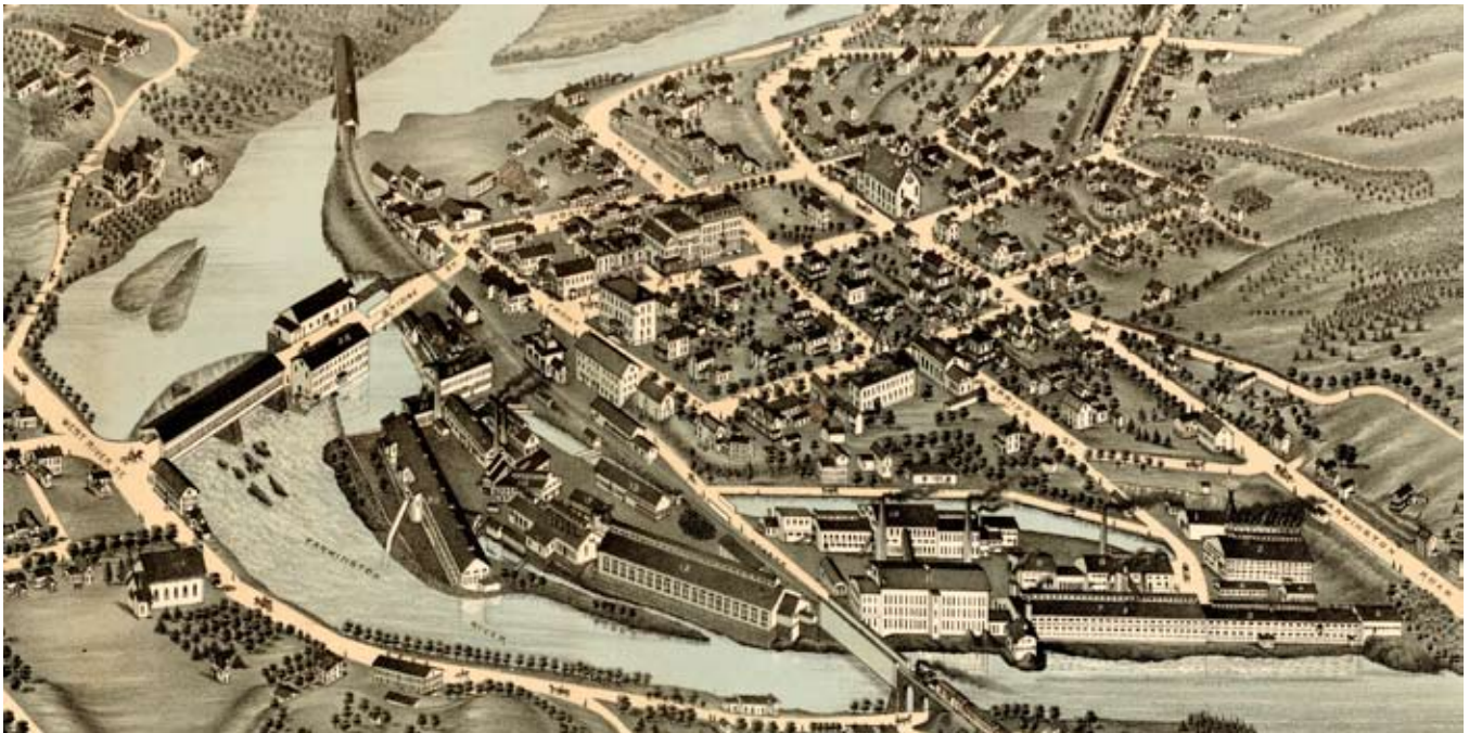
Collins Axe Factory in Collinsville, Connecticut ~ Published by O.H. Bailey & Co., 1878