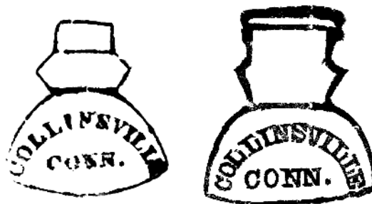
Side by Side Comparison —

A census of the three 19th Century Collinsville axes has been compiled and is included at the end.