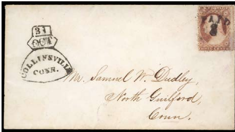
Collinsville October 31, NYD — Latest recorded Large Axe postmark (with month and day in type) and also the only recorded example used with an adhesive (Sc #25)