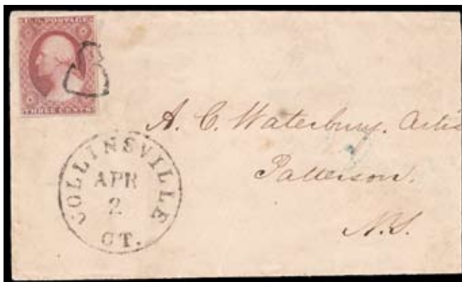
Black 32mm COLLINSVILLE/CT. Apr 2, NYD CDS, with Hatchet fancy cancellation tying Sc #11 (Roger Curran Collection)

A fancy cancellation usually referred to as the 'Collinsville Small Axe' also makes an appearance. Not many dated examples survive. It was found obliterating the following: Scott 3¢ #11 1851 (1 example), #26 1857 (3), #64b 1861 (1), #65 1861 (9), and U35 Pink on Buff PSE 1861 (2). Based on the issue dates of the stamps, we can at least establish the general period of use as the 1850s-1860s. Virtually all are found used in conjunction with the aforementioned COLLINSVILLE/CT. style cds. The design is again based on the same Collins Company pattern. It is illustrated and listed as a Broad Head "Hatchet" in a Collins catalogue, therefore, we should more properly call the fancy cancel The Collinsville Hatchet .