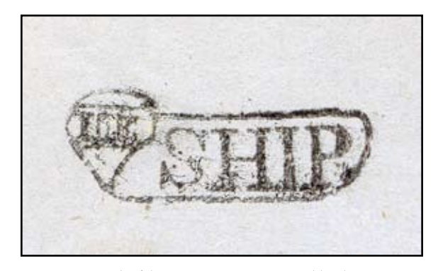
An example of the New Haven SHIP pictorial handstamp.

Fate stepped in. Shortly thereafter, I was at a Kukstis sale and noted a cover with the well-known New Haven SHIP pictorial marking of 1816-57, but showing a 12\frac{1}{2}\phi rate, which wasn't a ship rate. A ship cover going into New Haven would be rated 6\phi . On examining the cover I had a rare moment of philatelic epiphany (keep in mind, epiphanies can be wrong). The contents were zany — reminiscent of the Beehives. The docketing included the revelatory phrase Burying Ground Fair . Now I had to grapple with the Beehive.