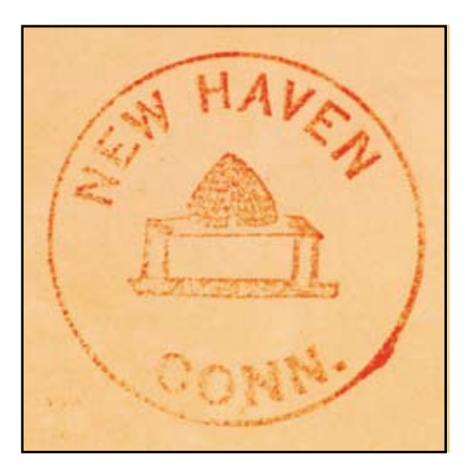
UNC find strike detail.