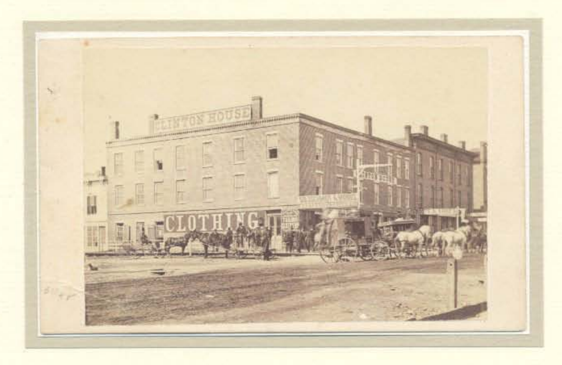
SAINT PETER. Cover bearing the corner card of the CLINTON HOUSE in Lyons, Iowa, used from Saint Peter M.T. The little photograph shown above pictures the CLINTON HOUSE with two stagecoaches.