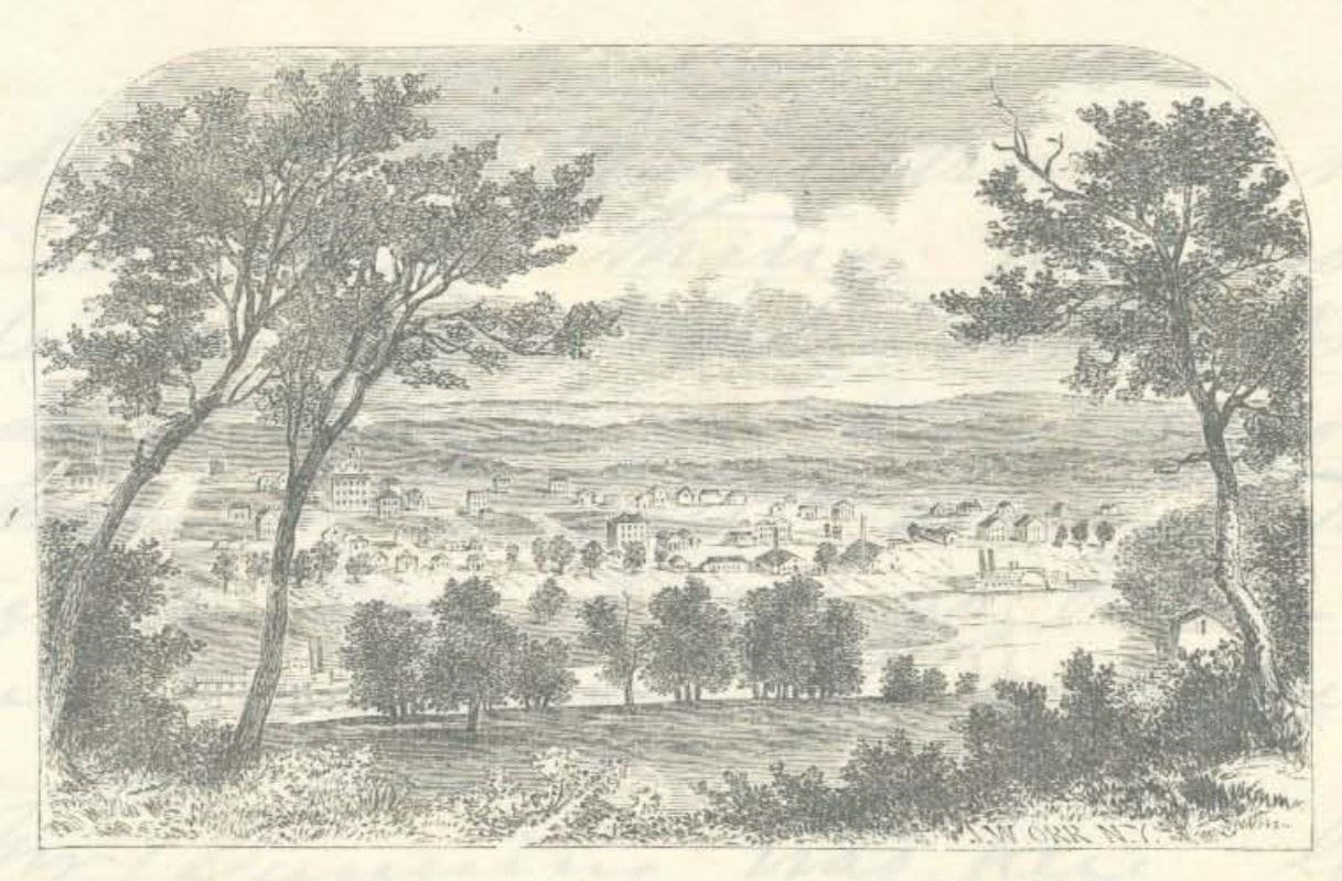
VIEW OF ST. PETER, MINNESOTA, ON THE MINNESOTA RIVER.