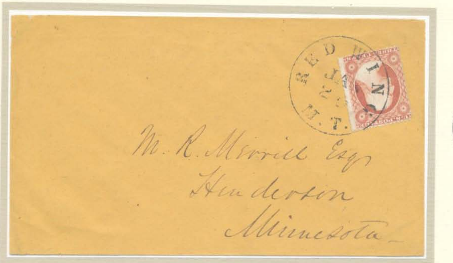
RED WING. This is Type III and the most common of the territorial handstamps in both red and black.