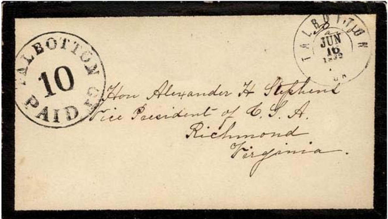
16 June 1862: Talbotton to Richmond, Virginia Lot 2695 from Schuyler Rumsey sale #34 (2009).

Even after Confederate postage stamps had been issued, postmaster's provisionals continued to be infrequently used. The postage on this next cover may have been purchased prior to the availability of adhesive stamps, or perhaps the Talbotton post office was temporarily out of stamps during June 1862.