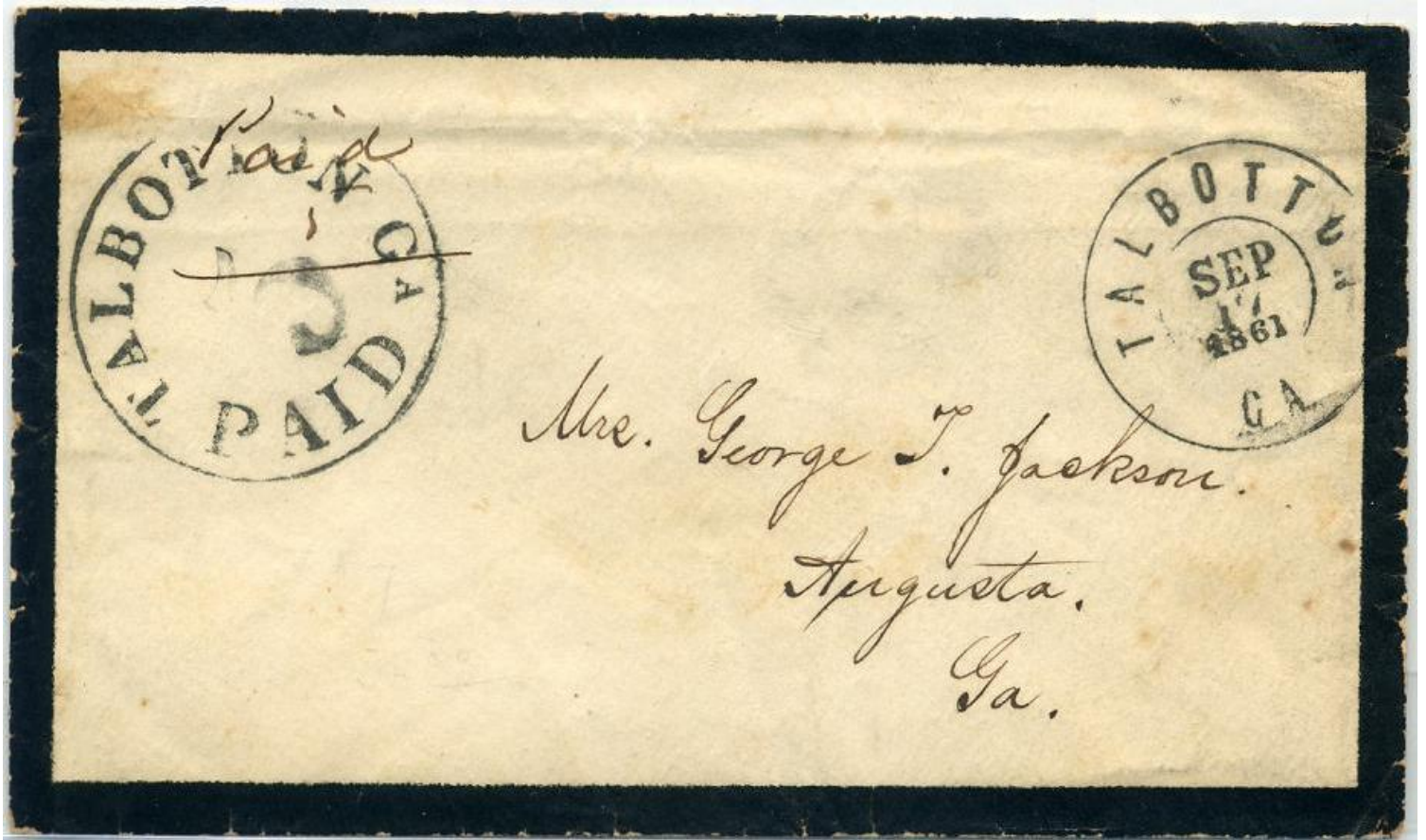
17 September 1861: Talbotton to Augusta, Georgia

A second five-cent cover from the Jackson correspondence: