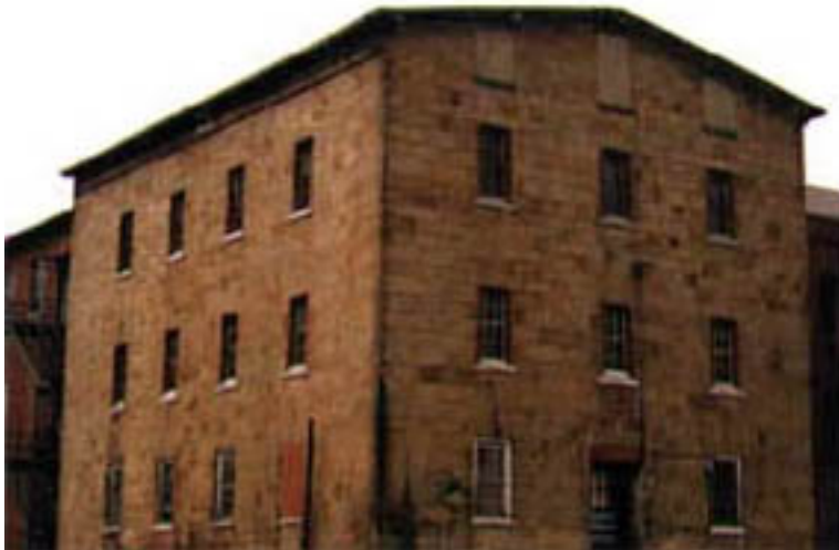
Photo of remaining portion of Jackson's Mill.