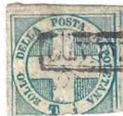
comes se-tenant with Trinacrie, W-3 B-50