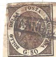
B-36 (Private Reprint)