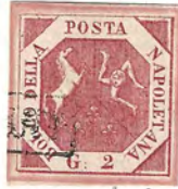
onegrata B-13; E-2 (engraved)