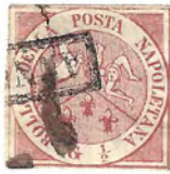
W-1 (similar to B-3,4&5)