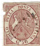
(close to E-2) E-1