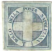
Panelli (engraved) - differs - Oneglia* B-47'