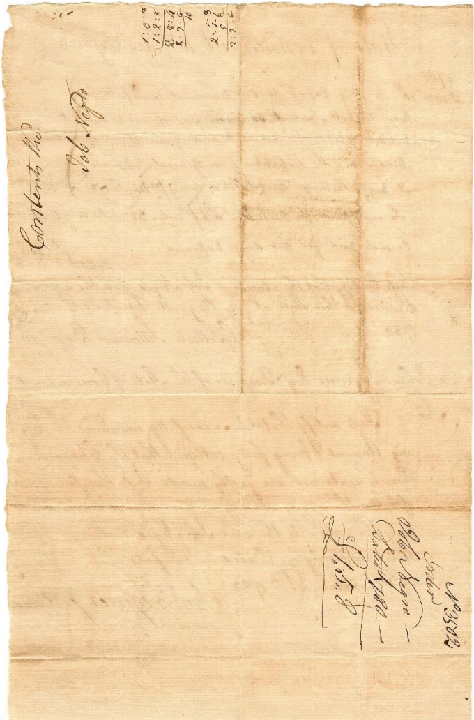
Contents Rec<sup>d</sup> Job Nergro