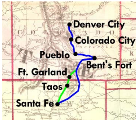
Figure 4. Map of military route (green) and mail route (blue) between Santa Fe and Denver City.