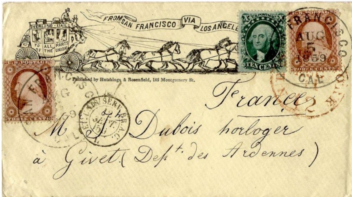
Figure 2. An “endorsed” cover authorizing carriage overland rather than by the “Via Panama” default in August 1859.

The first government contract mail service between New York to San Francisco was inaugurated in 1848. This mail service utilized the route via the Isthmus of Panama with steamers operating on the Atlantic and Pacific Oceans. Although multiple routes for mail carriage became available in the period after 1850, the “Via Panama” service remained the default until December 15, 1859, when the Southern, or “Butterfield,” overland route became the default for letter mail from San Francisco to New York. Prior to that date a sender was required to endorse the cover to be sent overland for it to be sent on the overland route. An example, with the stage coach illustration and slogan serving as an endorsement, is shown in Figure 2.