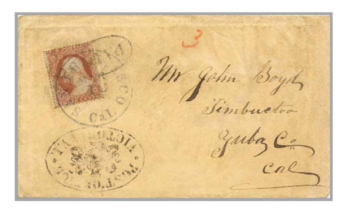
Datelined San Juan Feb. 20<sup>th</sup> 1861 - sent to Victoria with 8¢ cash - 5¢ for Coat of Arms frank Red "3" indicates prepayment of 3¢ US rate to West Coast - 1857 3¢ stamp affixed at Victoria San Juan Island was jointly occupied by the US and England after the 1859 "Pig War"

The "Post Office Victoria" Coat of Arms frank was used to prepay VI colonial postage from September 1860 to February 1863. Franked envelopes could be purchased at the Victoria post office.