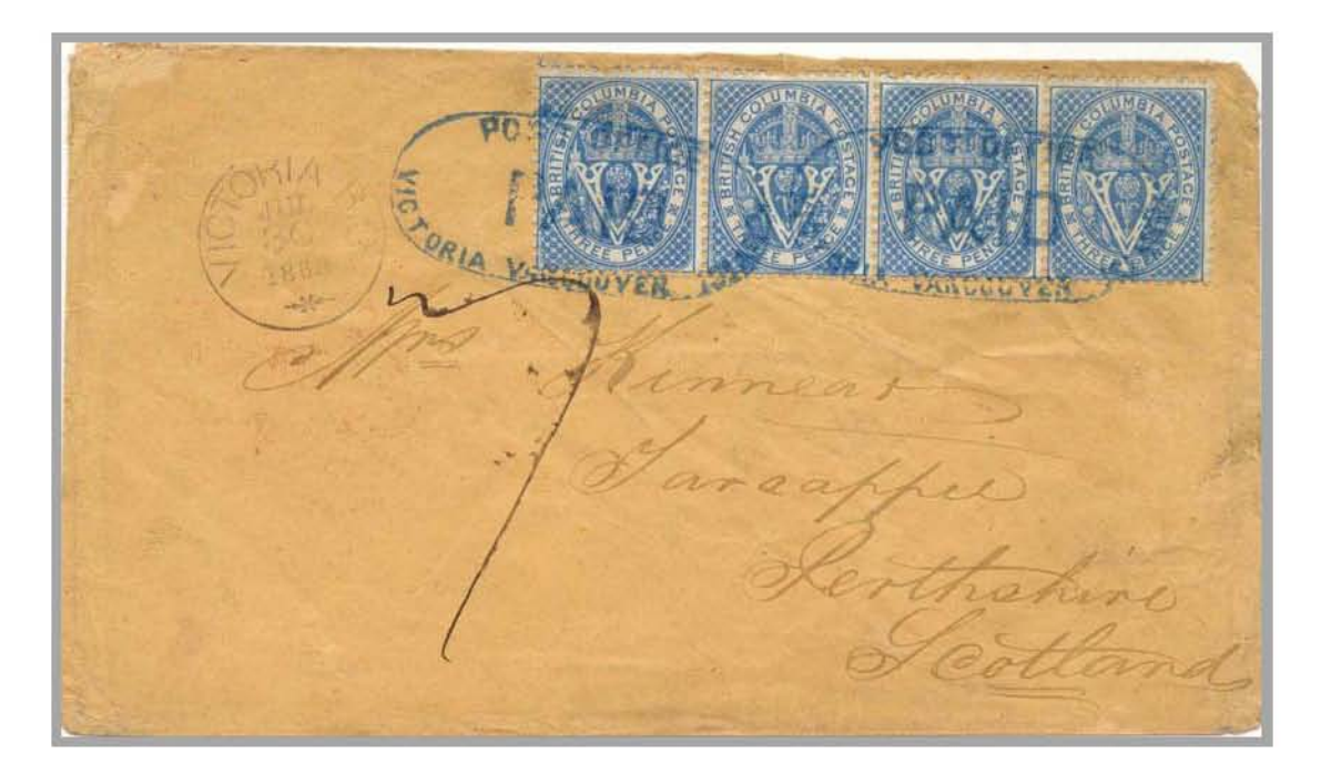
Posted July 30, 1868 in Victoria - 1865 BC 3d (2<sup>nd</sup> printing) strip of 4 fully paid the 25¢ rate Sent via San Francisco, Panama and New York to Scotland - incorrect 7d due assessed

Posted February 8, 1868 in London - 1865 3d and 4d stamps paid the 7d rate - received April 7