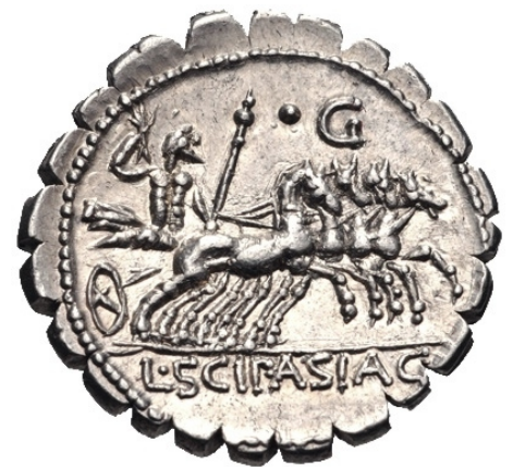
denarius serratus, 4.02 grams

Reverse: Jupiter driving fast quadriga right, preparing to cast thunderbolt with right hand and holding scepter and reins in left, L. SCIP. ASIAG in exergue; control letter •G above