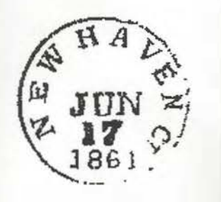
NEW HAVEN C<sup>T</sup>. 32mm CDS (Year date low) Black 1861 -