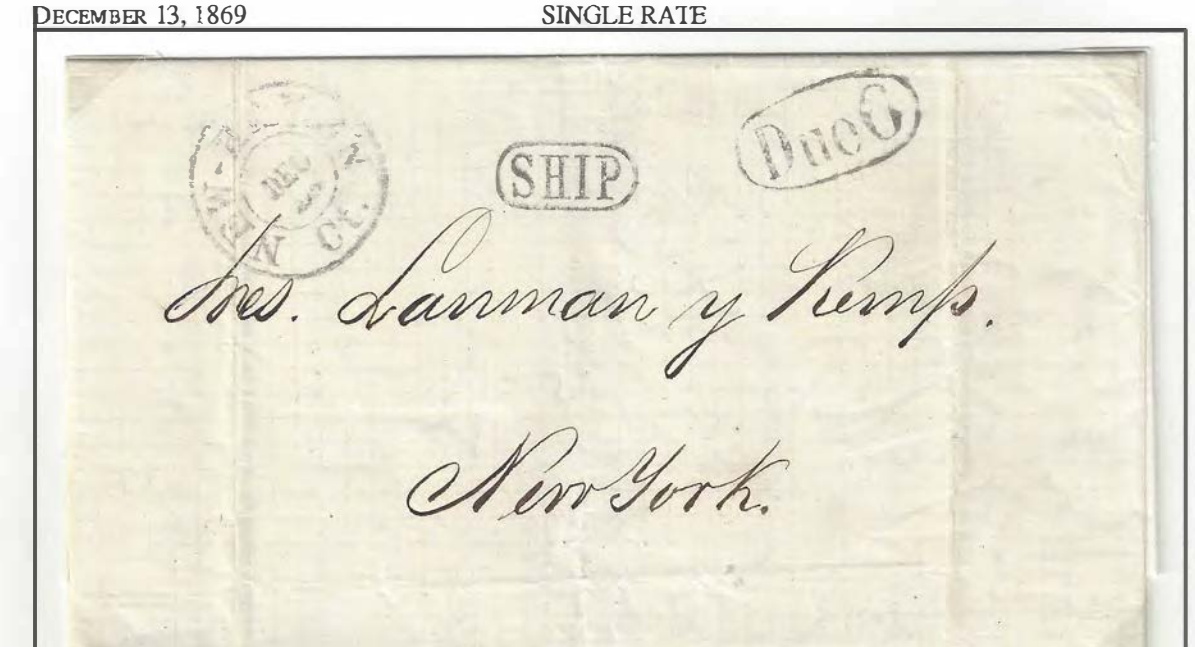
ARROYO, PUERTO RICO; NOVEMBER 18, 1869