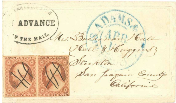
Figure 8-8. March 1854 New York letter given to the Accessory Transit Co. for transport to California.

Transcontinental express companies continued to utilize the Nicaragua route throughout its existence. Figure 8-8 shows a March 1854 westbound example handled in San Francisco by Adams & Company. This March 1854 letter was given to the Accessory Transit Company in New York City. It was prepaid the required six cents postage by a pair of 1851 three cents stamps, and marked with the Accessory Transit's oval marking, "Via Nicaragua in Advance of the Mail." The Star of the West left on March 20, 1854 and arrived in San Juan del Norte on March 30. It connected across the Isthmus with the Cortes , which left San Juan del Sur on April 2 and arrived in San Francisco on April 16. It was given there to Adams & Company, which added their April 16 San Francisco marking, and forwarded the letter to Stockton, entirely outside of the U.S. mails.