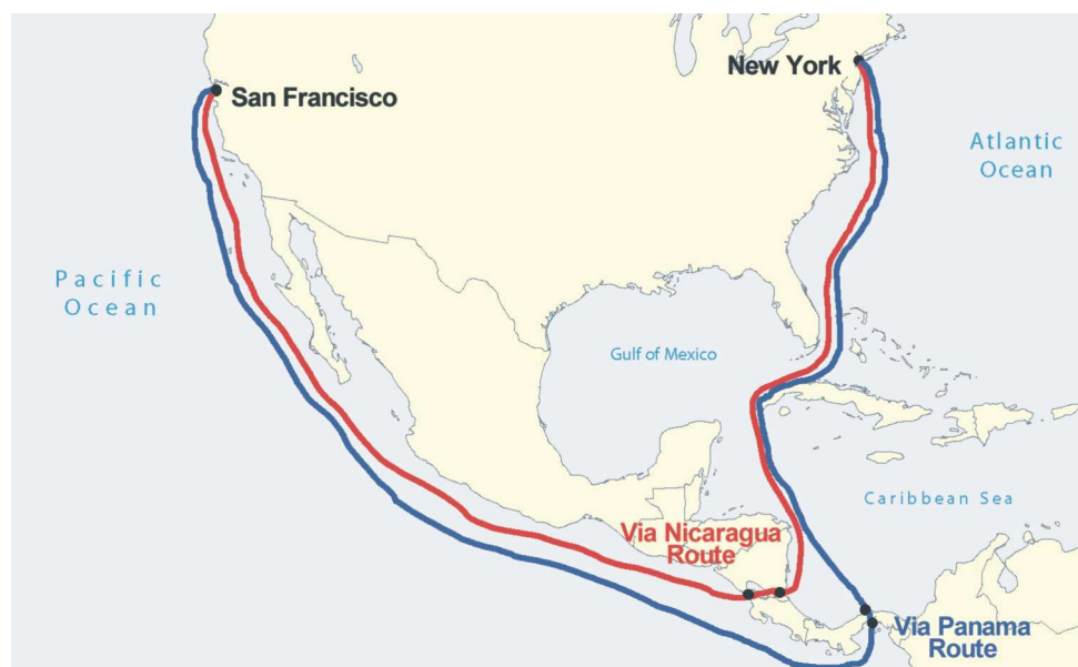
Figure 8-1. Map of the Nicaragua (red) and Panama (blue) transits.

Figure 8-1 shows the relative positions of these two routes. It is clear from the map that the Nicaragua route had the advantage of being shorter than the Panama route. What is not as obvious is that the