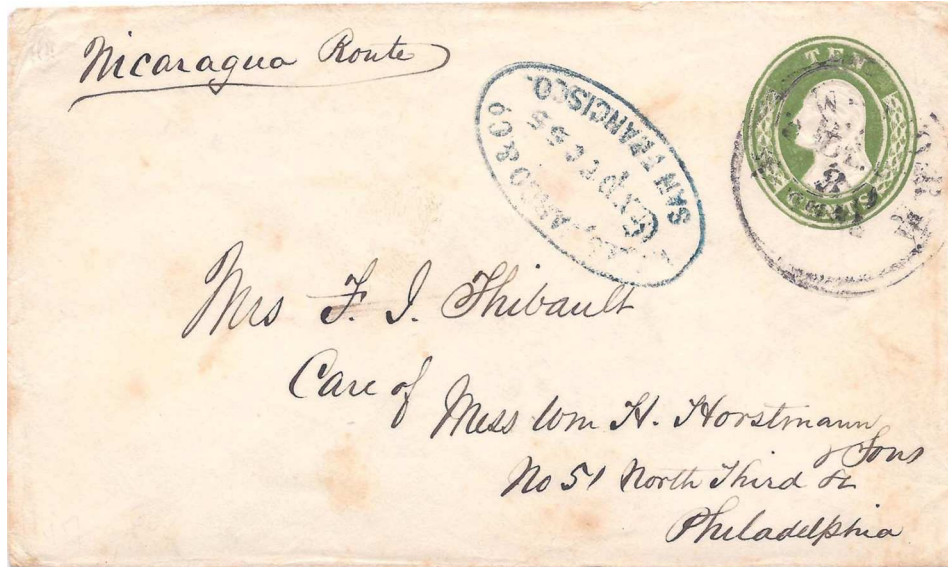
Figure 8-10. December 1855 San Francisco letter given to Wells, Fargo & Co. for forwarding to Philadelphia via Nicaragua and New York.

Wells Fargo also patronized this route. Figure 8-10 shows a late example. This December 1855 letter was enclosed in a 10 cents Nesbitt stamped envelope and entrusted to Wells, Fargo & Company for forwarding