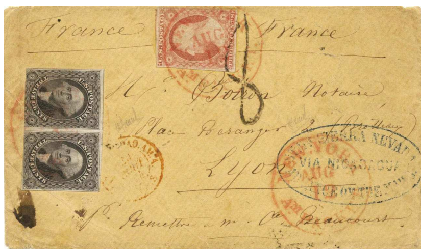
Figure 8-7. July 1854 San Francisco letter given to the Accessory Transit Co. for transport to France via Nicaragua and New York.

The steamship Sierra Nevada also had a publicity handstamp of its own. Figure 8-7 shows an example on an unusual July 1854 letter to France. This letter was given to the Accessory Transit Company in San Francisco, which applied its blue “Stmr Sierra Nevada via Nicaragua ahead of the Mails” oval handstamp. It was overpaid by one cent in stamps of the 1851 issue for the 26 cents transcontinental postage to France. 12 The Accessory Transit’s Sierra Nevada left on July 15, 1854 and arrived in San Juan del Sur on July 28. The letter then