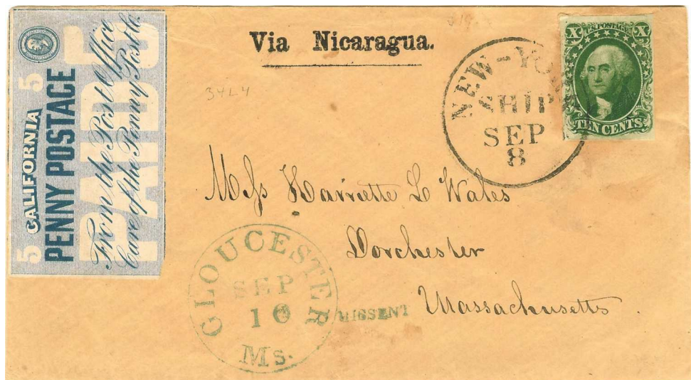
Figure 8-9. August 1855 San Francisco letter given to the Accessory Transit Co. for transport to Massachusetts via Nicaragua and New York.

San Francisco's Penny Post Company also sent mail via Nicaragua. Figure 8-9 shows a striking example. This August 1855 letter was enclosed in a "Via Nicaragua" envelope and entrusted to the Penny Post Co. for forwarding to Massachusetts. Per the large blue label, the sender paid 5 cents to the Penny Post for this service, and added an 1855 10 cents stamp for the transcontinental postage. 15 The Penny Post took the letter to the Accessory Transit steamship Uncle Sam , which left San Francisco on August 18, 1855 and arrived in San Juan del Sur on August 29. This was just after William Walker had taken control of the western side of the transit route, and he had to be persuaded to let the passengers and mail through. 16 Nonetheless, the letter connected across the Isthmus with the Northern Light , which left San Juan del Norte on August 31 and arrived in New York on September 8. It entered the U.S. mails on that day, per the "New-York Ship" postmark, and was sent onward to Massachusetts.