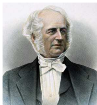
Cornelius Vanderbilt Transportation Tycoon 1794-1877