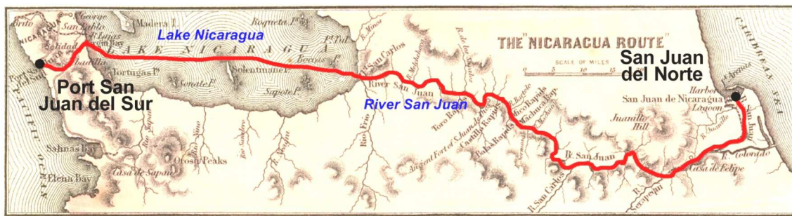
Figure 8-2. Map of the route across the Isthmus of Nicaragua.

Figure 8-2 shows a map of the Nicaragua transit. The route ran along Nicaragua's southern border with Costa Rica. Starting in the east at San Juan del Norte, a river steamer would carry passengers up the San