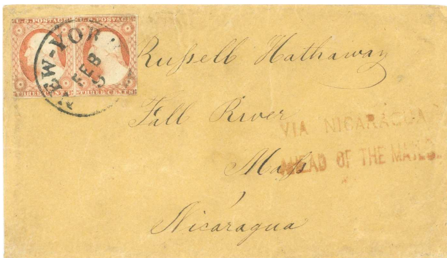
Figure 8-6. January 1854 San Francisco letter given to the Accessory Transit Co. for transport to New York via Nicaragua.

left on January 16, 1854 and arrived in San Juan del Sur on January 28. It connected with the Star of the West at San Juan del Norte, which departed on January 31 and arrived in New York on February 9. The letter entered the U.S. mails that day at the New York post office.