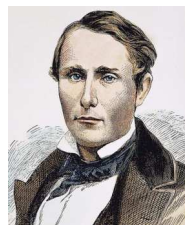
William Walker American Filibusterer, 1824-1860

Meanwhile, Vanderbilt was maneuvering to re-gain control of the Accessory Transit Company from