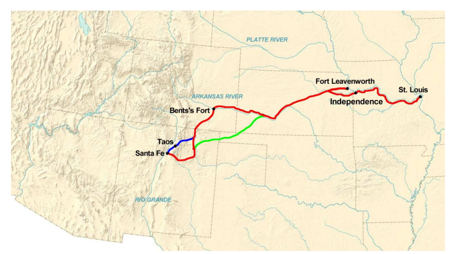
Figure 2-1. Santa Fe Trail (in red), Cimarron Cutoff (in green) and the alternate Taos route via Palo Flechado Pass (in blue).