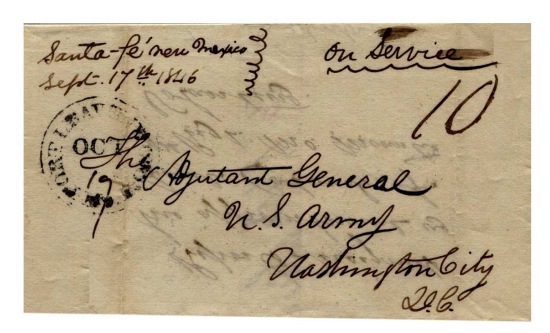
Figure 2-8. September 17, 1846 letter from Santa Fe to Washington, D.C. that entered the mails at Fort Leavenworth on October 17.

An example of military mail carried from occupied Santa Fe is shown in Figure 2-8. This letter was endorsed "Santa – Fé New Mexico, Sept 17<sup>th</sup> 1846" and addressed to the Adjutant General of the U.S. Army at Washington, D.C.. It was carried with the military mails to Fort Leavenworth where it was postmarked on October 17 and rated for 10 cents postage due.