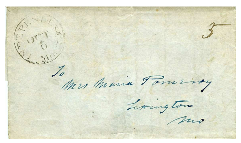
Figure 2-7. August 30, 1846 letter from Santa Fe to Missouri that entered the mails at Independence on October 5.

Mail from the Army of the West was carried by military couriers who typically travelled to Fort Leavenworth. However, as seen in Figure 2-7, the bulk of the letters from traders seems to have been carried by returning traders to Independence.