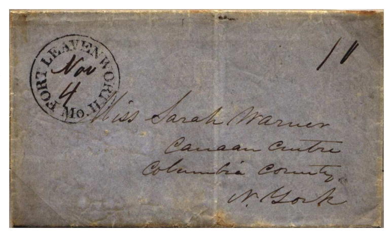
Figure 2-10. October 2, 1846 letter written "120 miles west of Santa Fe" to New York that entered the mails at Fort Leavenworth on November 4.

At least one mail is known from Kearny's column while it was travelling to California. A letter (Figure 2-10) carried in