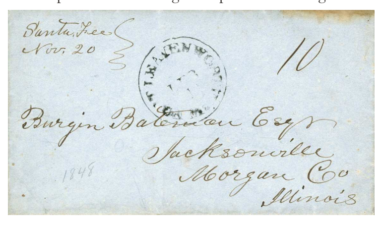
Figure 2-11. November 20, 1848 letter from Santa Fe that entered the mails at Fort Leavenworth on February 1, 1849.

Kearny encountered Kit Carson near Valverde, New Mexico on October 6. Carson was travelling east with dispatches announcing the capture of Los Angeles and the subjugation of California. Upon hearing