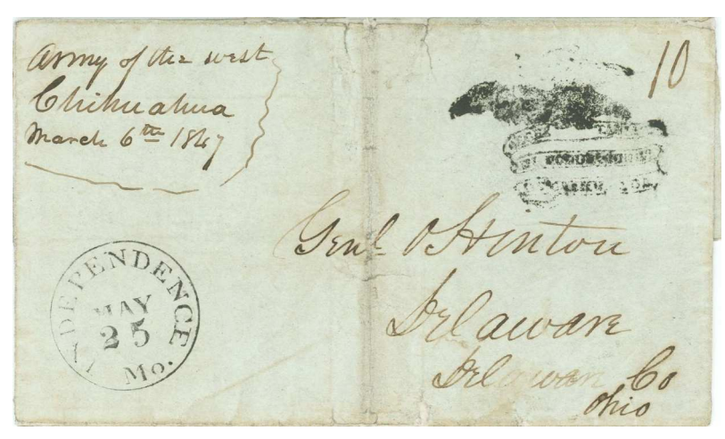
Figure 2-9. March 6, 1847 letter from Chihuahua, Mexico to Ohio that entered the mails at Independence on May 25.

The army under Col Doniphans command made a triumphial entrie into this city on the evening of the 2<sup>nd</sup> of March after a hard and well fought battle on the 28th (Sunday) of Febry. We enemy the in "Sacramento" a "rancho" about 25 miles north of this city. They had fortified themselves and mounted 12 pieces of cannon upon their works. Their full strength according to their adjutant's account (which we found upon the field) was four thousand one hundred. Ours was 1300 but we had but about 900 men engaged in the fight.