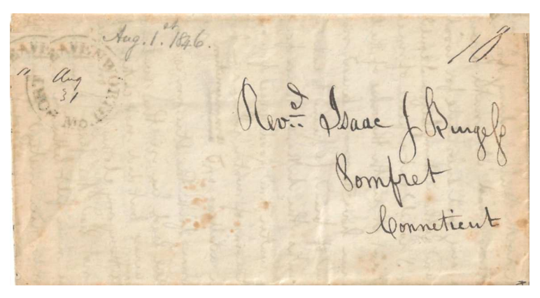
Figure 2-5. August 1, 1846 letter from Bent's Fort to Connecticut that entered the mails at Fort Leavenworth on August 31.