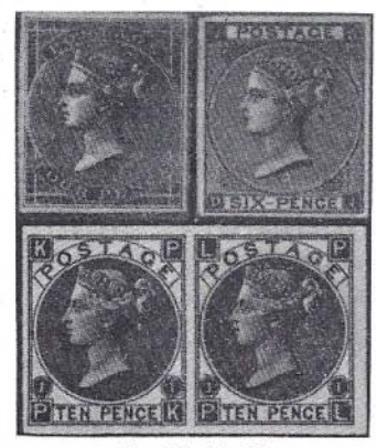
Fig. 74, 75, 76

The postal stationery had various distinctive features. The envelopes came from 1841 in three different sizes, 101x64mm., 119x71mm. and 128x84mm. The last size was soon changed to 133x86mm. and in 1857 a fourth size, 133x76mm., was added. There are numerous varieties of the shape of the flaps on the back of the envelopes. The top flap was first straight, from 1850 curved and the side flaps were first both pointed, later only one was pointed and eventually they come in various patterns. From 1850