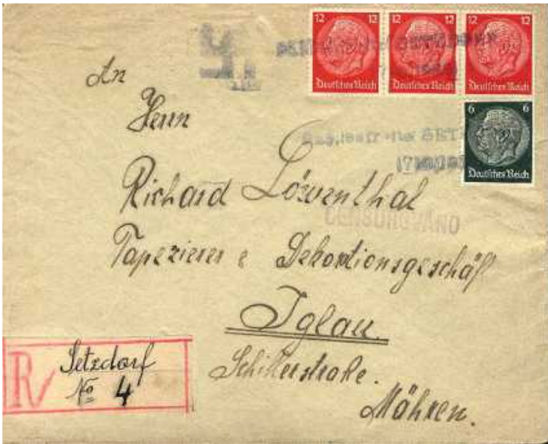
Domestic 1. weight class cover, 17 October 1938

One office even had a rubber (?) registration handstamp made.