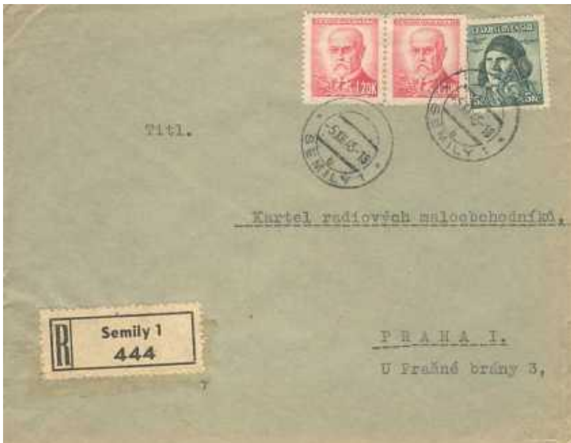
2. weight class cover with a new normal type of label, in Czech only,