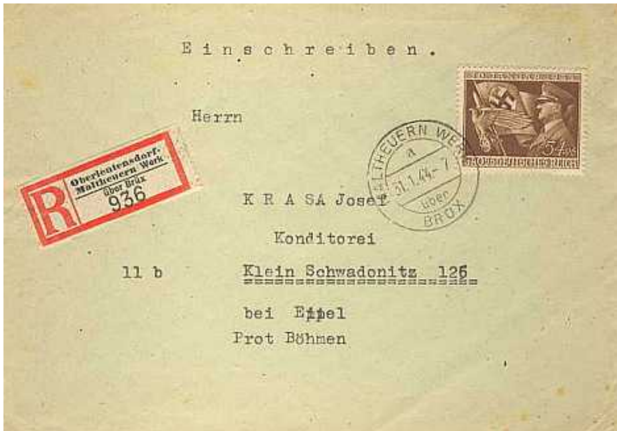
2. weight class domestic cover with a label from Maltheuern Werk, a large chemical plant, 31 January 1944.

Some large factories had it's own labels.