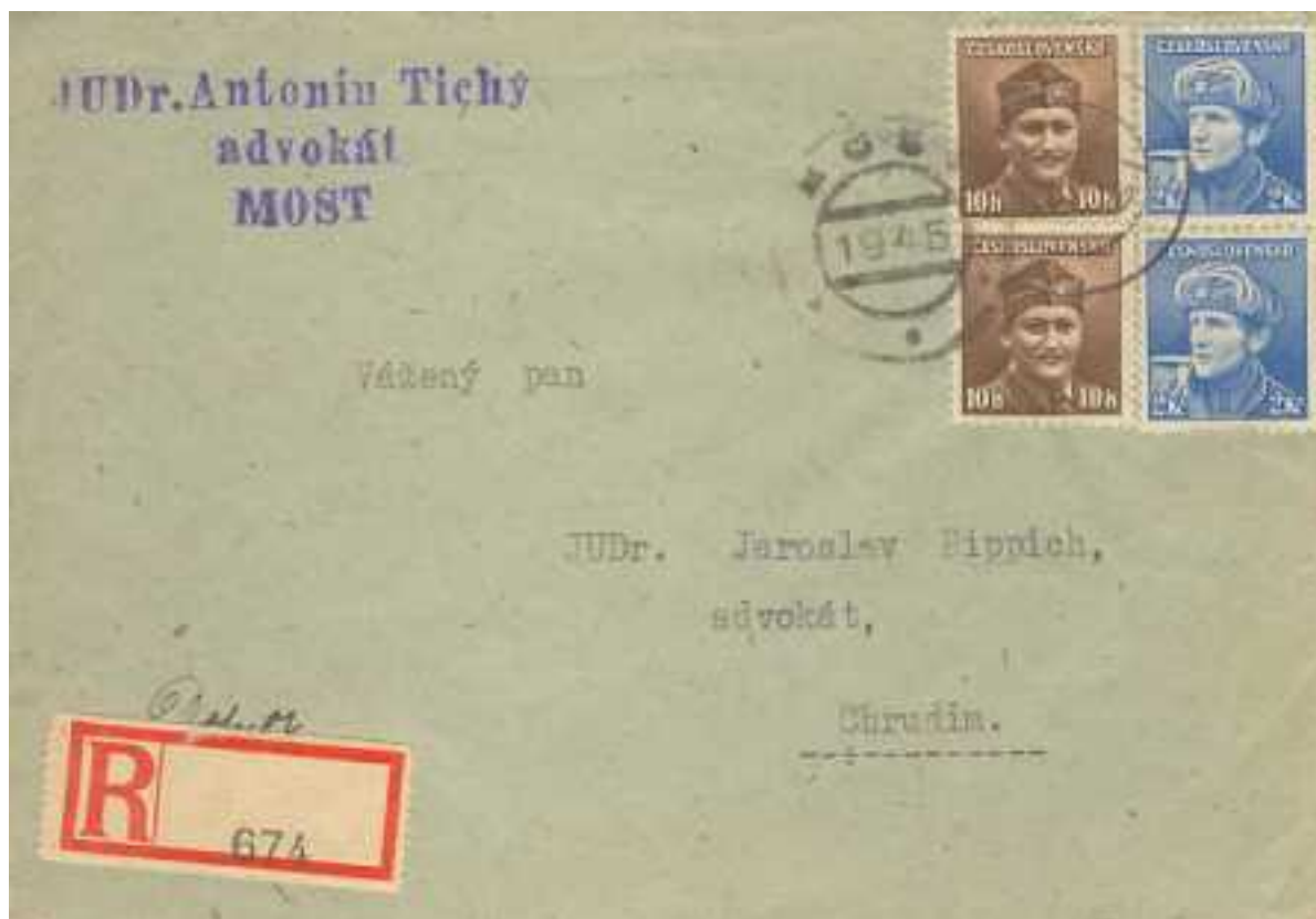
1. weight class domestic cover, 21 November 1945.