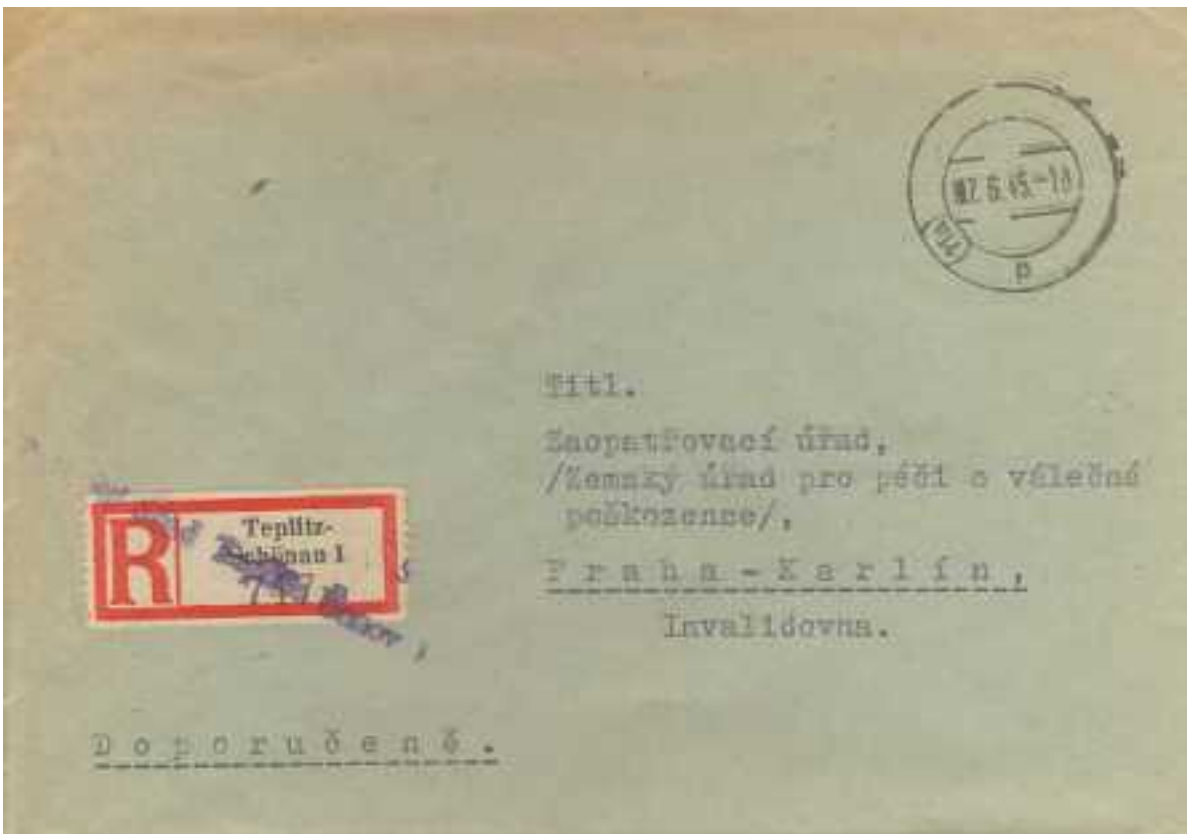
Official cover with a German label overprinted with office name in Czech, 7 June 1945

At the liberation of Czechoslovakia 8 May 1945, the history repeats itself; first, we have provisional labels: