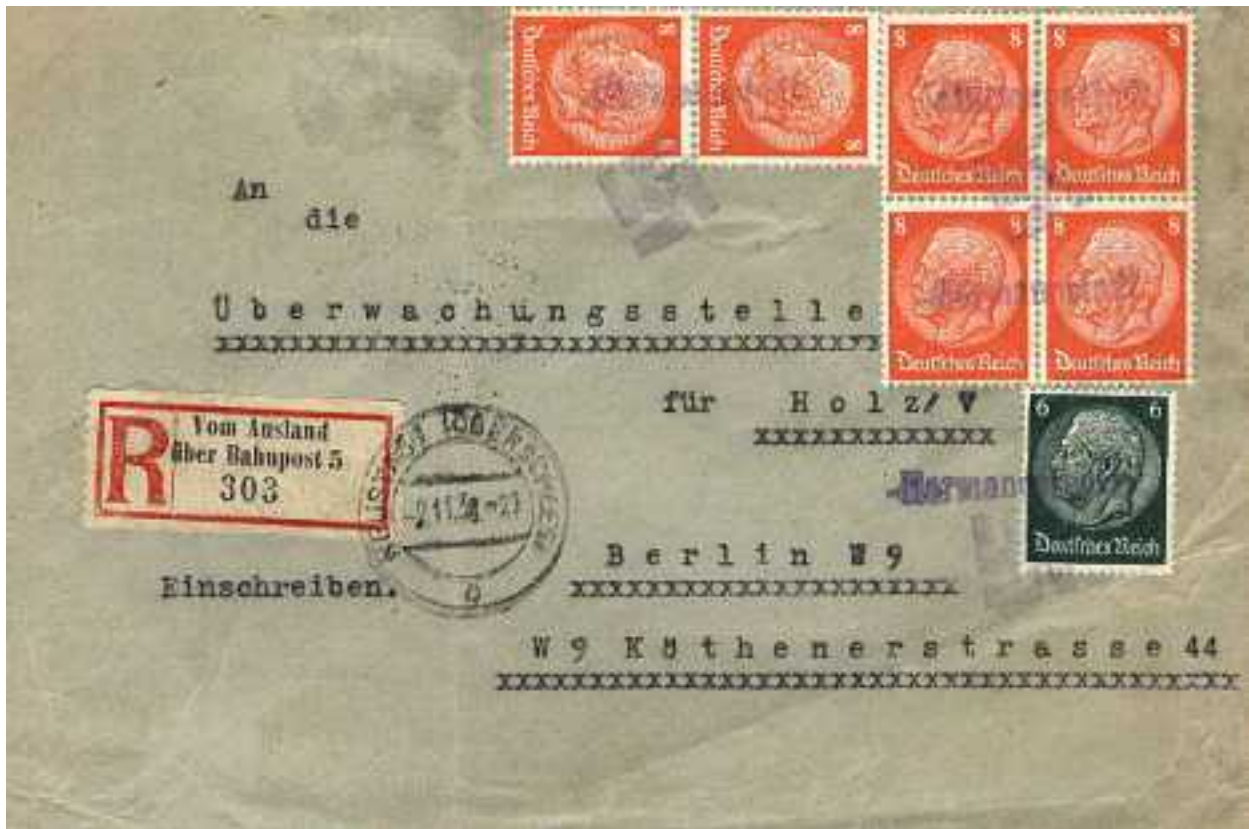
TPO (travelling post office; in this case, on a train) label applied en route to Berlin on a 2. weight class domestic cover, 2 November 1938

At some offices, a label was not used, but one was applied at a subsequent office en route.