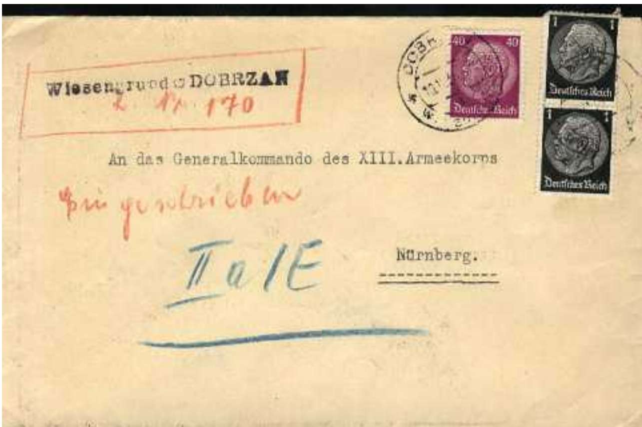
Another hand-drawn rectangular "label" on a 1 weight class domestic cover, 10 November 1938.