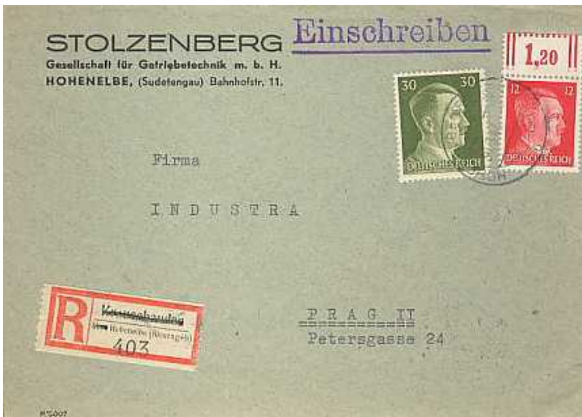
1. weight class cover to Bohemia and Moravia, with a label from a neighboring rural office, provisionally deleted to use in Hohenelbe, 30 March 1944.