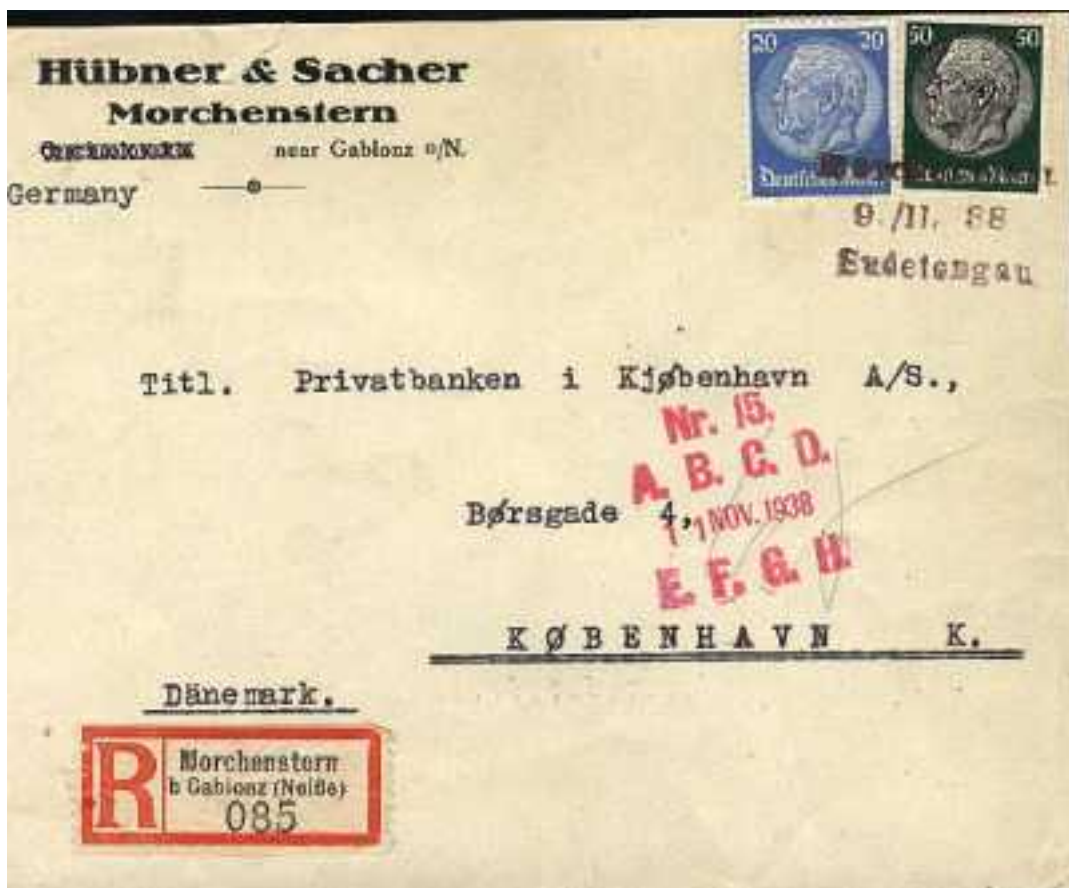
2. weight class cover to Denmark, 9 November 1938.