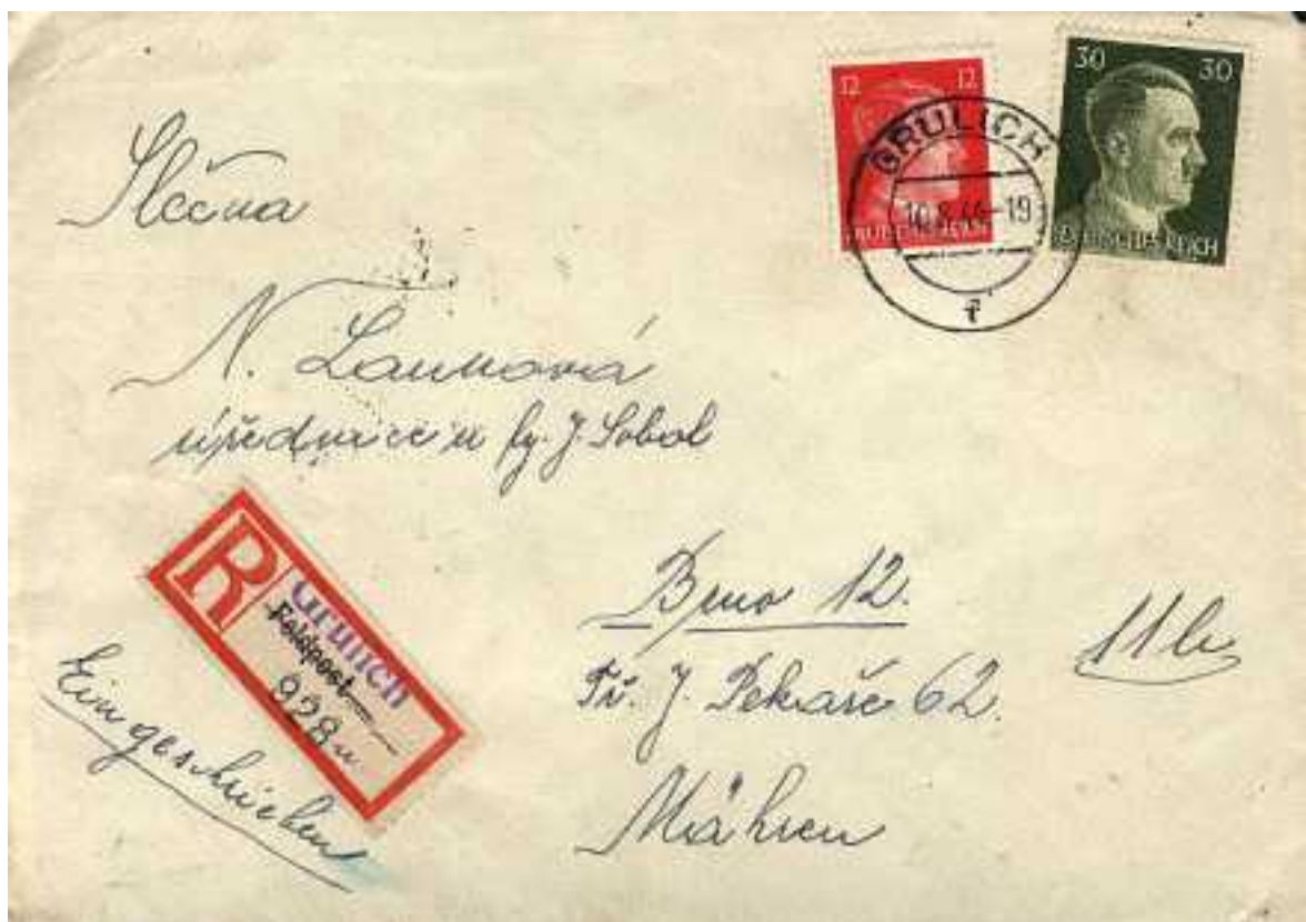
1. weight class cover with a feldpost label overprinted for use at Grulich, 10 August 1944