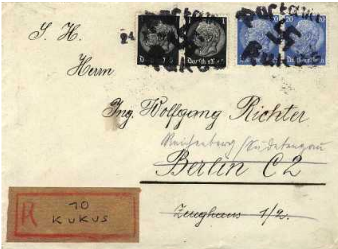
Domestic 1. weight class cover, 24 October 1938.