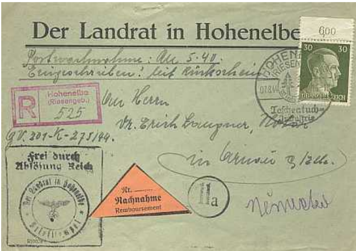
Domestic official registered COD AR cover with a provisional registration handstamp, 7 August 1944. The AR fee wasn't free for official mail.

At the liberation of Czechoslovakia 8 May 1945, the history repeats itself; first, we have provisional labels: