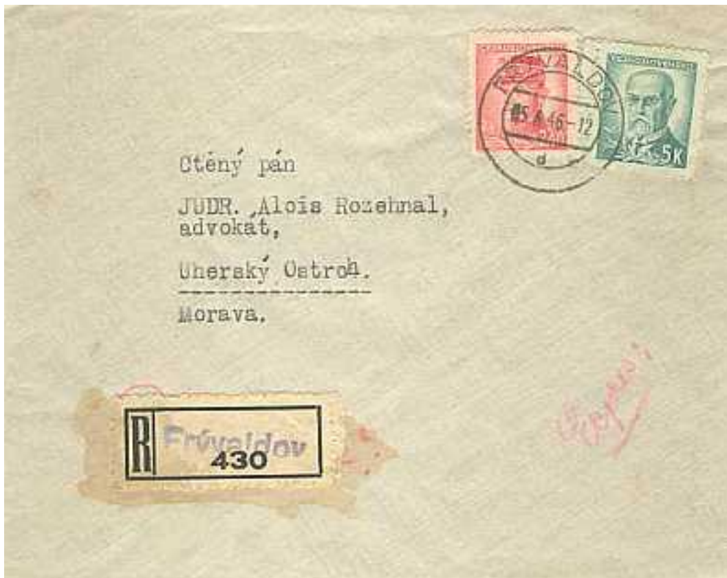
2. weight class cover with a new normal type of label, here provisional overprinted in Czech only, 5 June 1946.

Eventually the situation returned to prewar status, but only with Czech wording. - Finis Germanaie!