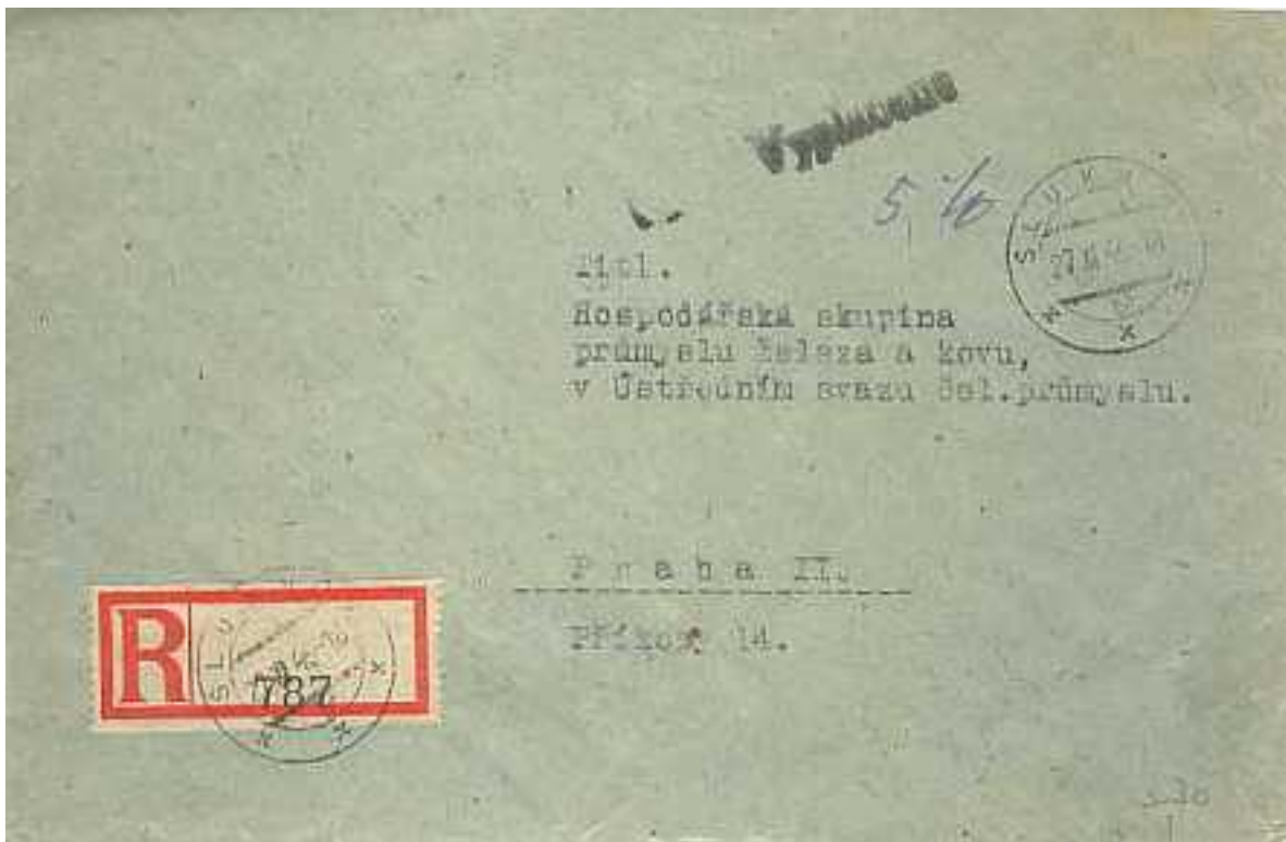
1. weight class printed matter, 27 November 1946. The postage was prepaid, due to lack of stamps.

Prewar Czech bilingual labels could be pressed into service.