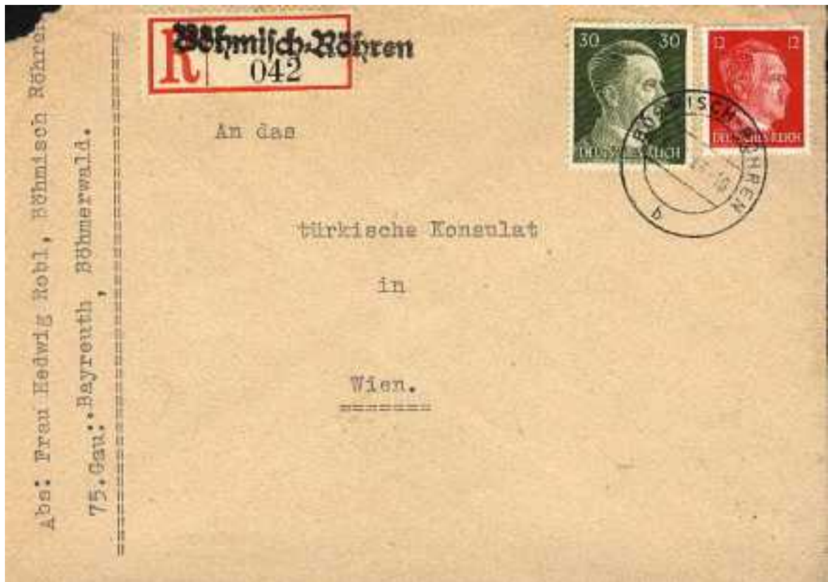
1. weight class cover with a blank Bavarian label, provisionally overprinted with a handstamp, 30 September 1943.