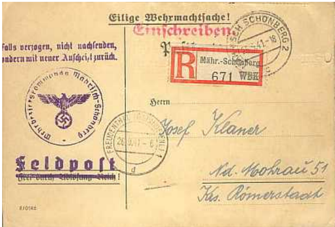
Draftcard as folded fieldpost card with a label canceled "WBK" (Wehrbezirkskommando), 26 September 1941.

Military offices, like conscription office, had own labels.