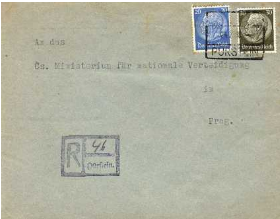
1. weight class cover to Czechoslovakia, 24 October 1938

One office even had a rubber (?) registration handstamp made.