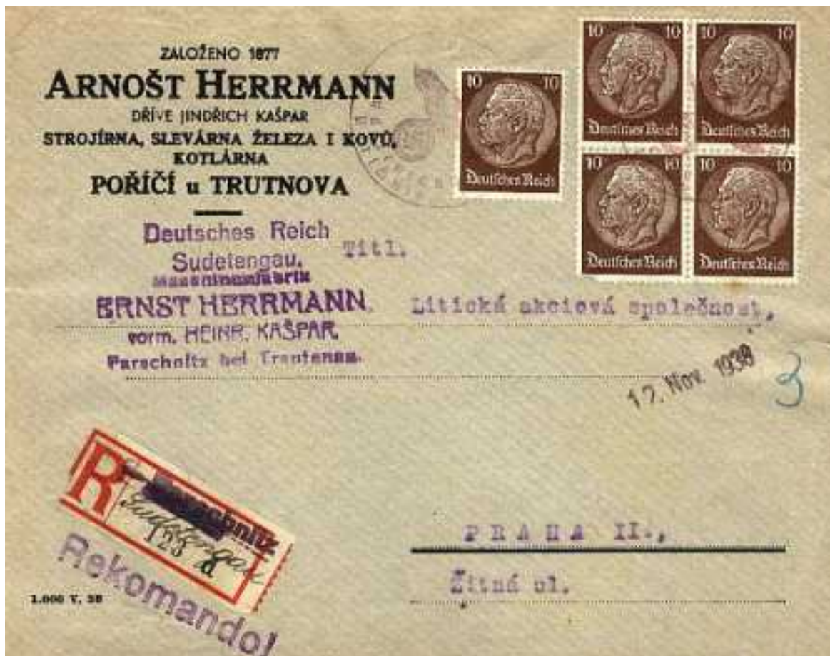
1. weight class cover to Czechoslovakia, 17 November 1938

If it was not possible to obtain unlabelled etiquettes, then the original ones were overprinted.