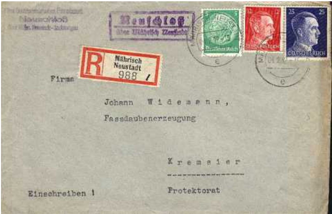
1. weight class cover from a small rural office; at the accounting office, the stamps were cancelled and the label applied, 4 February 1942.

Some large factories had it's own labels.