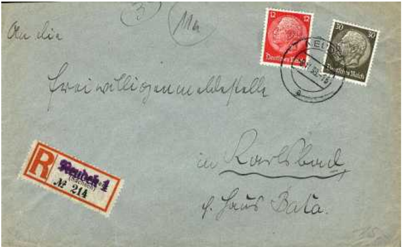
1. weight class domestic cover, 9 November 1938

Unaltered labels are rarely encountered.