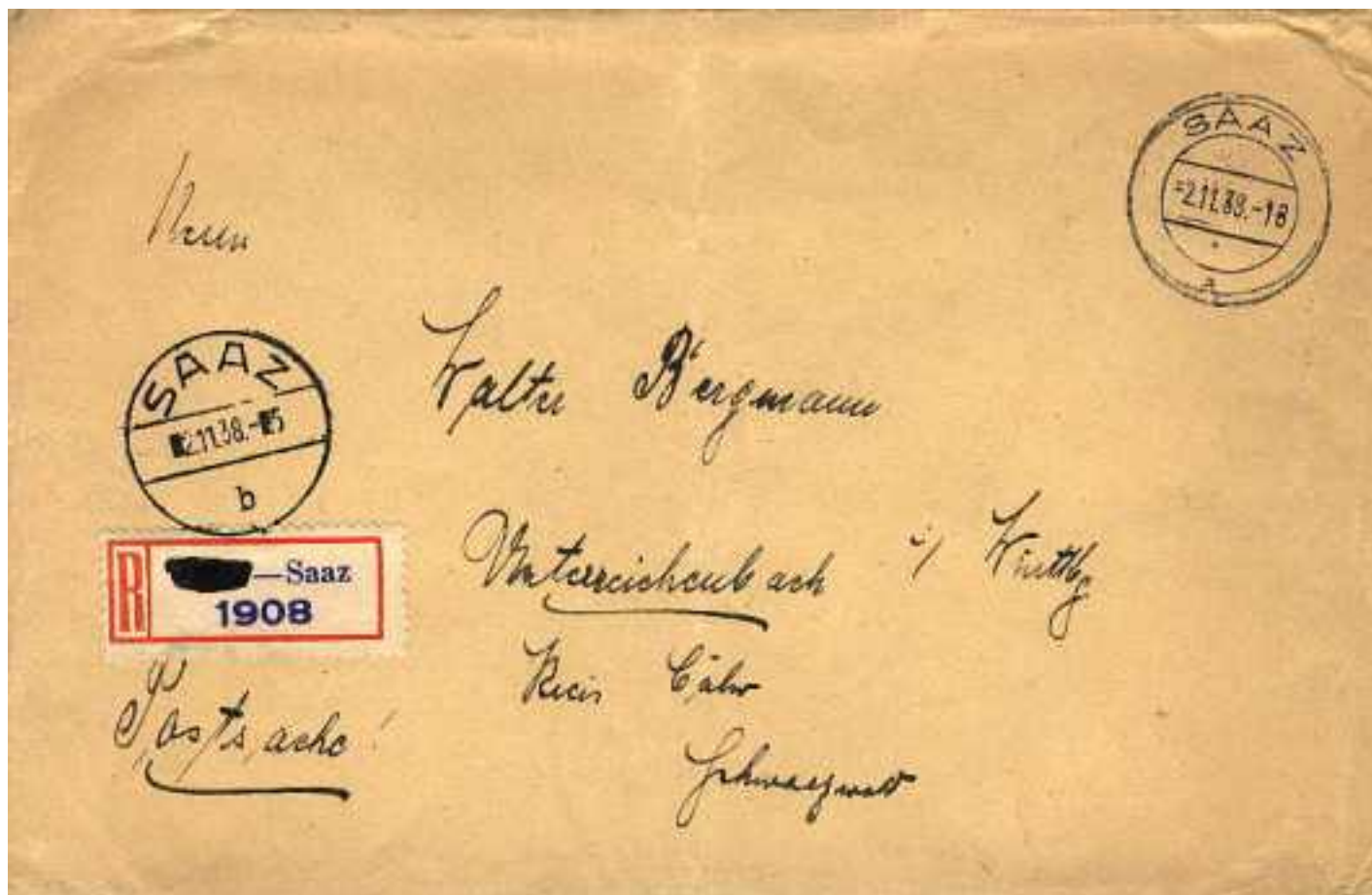
Bilingual Czech-German label, the former language deleted, on a official cover, 2 November 1938.

The Nazis weren't fond of Czech, so frequently deleted text in that language.