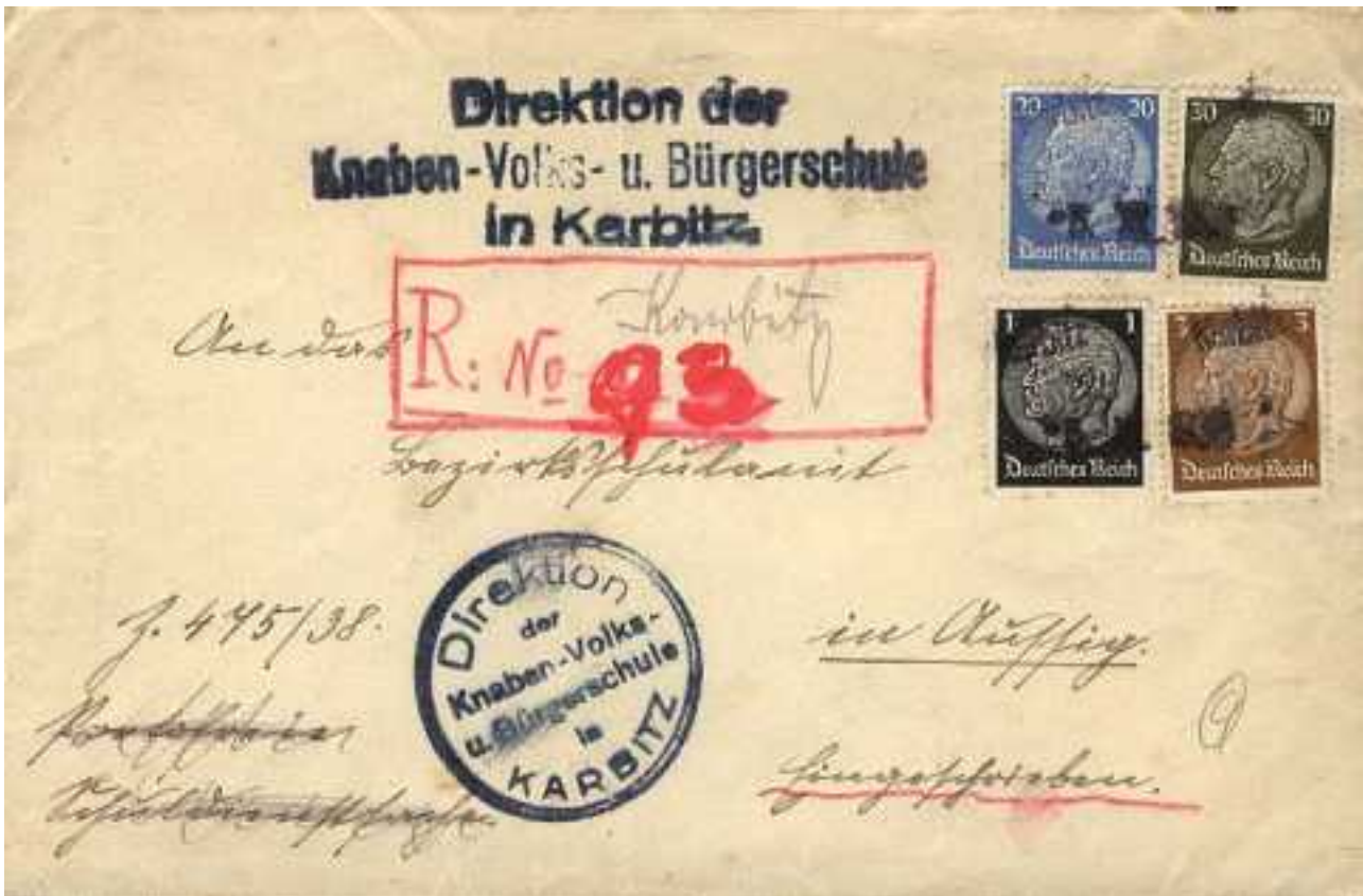
Hand-drawn rectangular "label" on a 2. weight class domestic cover, 5 October 1938.

Czech officials fled to Czechoslovakia, taking with them the stamps, forms, and labels. This resulted in a shortage in Sudeten post offices, leading to provisional "labels".