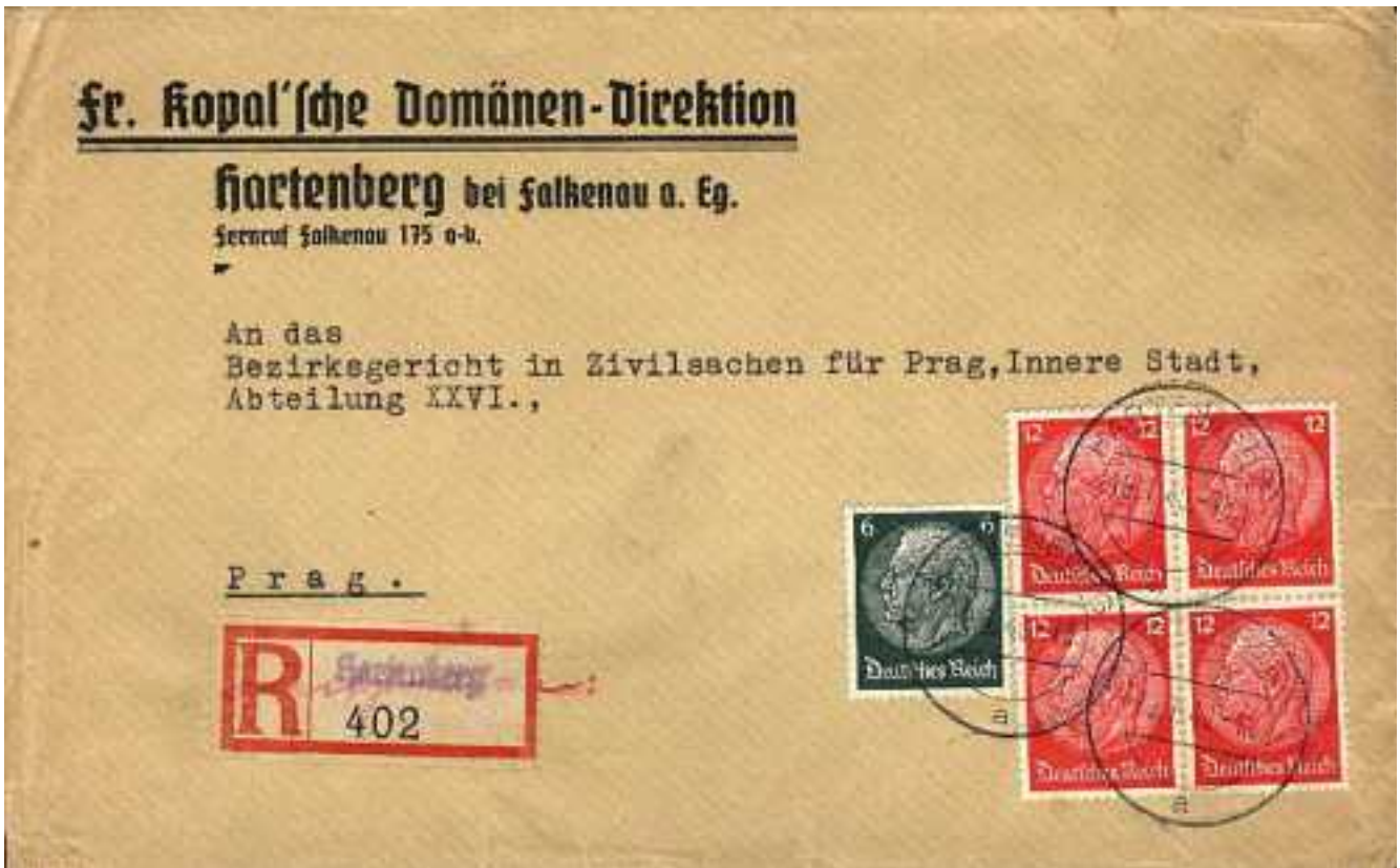
2. weight class cover to Bohemia & Moravia, 19 April 1940.

Another option was to obtain unlabelled labels from Germany, and overprint them.