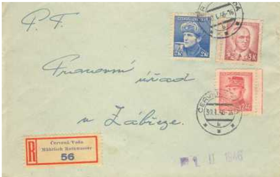
2. weight class cover, 30 January 1946.

Prewar Czech bilingual labels could be pressed into service.