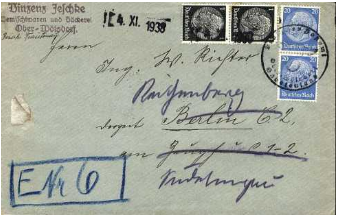
And another 1. weight class domestic cover, this time erroneously marked with an E for Exprès. The rates indicate it was sent as a registered letter, rather than by Exprès mail (special delivery), 4 November 1938.