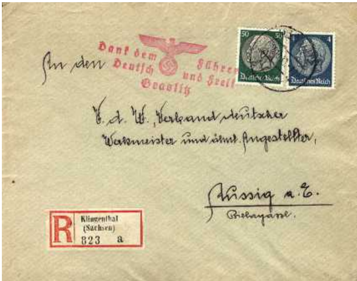
2. weight class domestic cover, 24 October 1938.

Unaltered labels are rarely encountered.