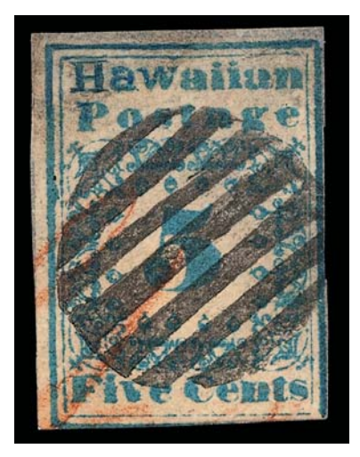
A Hawaiian Missionary stamp accepted as genuine.