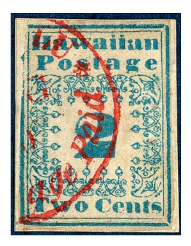
Hawaiian Missionary Stamp accepted as genuine