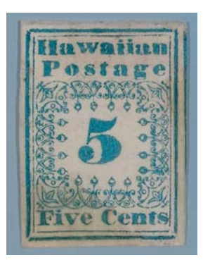
Hawaiian Missionary Stamp accepted as genuine.