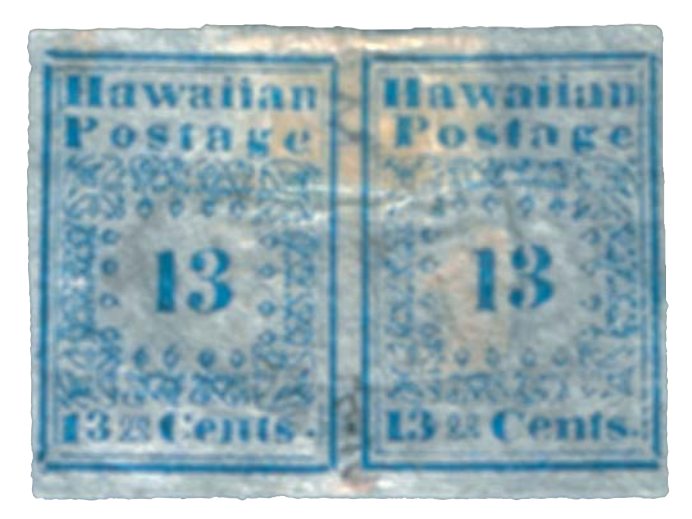
An attached pair of 13-cent Grinnell Missionaries

The use of modern, highly advanced analytical laboratory equipment has proved that some philatelists, during the last 80 years, made serious mistakes in the allegations about the paper and ink of the Grinnells. They published this erroneous information, which remains in philatelic archives today. One must ask how they arrived at such absolute conclusions without benefit of appropriately sophisticated analytical testing facilities.