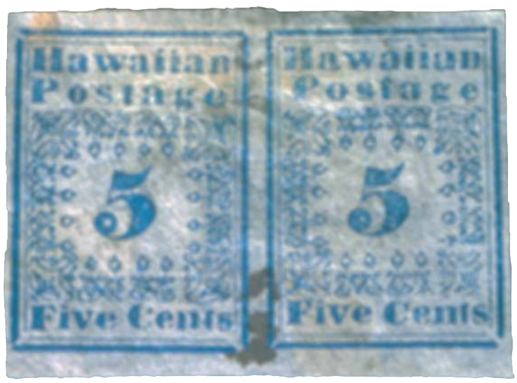
An attached pair of 5-cent Grinnell Missionaries

I do not blame the judge for not believing my statements, as all he had upon which to base his opinion was the testimony before him, but there was one big discrepancy in that testimony which I have pointed out many times, and which I think must have been entirely overlooked by the judge. After testifying that all of their personal effects had been destroyed by fire in about the year 1890, the daughter said in answer to the question, "Were there among your father's things after he died any old letters?" Answers: "Yes there were three letters of his mother's among his things after he died." I have always contended since that testimony was given that they were either purposely concealing something or that they were mistaken in their statements.