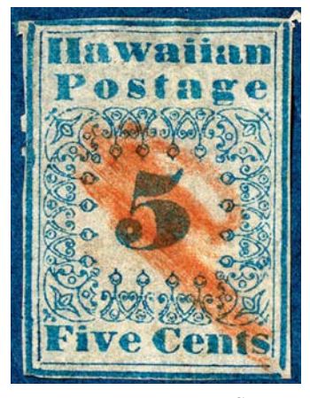
Hawaiian Missionary Stamp accepted as genuine