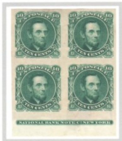
deep green with imprint