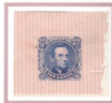
wavy line underprint blue on carmine