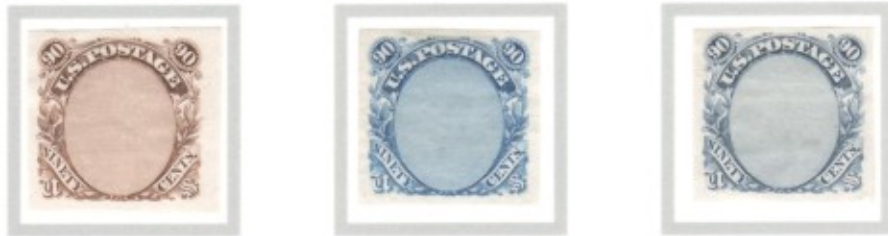
small numeral design of frame only on proof paper, in red brown, navy blue and dark blue green