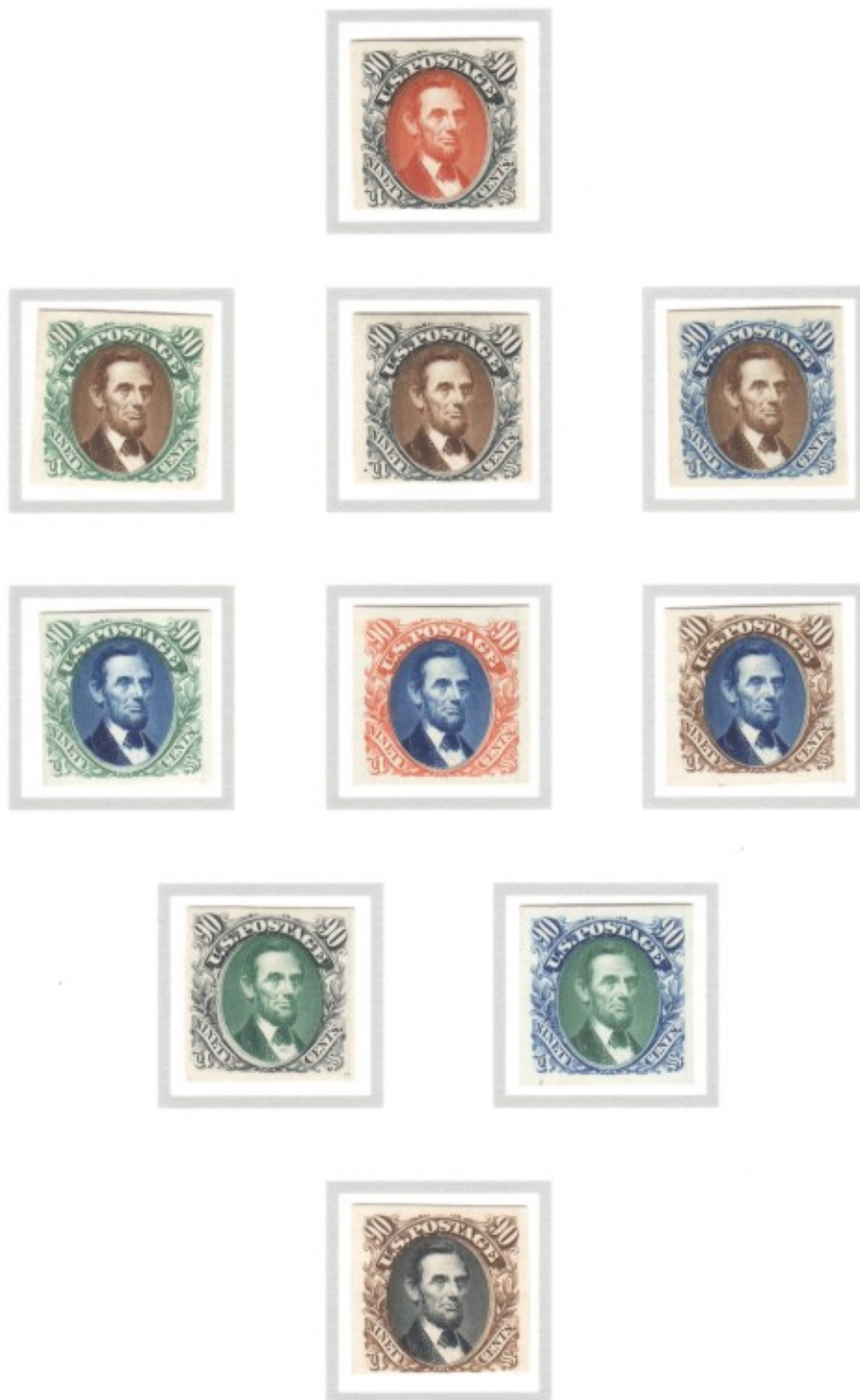
plate proofs on thin cardboard paper

The American Banknote Company reprinted plate proofs in ten different color combinations in 1881 at the request of the Post Office Department. For the ninety cents Lincoln design the National Bank Note Company die was used. These proofs were displayed at the International Cotton Exposition held in Atlanta, Georgia in 1881. Only one sheet of one hundred was printed in each of the colors.