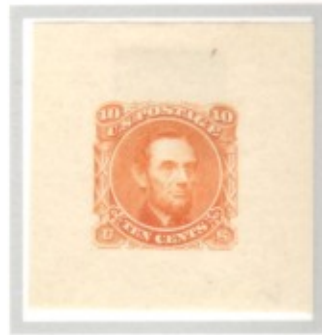
orange on cream bond