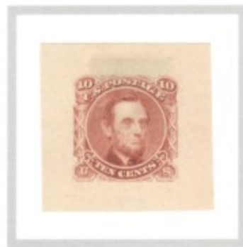
red brown on cream wove