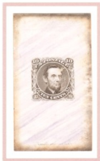
brown on ivory card Only Reported Example