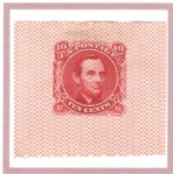
wavy line underprint carmine on scarlet