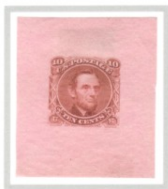
red brown on pink bond