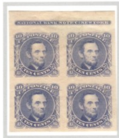
ultramarine with imprint