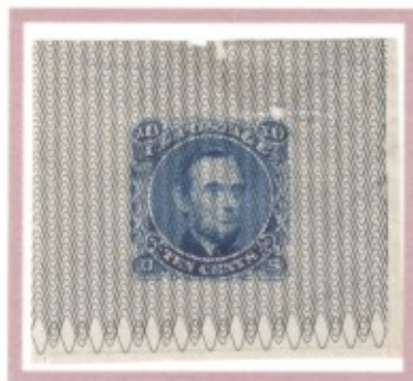
wavy line underprint blue on black