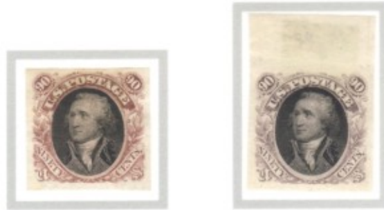
unadopted 90c Washington design