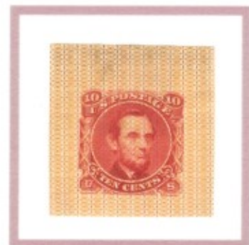
banknote style underprint carmine on orange and red