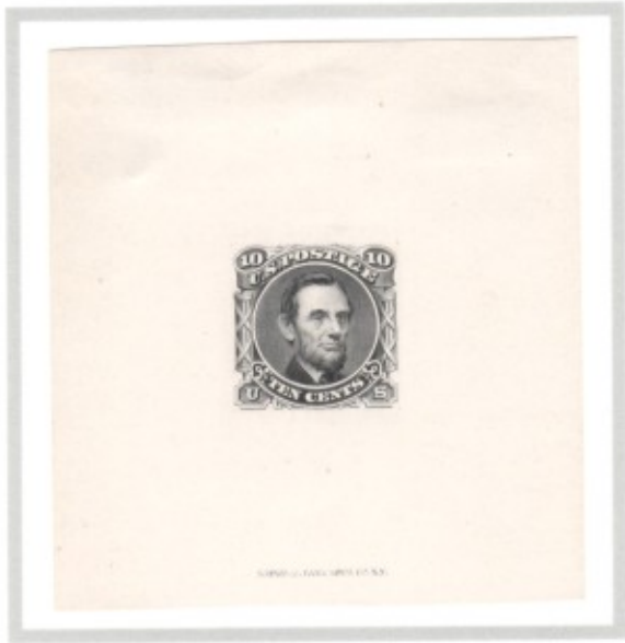
National Bank Note Company imprint black on ivory paper