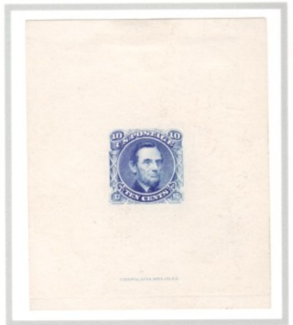
National Bank Note Company imprint blue on ivory paper