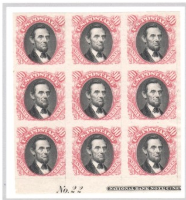
plate proof block on india paper with black plate number and part imprint

Although all of the other bi-color stamps of the 1869 issue have been found used with centers inverted, none of the ninety cents are known. Only one proof sheet of one hundred was printed of the ninety cents with inverted center. The issued stamp bore marginal markings in carmine in two positions at the top of the sheet and in black in two positions at the foot. Inverted sheets had the black imprint appearing at top over the carmine imprints in two positions. As a result, only two marginal imprint pieces appeared on this sheet.