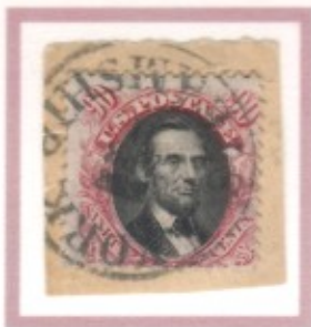
New York Steamship cancel Only Reported Example of Ninety Cent on Piece