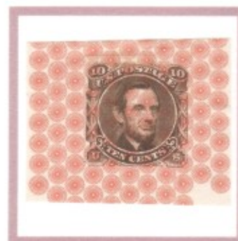
rosettes underprint brown on scarlet

Each Of The Above Is An Only Reported Example