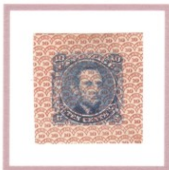
numeral "10" underprint blue on scarlet