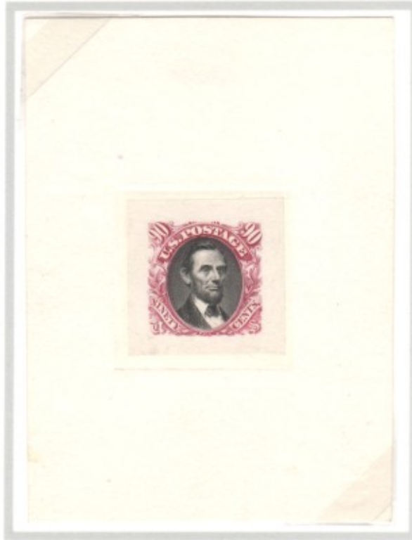
small die proof sunk on card