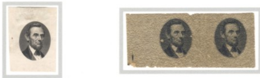
Lincoln vignette only on proof paper and pair on pitted gray paper, vignette as used on 1866 issue 15c