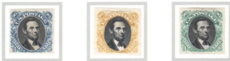
Lincoln vignette cut out and mounted onto small numeral frame on proof paper on yellow, on deep blue green, and on dark navy blue

The National Banknote Company prepared dies and plates for the 1869 issue of postage stamps late in 1868. Included in the set as originally planned was a ten cent denomination with a portrait of Lincoln and a ninety cent denomination with a portrait of Washington. This was later changed with Lincoln's portrait appearing on the ninety cent value. In the process the frame design was also altered with the original small numeral design being replaced with a design featuring larger numerals.