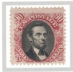
as issued with grill