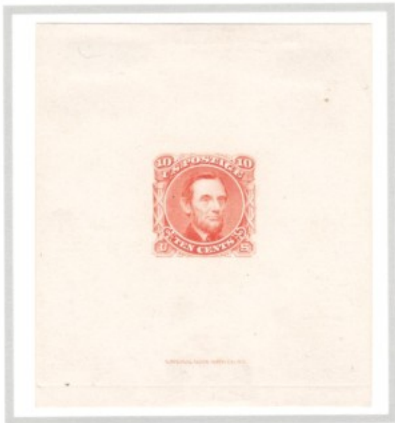
National Bank Note Company imprint scarlet on ivory paper