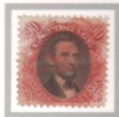
red cork cancel