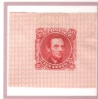
wavy line underprint carmine on scarlet