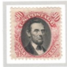
no grill variety