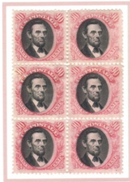
block of six with grill