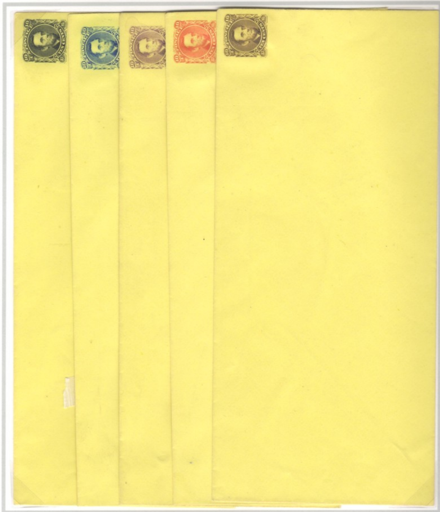
black, blue, purple, scarlet and brown - all on canary