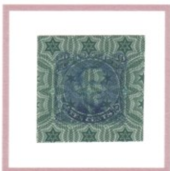
stars underprint green on blue