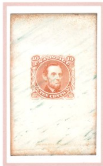
orange on ivory card Two Reported Examples