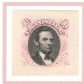
Fewer Than Six Reported Examples

A special printing of small die proofs was produced in 1915 for the Panama-Pacific Exposition. These proofs are on yellowish wove paper that differs from the wove paper of the earlier small die proofs.