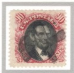
“X” cancel of Yokohama, Japan