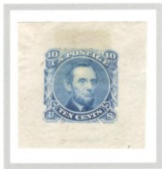
blue on gray bond