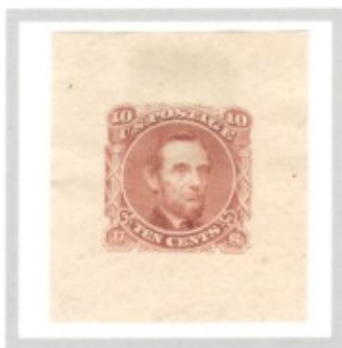
red brown on cream bond