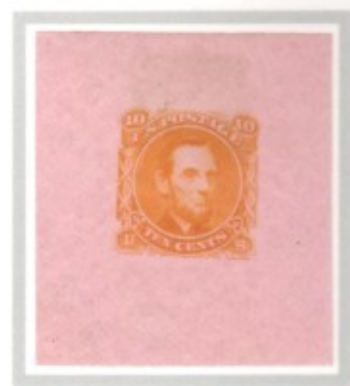
yellow on pink bond