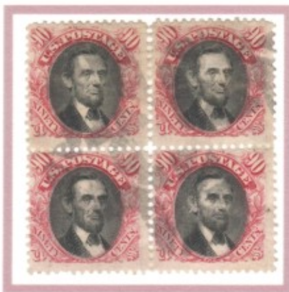
block of four