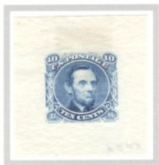
deep blue on white bond