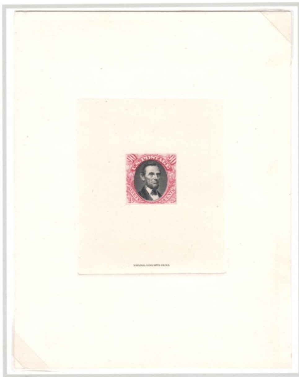
National Bank Note Company imprint hybrid large die proof sunk on card (the only way it exists)

The National Bank Note Company prepared dies and plates for the ninety cents Lincoln stamp late in 1868.