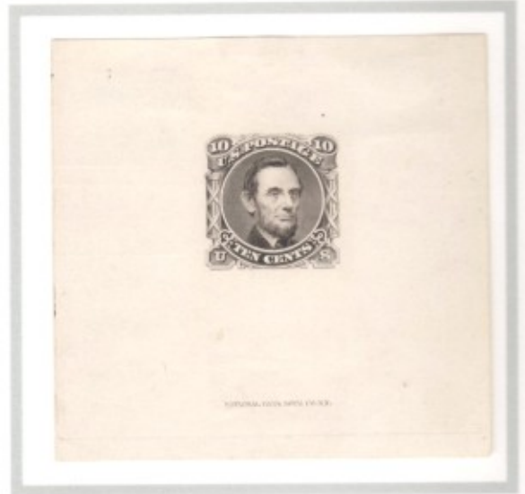
National Bank Note Company imprint black brown on ivory paper