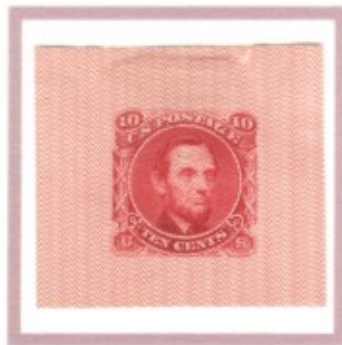
wavy line underprint carmine on scarlet