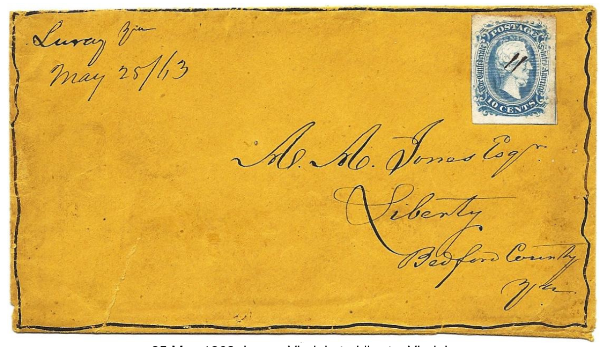
25 May 1863: Luray, Virginia to Liberty, Virginia

Issue of 1863, printed by Archer and Daly – the 10 Cent Frame Line