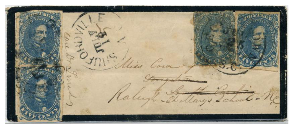
15 July 1862: Shufordville, North Carolina to Georgetown, South Carolina 25 July 1862: Forwarded to Raleigh, North Carolina

An additional rate required to forward a letter to another post office if the intended recipient had moved or relocated. This service was not free.