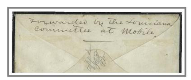
(reverse reduced 25%)

Smuggled out of Union occupied New Orleans. The Confederate Provost Marshal at Mobile examined the letter before mailing. Postage provided by the Louisiana Relief Committee as a courtesy. Right edge restored.