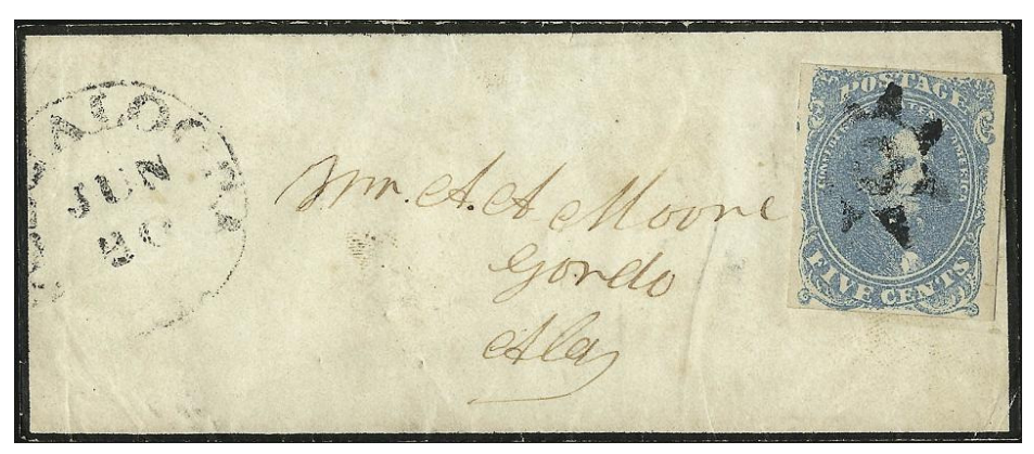
20 June 1862: Tuscaloosa to Gordo, Alabama

Issue of 1862 printed by Hoyer and Ludwig