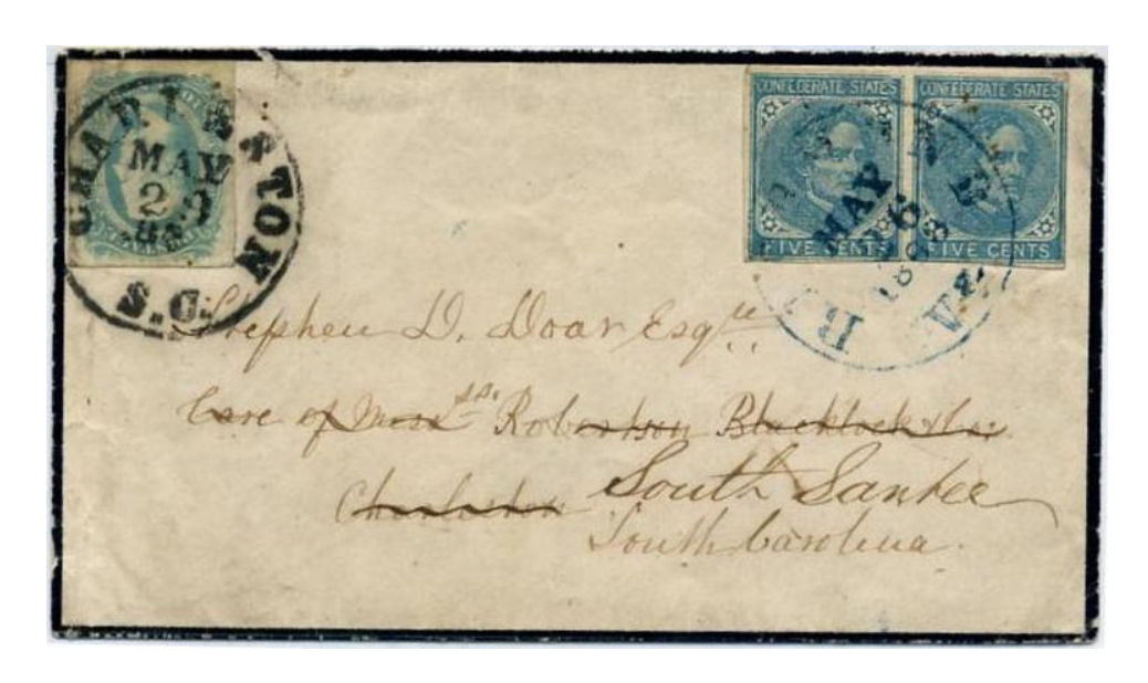
26 May 1863: Richmond, Virginia to Charleston, South Carolina 29 May 1863: Forwarded to South Santee, South Carolina

Originally sent with vertical pair of Hoyer and Ludwig 5-cent [Stone 2] dated 15 July (1862) with 4 corrected to 5 in the postmark. Forwarded to Raleigh NC with additional two single copies of 5-cent [Stone 3] at upper right corner, of which the left stamp appears to be a fraudulent re-use.