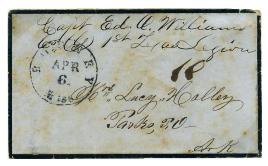
6 April 1863: Rodney, Mississippi to Parks, Arkansas

Letters mailed in the Confederacy had to be prepaid. But there was one major exception, the Soldier's Due letter .