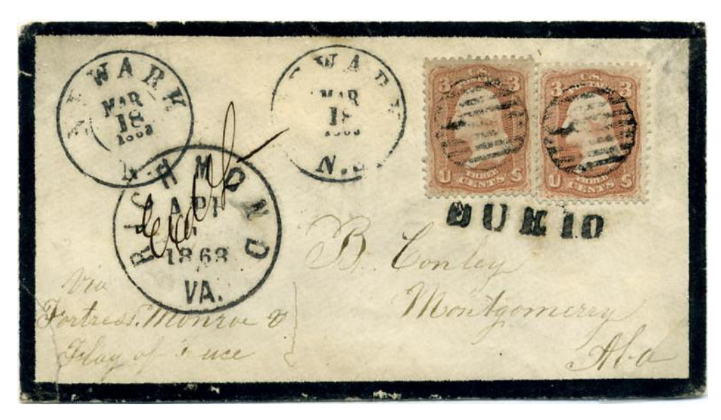
18 March 1863: Newark, New Jersey to Montgomery, Alabama Postmarked Richmond, Virginia after being exchanged

Prepaid with <u>two</u> U.S. stamps – one for Federal and perhaps a second one as an attempt to pay Confederate postage. Routed per endorsement via Fortress Monroe (Virginia) where it was censored and examined. Entered the Confederate postal system at Richmond, where the cover was marked DUE 10 as the second U.S. stamp was not recognized.