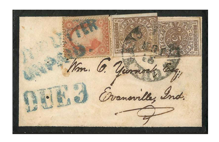
22 June 1861: New Orleans, Louisiana to Evansville, Indiana

Louisville Evansville United States postal system