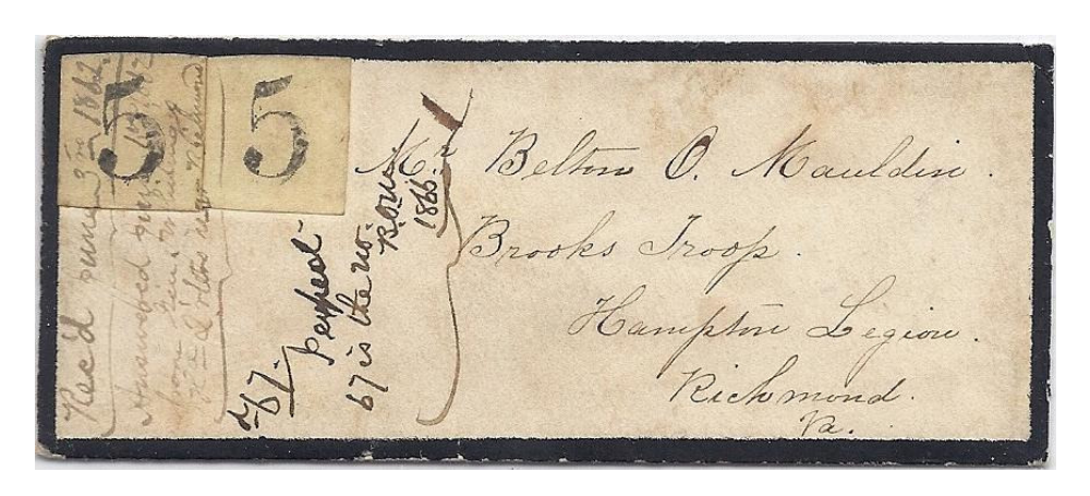
May 1862: Limestone Springs to Richmond, Virginia

The only recorded examples of this provisional stamp printed on white paper.