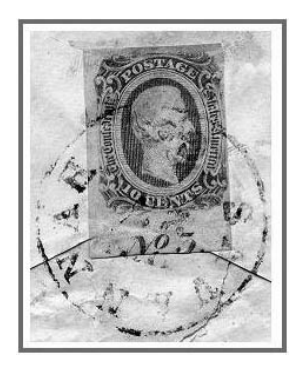
Gray-scale image with the envelope flap folded under showing the complete dated Savannah post mark.