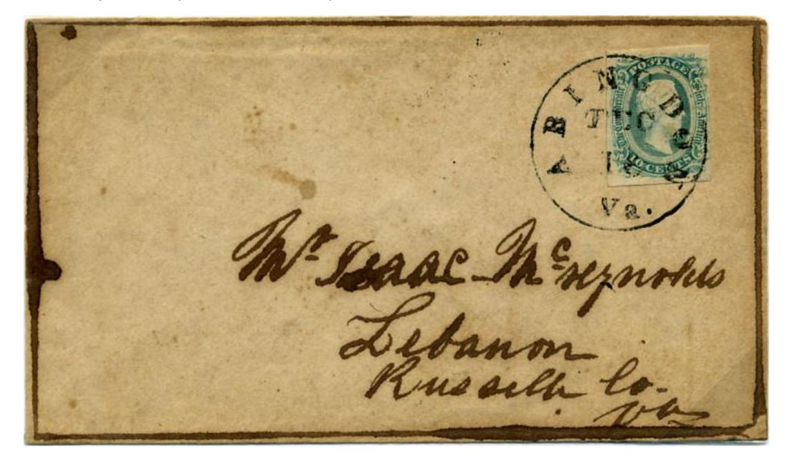
16 December (c.1863): Abingdon to Lebanon, Virginia Envelope made from light brown butcher paper.

Issue of 1863, printed by Archer and Daly