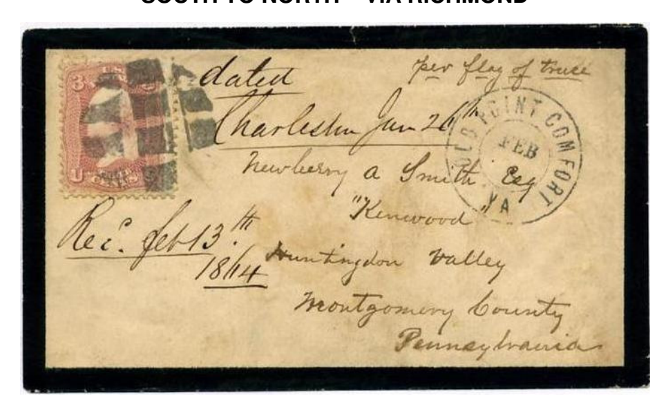
Charleston, South Carolina to Huntington Valley, Pennsylvania Postmarked February 1864: Old Point Comfort, Virginia

Mailed in an outer envelope using the Confederate Postal System from Charleston to Richmond, where the outer envelope was opened, then discarded. Carried by steamer to Fortress Monroe, Virginia, the Union exchange point. Entered the Union postal system at nearby Old Point Comfort.