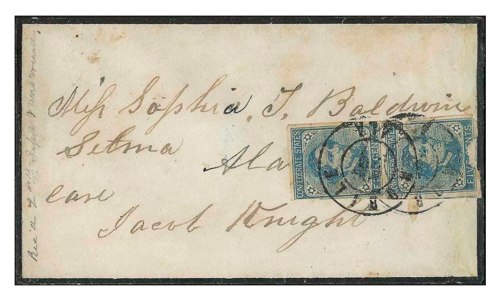
Hand carried though the Union lines from New Orleans to Mobile Postmarked 30 August (1863) at Mobile, to Selma, Alabama

Smuggled out of Union occupied New Orleans. The Confederate Provost Marshal at Mobile examined the letter before mailing. Postage provided by the Louisiana Relief Committee as a courtesy. Right edge restored.