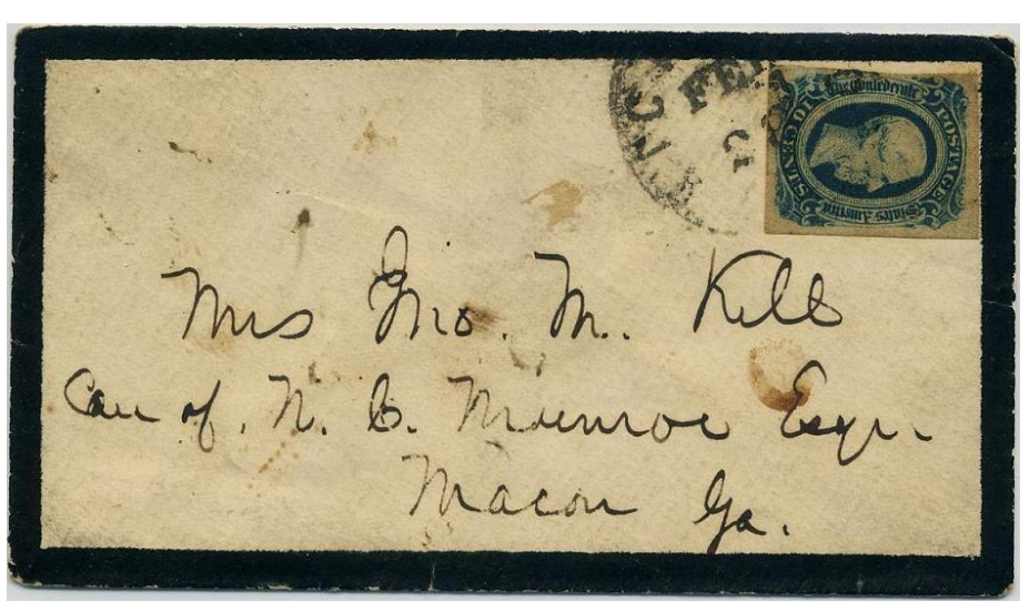
28 February 1865: Richmond, Virginia to Macon, Georgia

Uncommon use of a mourning cover in 1865.