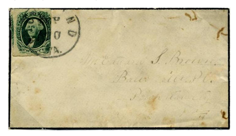
20 September (c.1864): Richmond to Ballsville, Virginia

Issue of 1863, printed by Archer and Daly