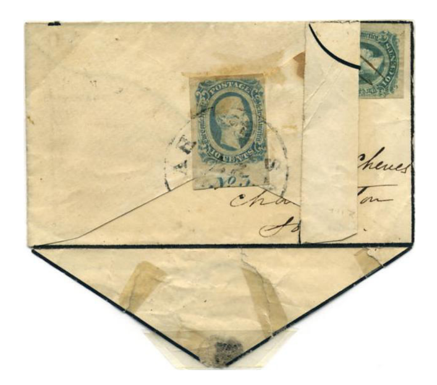
First use – Date and origin unknown: to Charleston, South Carolina Second use – 27 June (c.1864): Savannah to Valdosta, Georgia

Both of the Archer and Daly printings, with the early printing on the original mourning cover and the second printing (positively identified by plate number 3) used to seal the turned flaps, with the Valdosta address written on the envelope's other side.