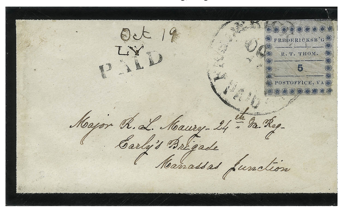
October 1861: Fredericksburg to Manassas Junction, Virginia