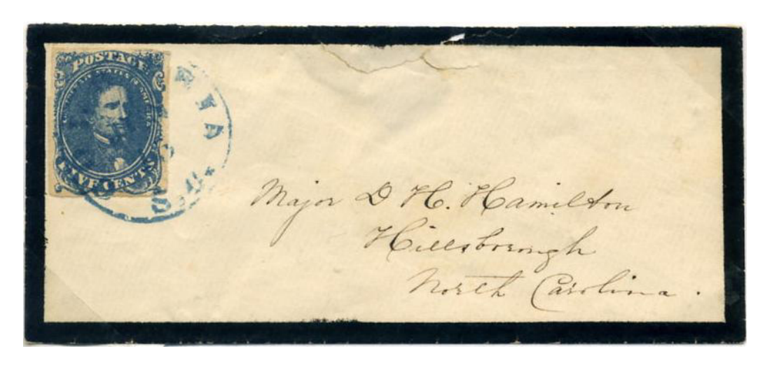
15 June 1862: Columbia, South Carolina to Hillsborough, North Carolina Joined ' CE ' at top of Cents, from Stone 3, Plate Position 33