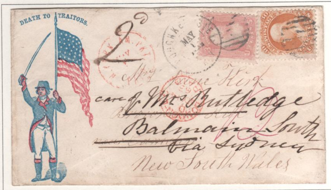
One of two recorded Civil War patriotic envelopes used to Australia.

5¢ US internal plus 16¢ transatlantic ship plus 12¢ (6d) empire rate from UK to Australia - Starnes calls this the 33¢ Southampton rate although some 1850s sailings departed from other ports. Route went through the Straits of Gibraltar to Suez.