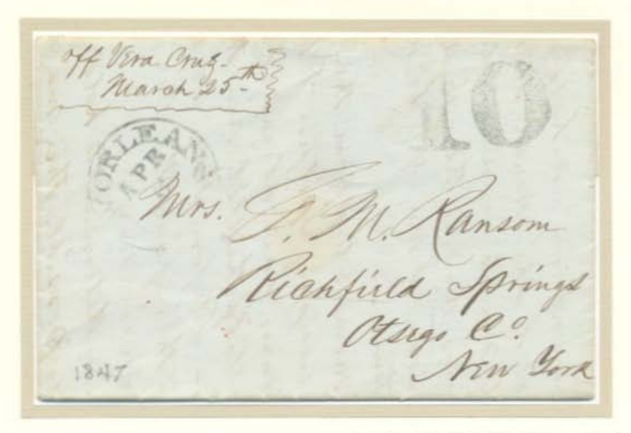
"U.S.(Prize] Schooner "Mahonese" No.5 Off Anton Lizardo, March 22d 1847 -