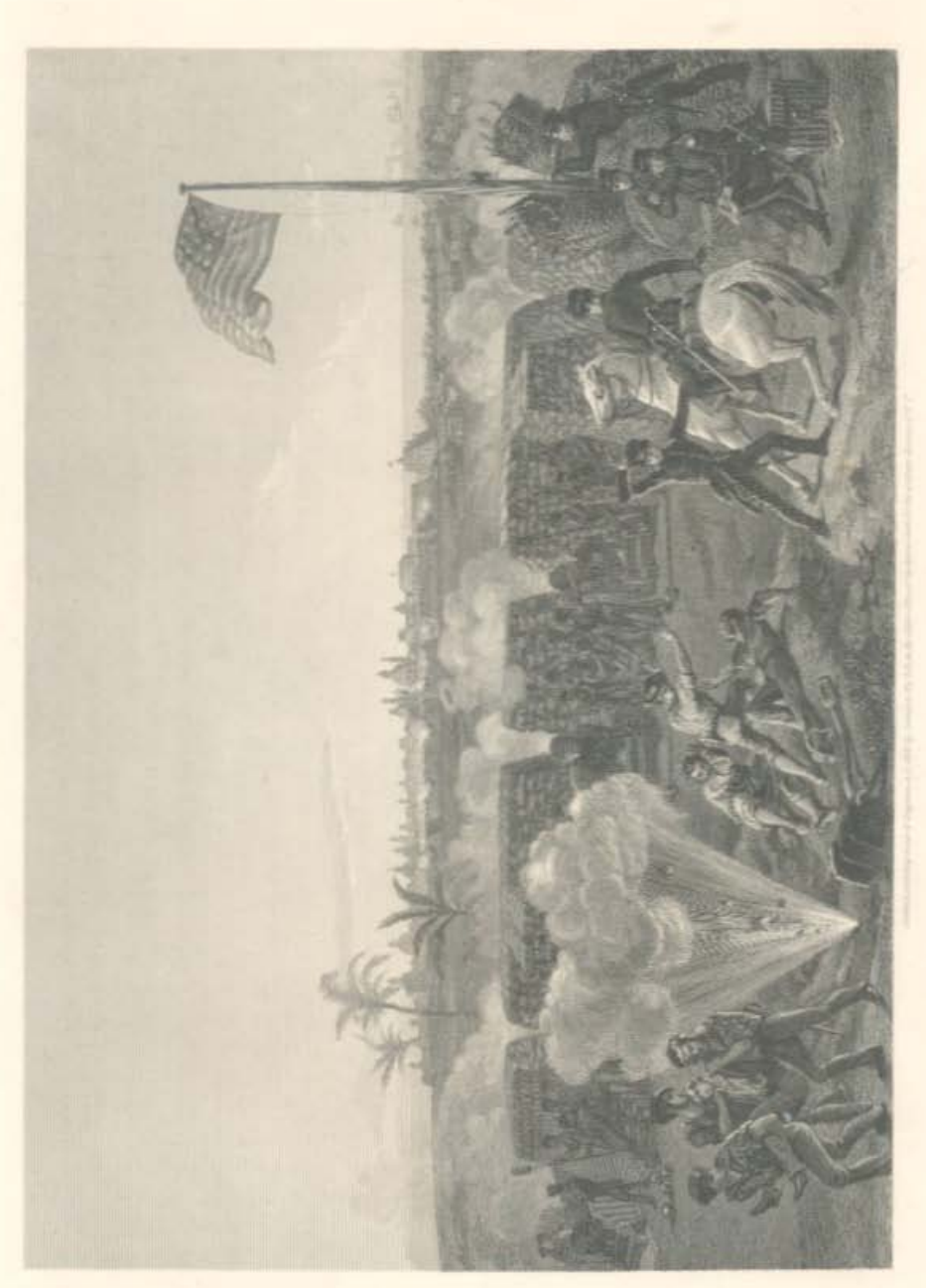
CIEGE OF VERA CRUE.

Sensitive regression promittee by Provellan the prosessors of the publisher