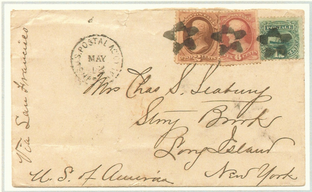
12 May 1873 Shanghai to New York carried by PMSS Alaska to San Francisco, prepaid 20c double rate