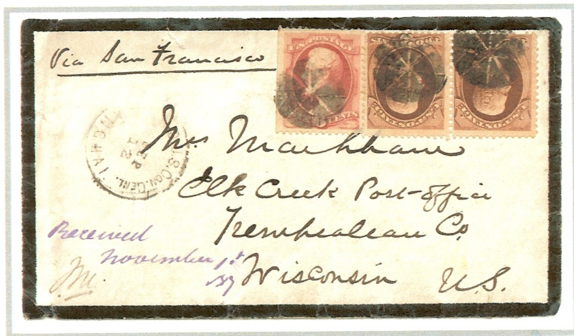
12 September 1871 Shanghai to Wisconsin, prepaid single rate with pair 2c and single 6c carried by PMSS Arizona to San Francisco, transit backstamp