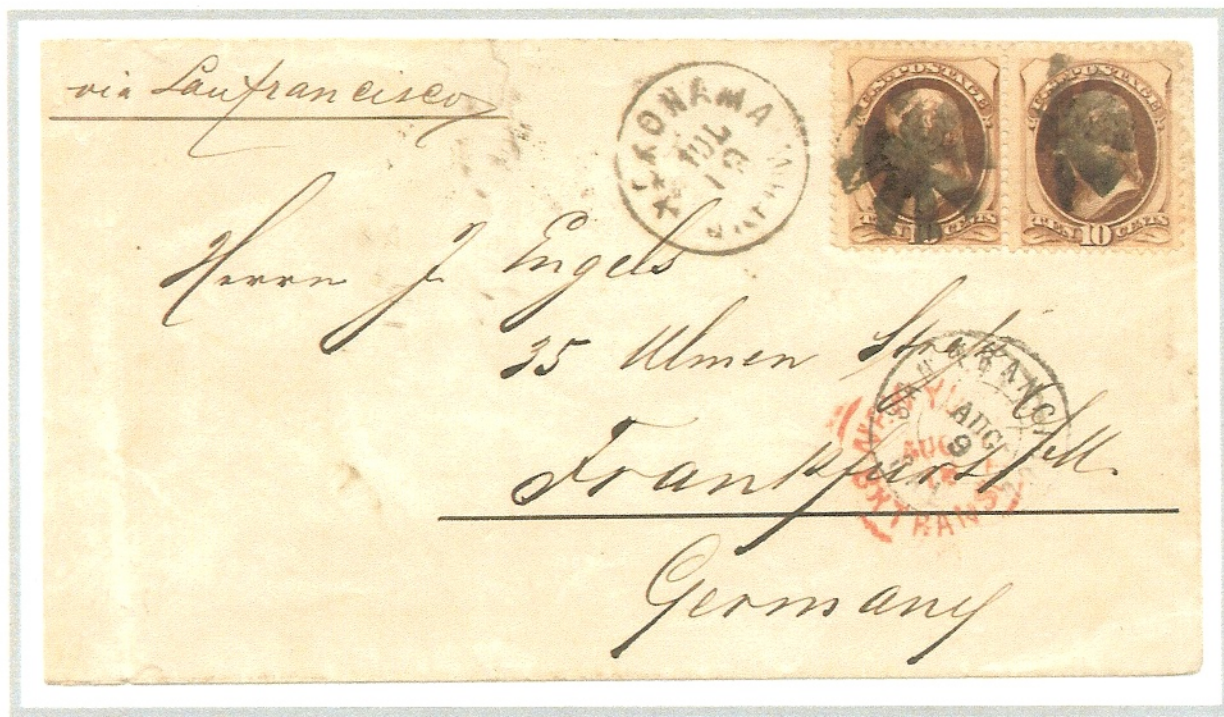
19 July 1874 Yokohama to Frankfurt, Germany, prepaid correct 20c rate carried by PMSS Colorado to San Francisco, 9 August 1874 San Francisco transit 31 August 1874 arrival backstamp