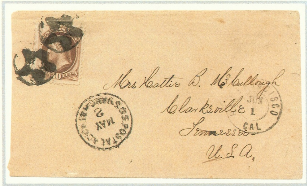
2 May 1873 Shanghai to Tennessee, carried by British Steamer Quang Se , under contract, to San Francisco 1 June San Francisco transit, single 10c rate