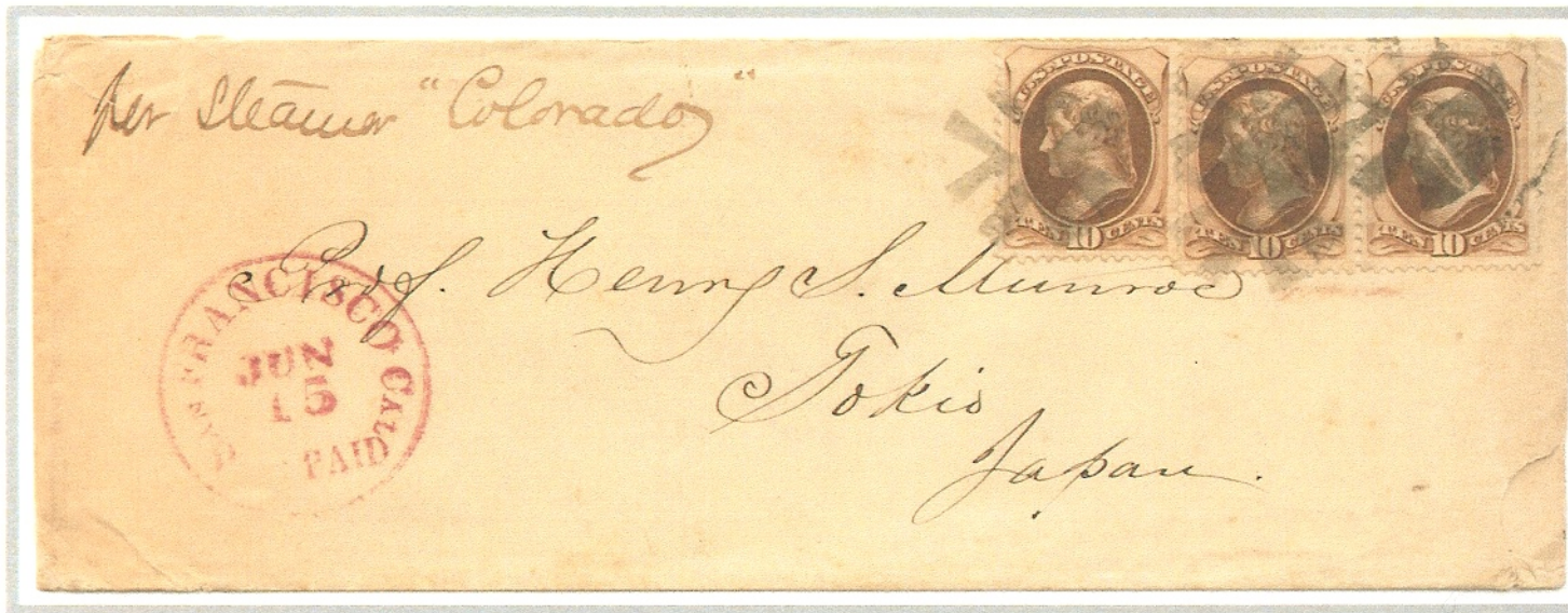
15 June 1875 San Francisco to Yokohama, carried by PMSS Colorado to Yokohama prepaid double 15c rate, Yokohama Japan 9 July arrival backstamp with time

The fifteen cents per half ounce treaty rate between Japan and the United States became effective on January 1, 1875. On this same date Japan started their own foreign mail system. New postmarks were employed that had "Yokohama Japan" in English with date and time slugs.