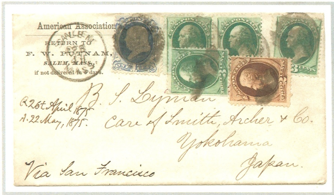
19 February 1875 Salem, Massachusetts to Yokohama, carried by PMSS China to Yokohama prepaid correct 15c rate, Yokohama Japan 28 March arrival backstamp with time