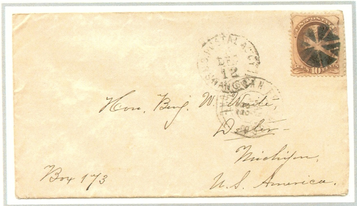
12 December 1872 Shanghai to Michigan, prepaid single 10c rate carried by American sailing ship Scotia , under contract, to San Francisco 22 January 1873 San Francisco transit (an exceptionally long trip)