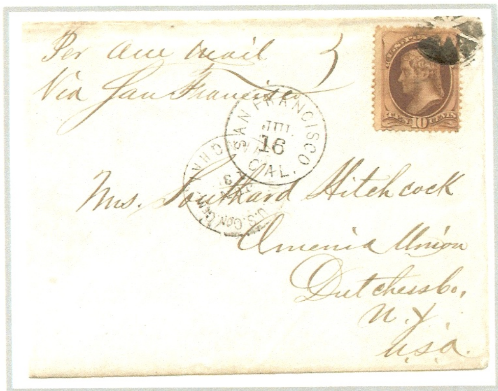
13 June 1871 Shanghai to New York, single 10c rate prepaid with grilled stamp carried by PMSS America to San Francisco, 16 July San Francisco transit