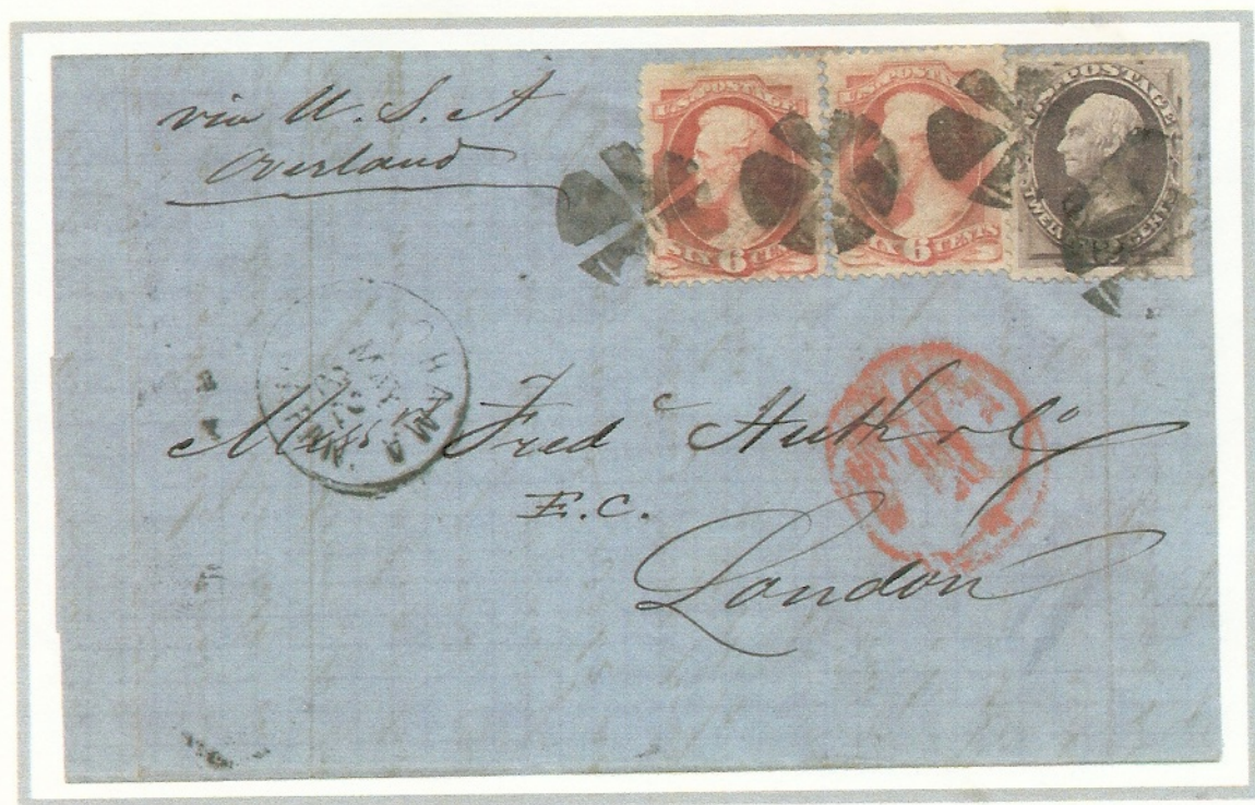
22 May 1871 Yokohama to London, England, carried by PMSS China to San Francisco 2c overpayment of double rate