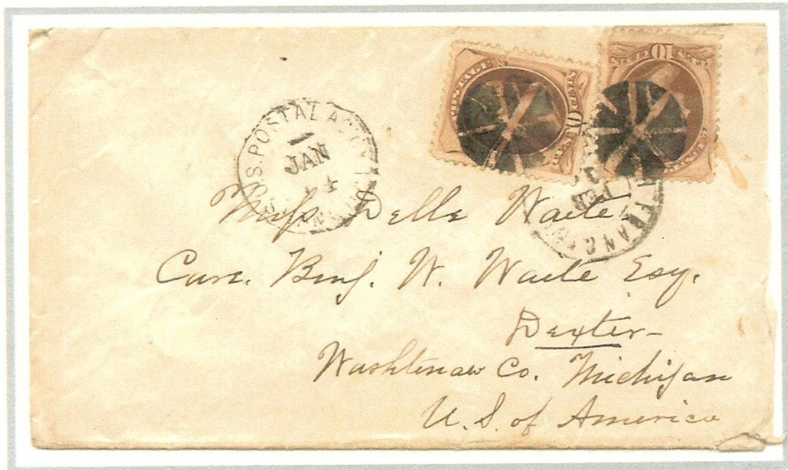
14 January 1873 Shanghai to Michigan, prepaid 20c double rate carried by PMSS Japan to San Francisco, 15 February San Francisco transit

Above two covers are from consecutive sailings. The top cover was sent by sailing vessel from Yokohama while the lower cover was carried by a steam ship.