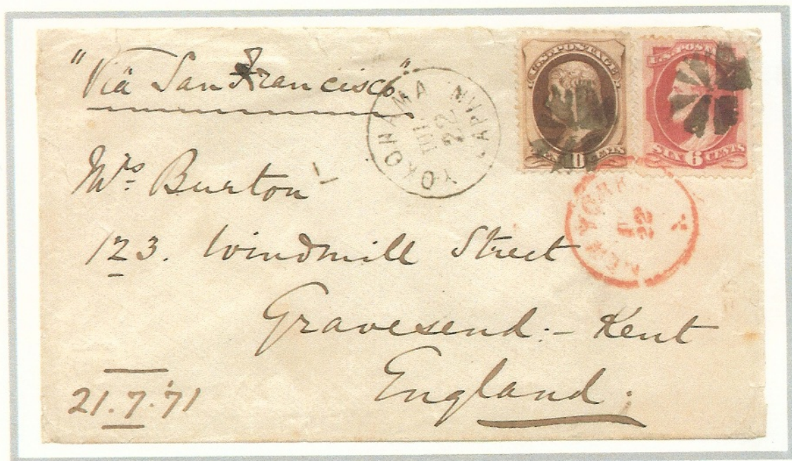
22 July 1871 Yokohama to Gravesend, England, carried by PMSS Japan to San Francisco 22 August New York City transit, single 16c rate