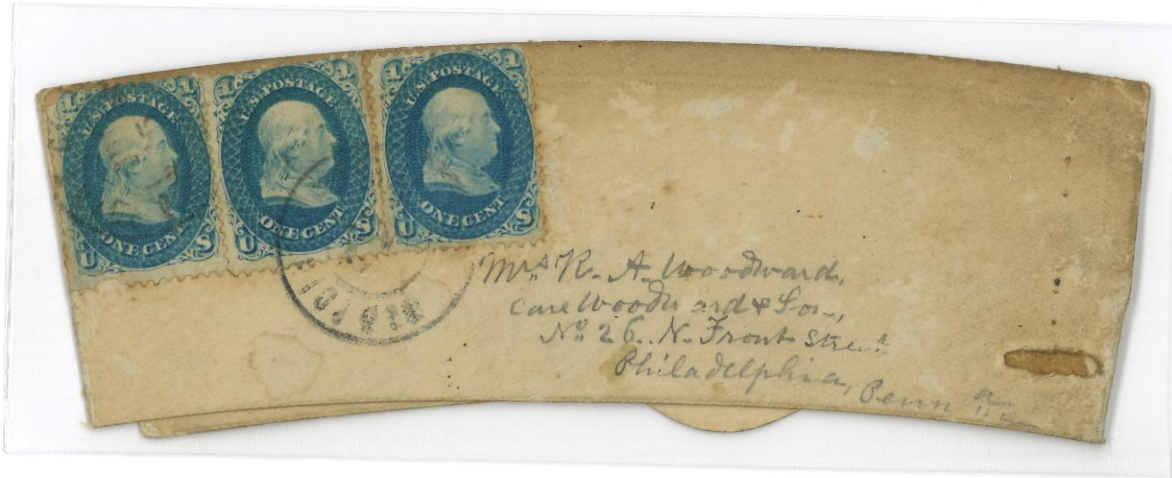
Letter fashioned from a cardboard shirt collar, written by a Union soldier writing from Old Point Comfort VA to Philadelphia with three US 1¢ 1861.

Soldiers in the field resorted to using a variety of paper products to send letters home, but Union soldiers were usually well-supplied—these adversity uses from the South to Northern destinations are extremely unusual.