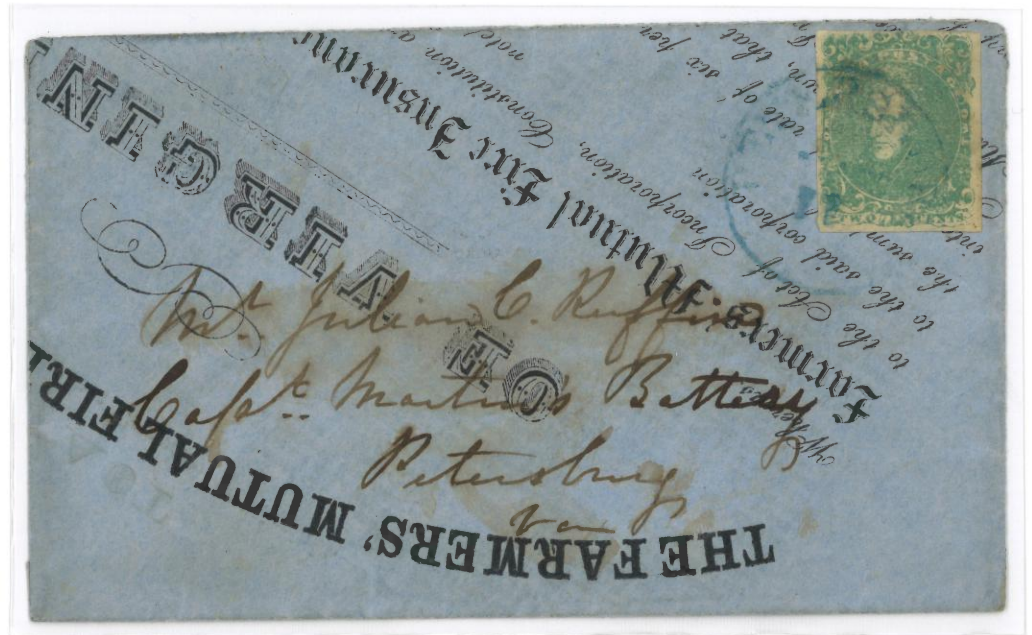
Very few adversity covers are known with the 2¢ Jackson Lithograph