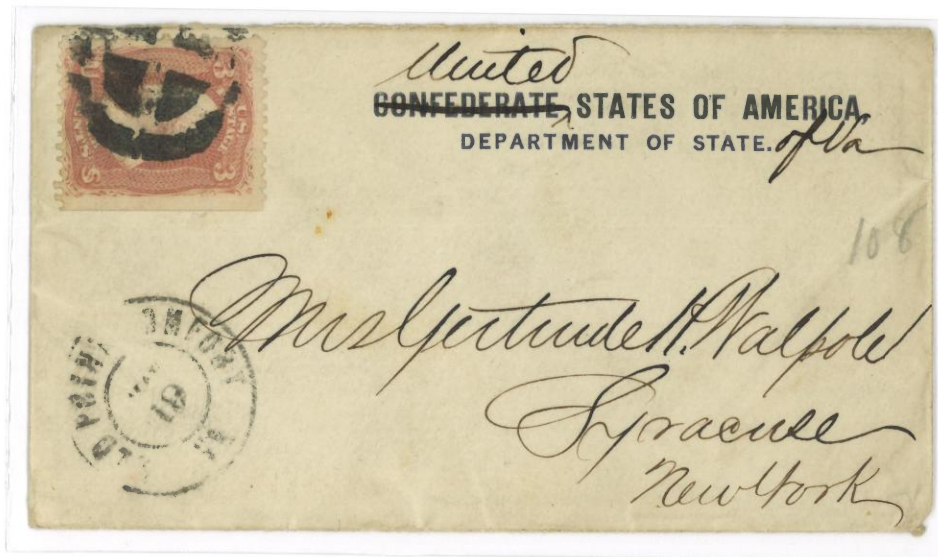
Confederate imprint cover with "Confederate" crossed out and changed to "United" and "of Va." added after "Department of State," used from Union-occupied Old Point Comfort in Confederate Virginia to Syracuse NY, with US 3¢ 1861.