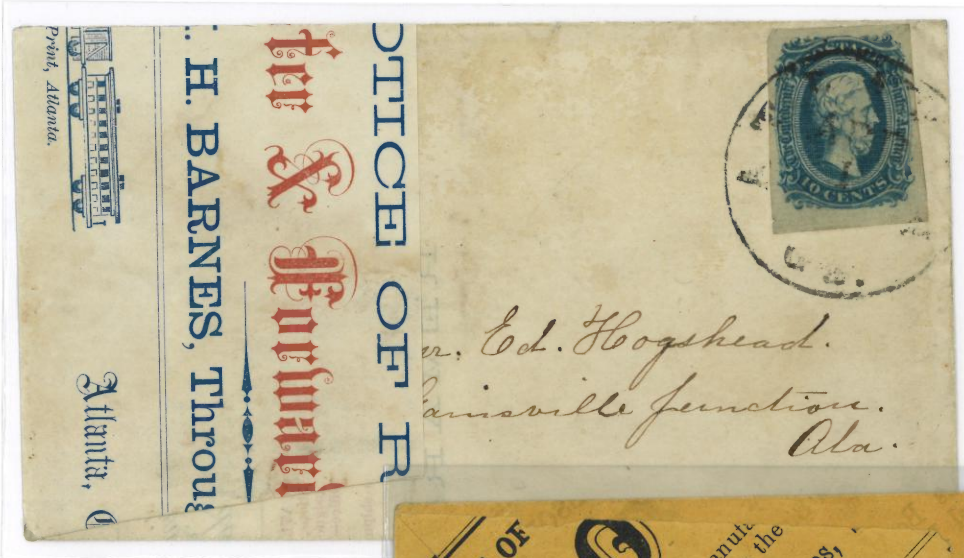
Envelope made from railroad bill of lading in red and blue with 10¢ Die A used from Atlanta GA to Gainsville Junction AL, 1 Apr. (ca. 1864-5).