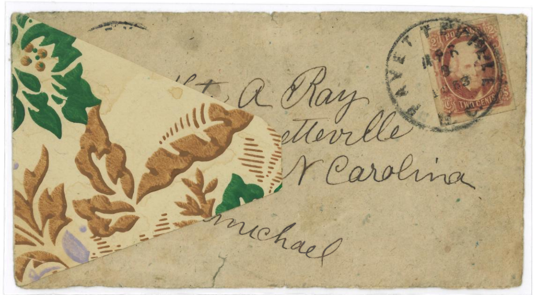
Rare wallpaper cover with the 2¢ Jackson Engraved

Envelope made from floral wallpaper with 2¢ Jackson Engraved, used locally in Fayetteville NC, 9 April 1863. The year date in this cancel is likely incorrect - most likely 1864.