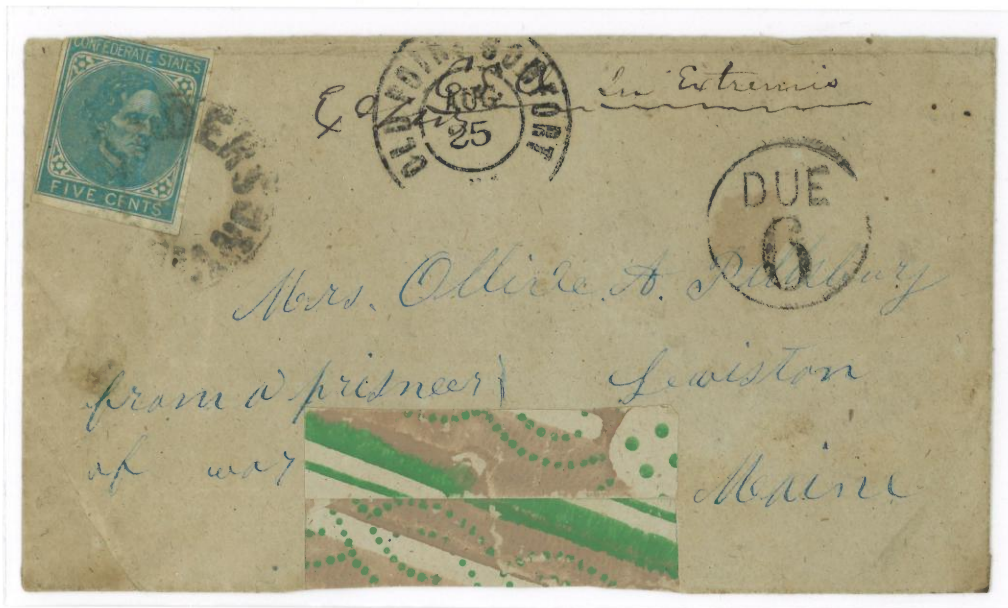
The only wallpaper envelope signed by Andersonville prison commander Henry Wirz

Sent from a Union prisoner of war held at Camp Sumter in Georgia, better known as Andersonville, and censored by Camp Commandant Capt. Henry Wirz ("Exd. H.W. In Extremis"), adversity use of wallpaper envelope to Lewiston ME, single 5¢ De La Rue Typograph underpays the 10¢ CSA rate, cancelled by "ANDERSONVILLE GA." dateless woodcut circle, carried by flag of truce to Old Point Comfort, entered US mails with 25 August (1864) datestamp and "Due 6" for US postage.