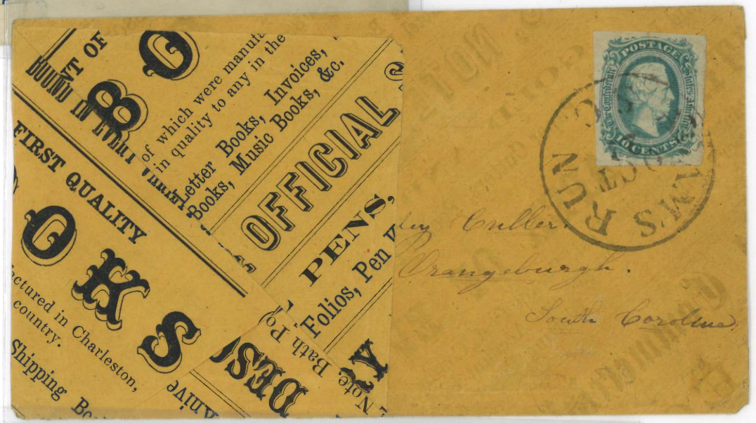
Envelope made from bookseller and stationer's advertisement with 10¢ Die A used from Adam's Run SC, 21 October (ca. 1863).