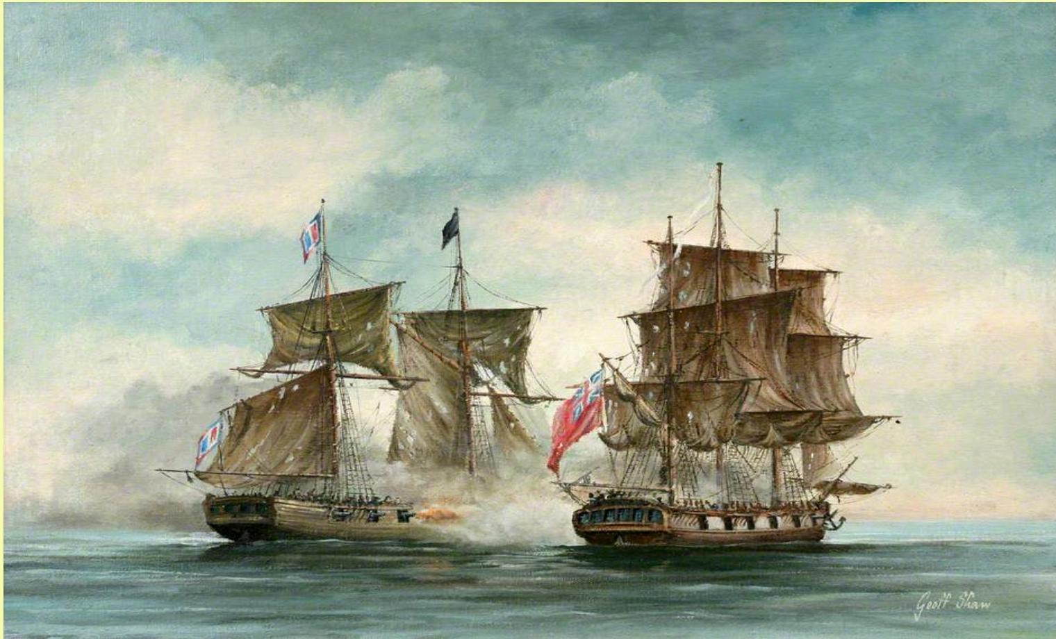
French Privateer Atlanta