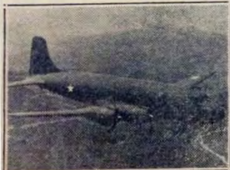
Douglas C-54 transport plane.

Washington, D. C.—Seven days round trip from the U. S. to northern India to rush supplies to Gen. Joseph Stilwell's