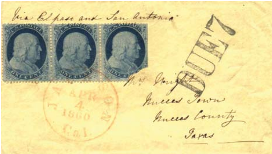
Figure 5. Cover endorsed “via El Paso and San Antonio,” sent April 4, 1860 from Jackson, California to Nueces Town, Texas, franked at the single rate to 3,000 miles with a strip of 1¢ perforated 1857 stamps. Instead of being put into the Butterfield overland mail like Figure 4, it was routed via the Panama steamer departing on April 5.

son, California postmark dated February 5, 1860 and was carried late in the State 3 period of the route. Instead of going via San Diego, the cover was carried on the portion of the Butterfield overland route, via San Francisco, Los Angeles, and Fort Yuma to El Paso. There it was transferred to the still-surviving segment of the Giddings and Doyle route from El Paso to San Antonio and then onward to Nueces Town, Texas.