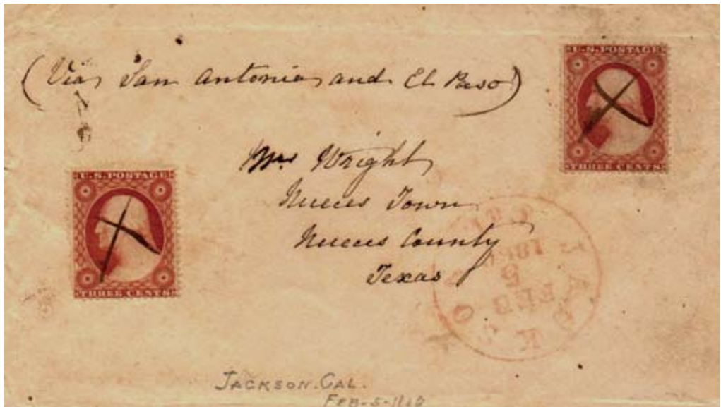
Figure 4. Cover endorsed “via San Antonio and El Paso,” sent February 5, 1860 from Jackson, California to Nueces Town, Texas. The two perforated 3¢ 1857 stamps pay double the three-cent rate for a distance under 3,000 miles.

The earlier of the two, shown in Figure 4, is endorsed “Via San Antonio and El Paso” at the top and franked at double the three-cent rate for under 3,000 miles. It has a red Jack-