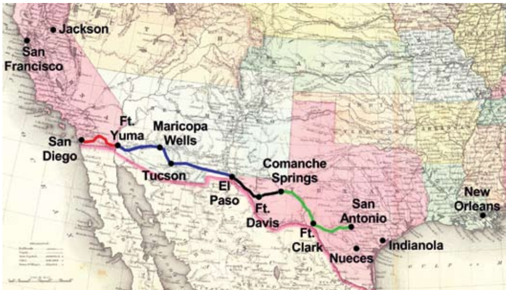
Figure 1. Map showing the entire San Diego and San Antonio (Jackass Mail) route, with various segments coded in color (see text).

In response to clamoring by residents of California for improved mail service, Congress enacted a postal bill to establish a through-mail route between San Antonio, Texas, and San Diego, California, on August 18, 1856. Further, the Act of December 19, 1856 authorized construction of a military road from El Paso to Fort Yuma and the military posts needed to protect the route. With connections onward from both termini to the major points in both California and the East, it was hoped this route would be faster and less costly.