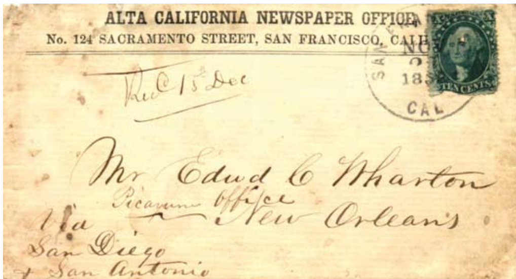
Figure 3. Imprint envelope of the Alta California newspaper, endorsed “via San Diego and San Antonio,” posted November 21, 1859, and sent from San Francisco to New Orleans over the entire length of the “Jackass Mail” route. The 10¢ 1857 stamp is Type V.

Covers carried on the Jackass mail route were to be endorsed “via San Diego and San Antonio” or similar. The authors record ten covers endorsed to be carried on the route. Additional covers carried within Texas, or between Texas and the East on the portion of the