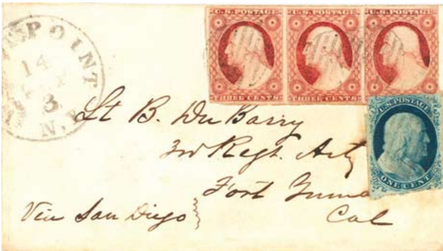
Figure 6. Cover to Fort Yuma endorsed “via San Diego,” franked with imperforate 1851 stamps and sent September (1857) from West Point, New York.

The second cover of the pair, shown in Figure 5, is endorsed “Via El Paso and San Antonio,” a different town order. It was franked at the single rate to 3,000 miles with a strip of the one-cent perforated 1857 issue and postmarked at Jackson on April 4, 1860 after the