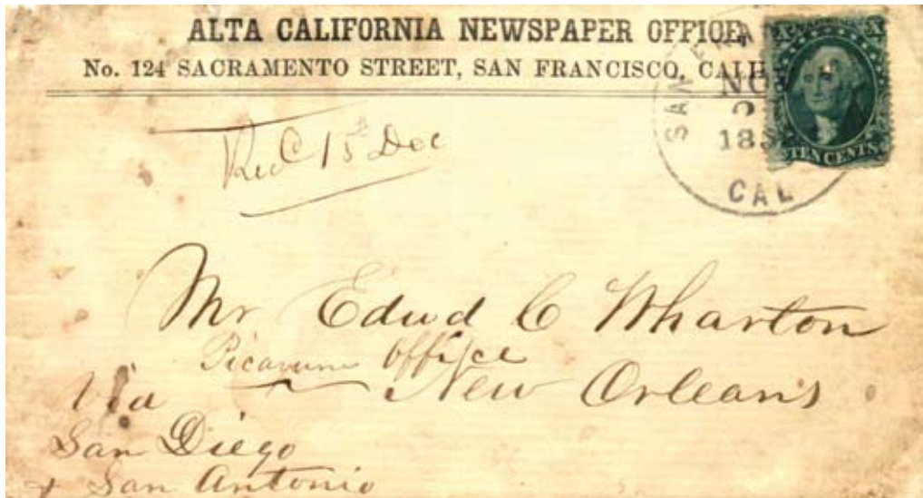
Figure 3. Imprint envelope of the Alta California newspaper, endorsed “via San Diego and San Antonio,” posted November 21, 1859, and sent from San Francisco to New Orleans over the entire length of the “Jackass Mail” route. The 10¢ 1857 stamp is Type V.

Covers carried on the Jackass mail route were to be endorsed “via San Diego and San Antonio” or similar. The authors record ten covers endorsed to be carried on the route. Additional covers carried within Texas, or between Texas and the East on the portion of the