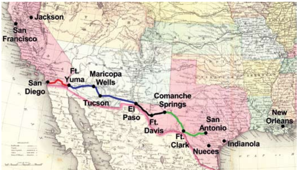
Figure 1. Map showing the entire San Diego and San Antonio (Jackass Mail) route, with various segments coded in color (see text).

In response to clamoring by residents of California for improved mail service, Congress enacted a postal bill to establish a through-mail route between San Antonio, Texas, and San Diego, California, on August 18, 1856. Further, the Act of December 19, 1856 authorized construction of a military road from El Paso to Fort Yuma and the military posts needed to protect the route. With connections onward from both termini to the major points in both California and the East, it was hoped this route would be faster and less costly.