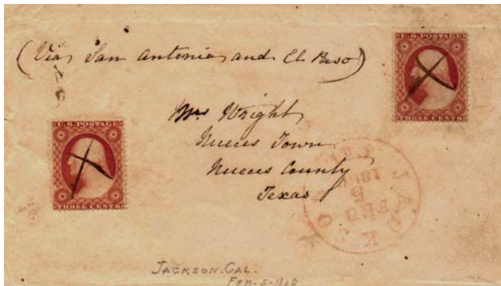
Figure 4. Cover endorsed “via San Antonio and El Paso,” sent February 5, 1860 from Jackson, California to Nueces Town, Texas. The two perforated 3¢ 1857 stamps pay double the three-cent rate for a distance under 3,000 miles.

The earlier of the two, shown in Figure 4, is endorsed “Via San Antonio and El Paso” at the top and franked at double the three-cent rate for under 3,000 miles. It has a red Jack-