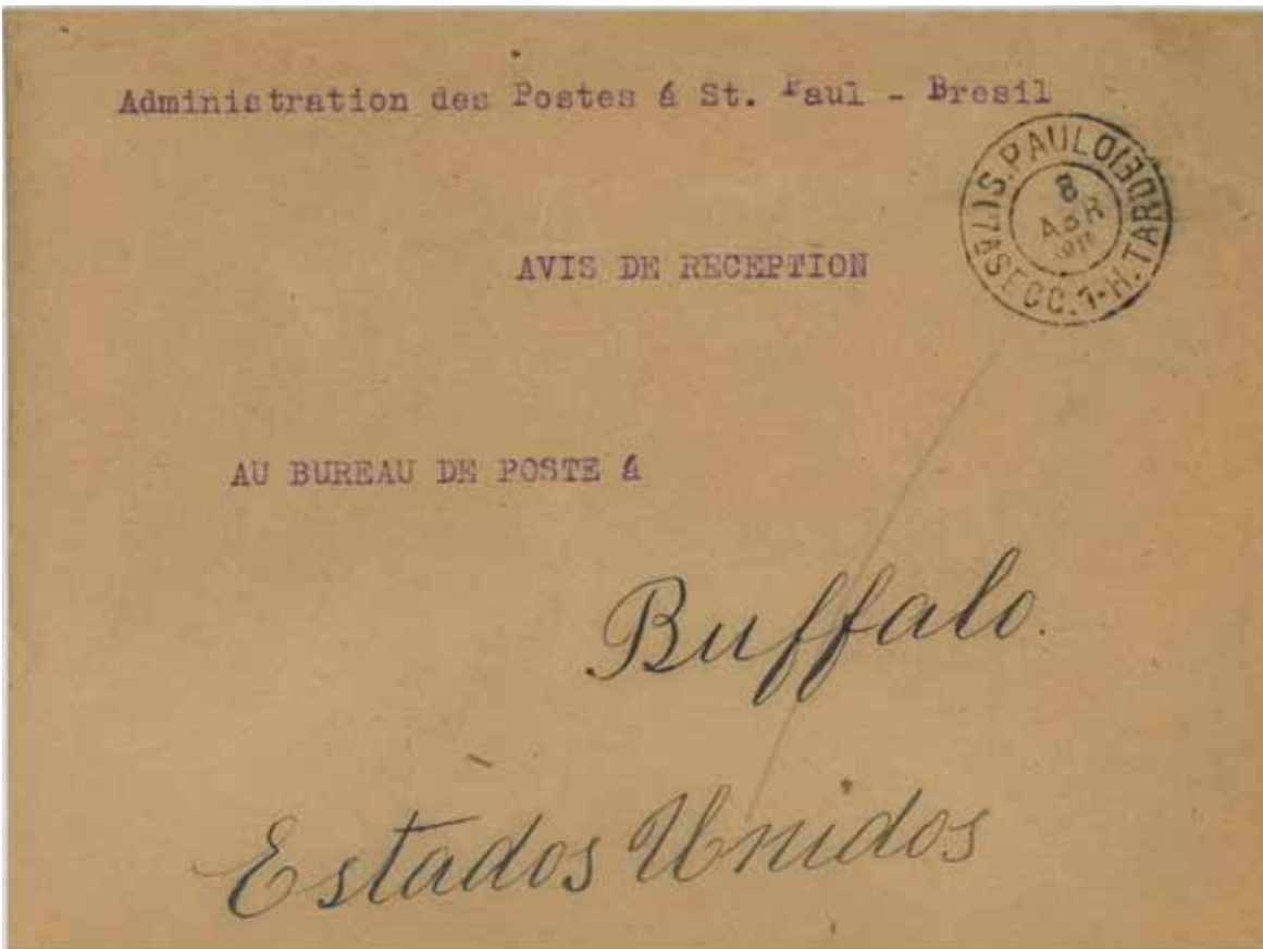
São Paulo to Buffalo, April 1912. Returned as non-registered mail.