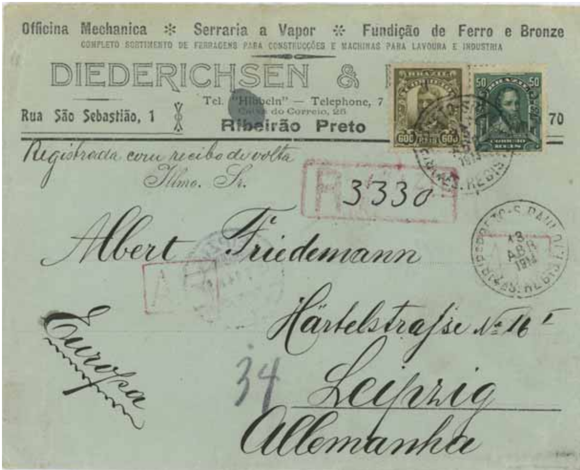
São Paulo to Leipzig, 1914. Standard AR handstamp. Rated 650 Rs, made up from 300 Rs registration, 150 Rs AR, and 200 Rs UPU-letter rate.