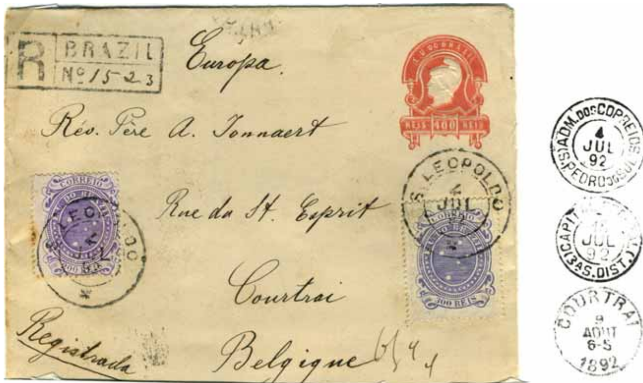
São Leopoldo (Rio Grande do Sul) to Courtrai (Belgium), 4 July 1892. No AR handstamp/ms. Rated 900 Rs: 200 Rs registration, 100 Rs AR, and triple 200 Rs UPU-authorized supplemented rate (50 ctm).

Three days after Treaty of Vienna came into effect. AR fee was paid on the cover, not the form (as required). There were two violations: AR or equivalent was not marked on the cover, and the AR form should have been prepared at destination . Very few AR form with cover combinations are known in this period.