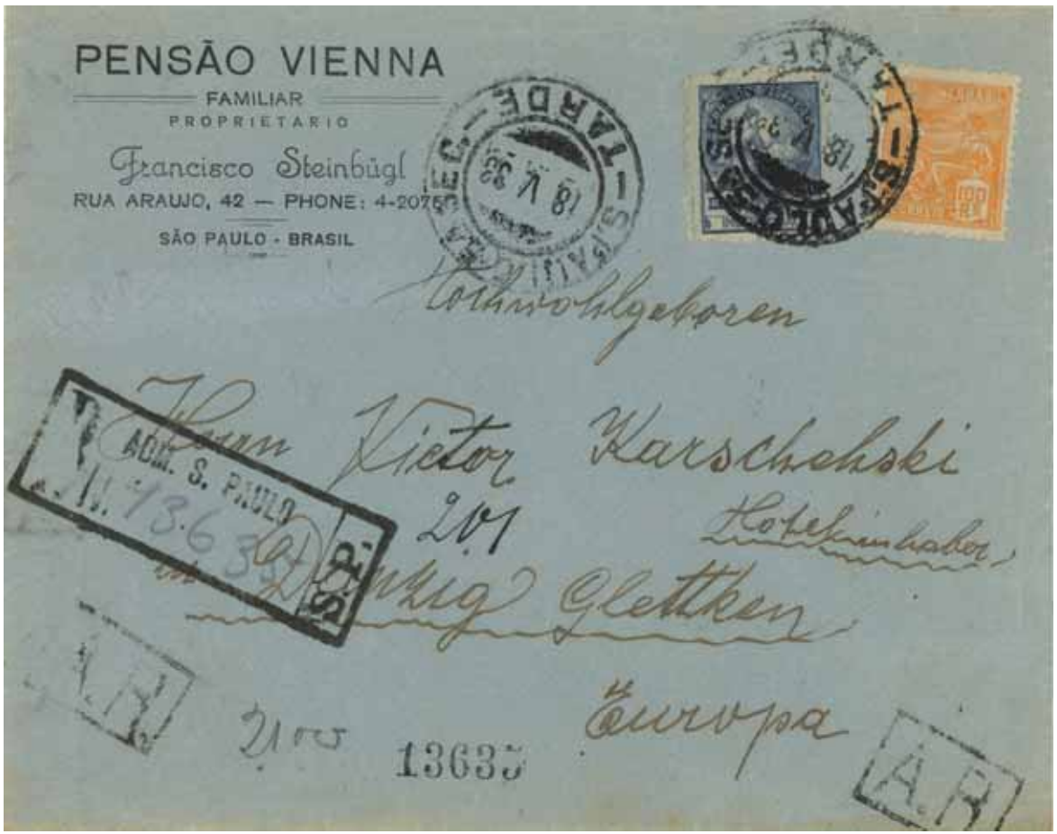
São Paulo to Danzig, 1933. Standard AR handstamp. Rated 2100 Rs, made up from 700 Rs for each of UPU, registration, and AR.