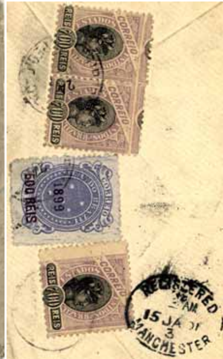
Brazil to Manchester, 1900-01. Standard AR handstamp. Rated 2600 Rs???