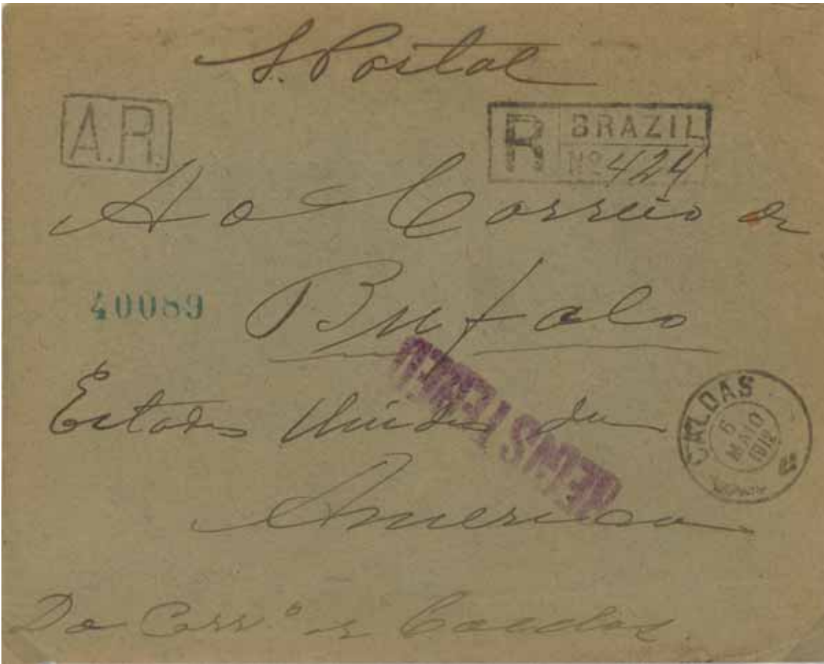
Returned from Poços de Caldas (Minas Gerais) to Buffalo, March 1912. Returned as registered mail.