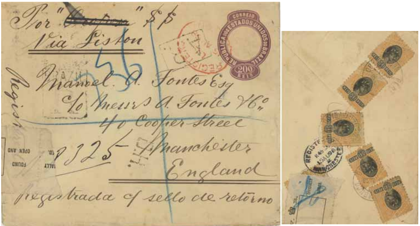
Pernambuco to Manchester, 1898. With standard A.R. handstamp. Also faint rectangular BRAZIL R handstamp. Rated 1400 Rs; inexplicable. Received in damaged condition and sealed in UK.