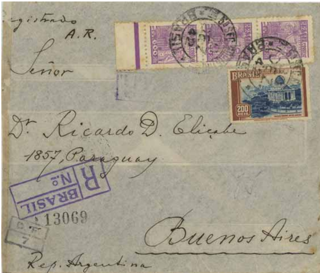
Brazil to Buenos Aires, 1942. Faint purple boxed A.R. handstamp. Rated 2000 Rs, made up of domestic AR fee (600 Rs), registration (800 Rs), and double domestic letter rate, at 400 Rs for the first weight, and 200 Rs for each additional. Argentina was a member of the PUAS. Brazilian censorship.