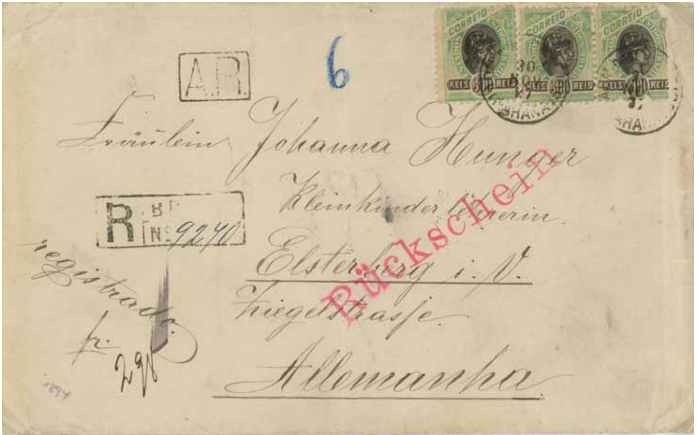
Paraná to Elsterberg (Germany), 1897. With standard boxed A.R. handstamp. The red rubber Rückschein handstamp applied in Germany on incoming AR mail. Rated 900 Rs; triple UPU at 200, registration at 200 Rs, and AR at 100 Rs.