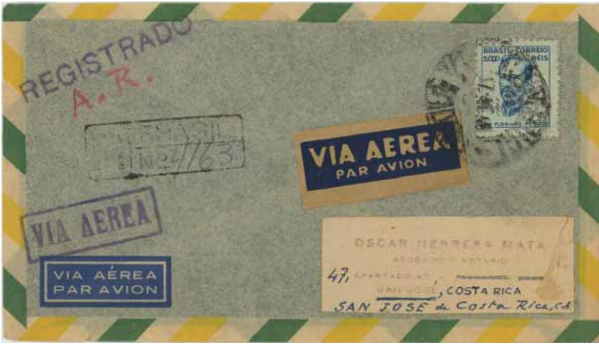
Brazil to Costa Rica by air, 1948. Ms crayon A. R. Rated 5000 Rs???