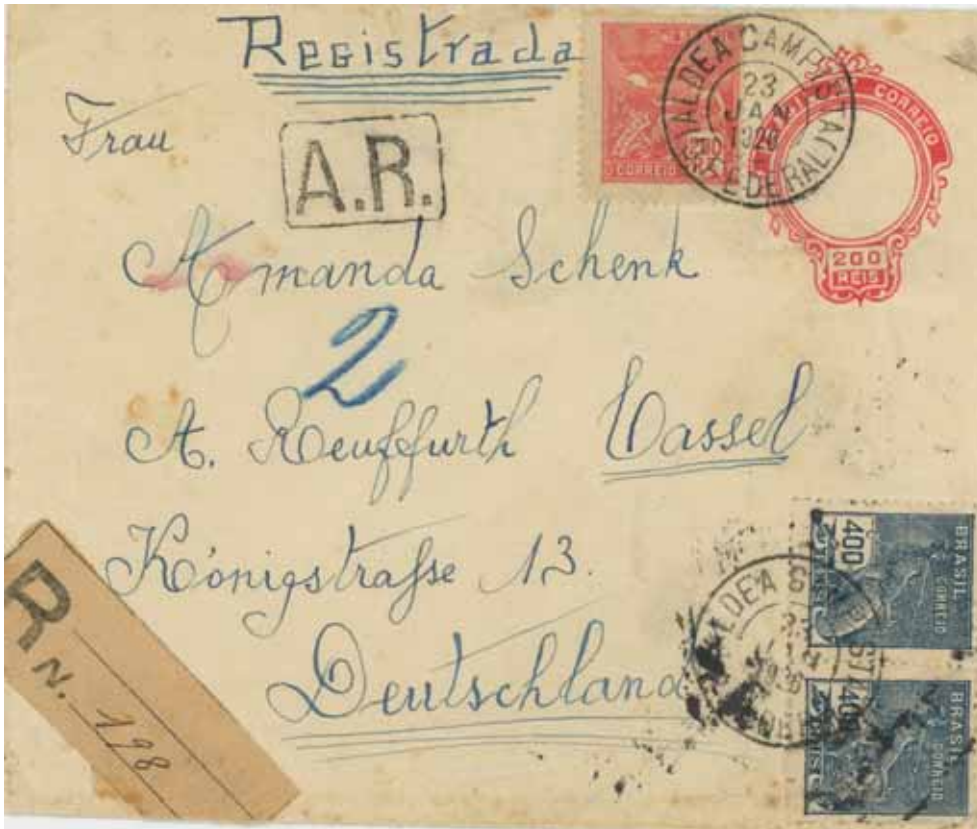
Aldea Campista (District Federal) to Cassel (Germany), 1926. Standard handstamp A.R. Rated 1200 Rs, from 400 Rs for each of UPU, registration, and AR. Oddly, there are no backstamps.