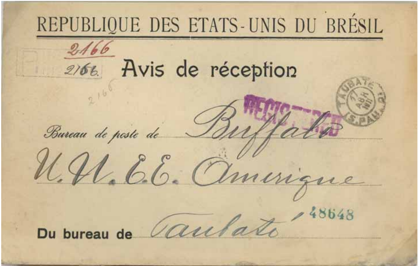
Returned from Taubaté (São Paulo) to Buffalo, 1911. Returned as registered mail.