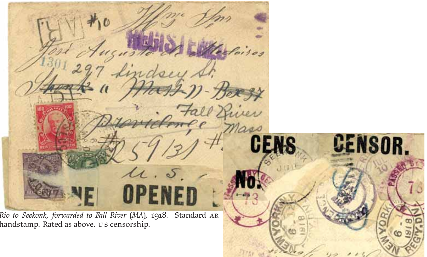
Rio to Seekonk, forwarded to Fall River (MA), 1918. Standard AR handstamp. Rated as above. U.S. censorship.