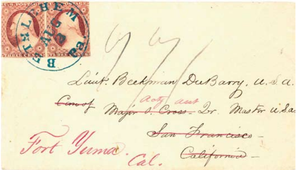
Figure 1. Pair of imperforate 3¢ 1851 stamps on an 1854 cover from Bethlehem, Pennsylvania to San Francisco, forwarded to Fort Yuma, California.

An article in the previous Chronicle 1 discussed the Jackass Mail Route and mentioned several covers addressed to Lieut. Beekman DuBarry while he was stationed at Fort Yuma, California. Those covers were all carried by government mail, via San Francisco and San Diego, and onward by mule across the Colorado Desert to Fort Yuma, California. One additional cover from the correspondence, shown in Figure 1, was not included because it was carried by a military supply steamboat on the Colorado River rather than on the Jackass Mail Route.