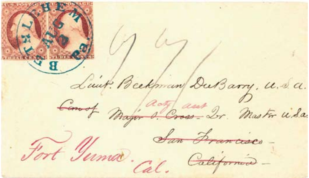
Figure 1. Pair of imperforate 3¢ 1851 stamps on an 1854 cover from Bethlehem, Pennsylvania to San Francisco, forwarded to Fort Yuma, California.

An article in the previous Chronicle 1 discussed the Jackass Mail Route and mentioned several covers addressed to Lieut. Beekman DuBarry while he was stationed at Fort Yuma, California. Those covers were all carried by government mail, via San Francisco and San Diego, and onward by mule across the Colorado Desert to Fort Yuma, California. One additional cover from the correspondence, shown in Figure 1, was not included because it was carried by a military supply steamboat on the Colorado River rather than on the Jackass Mail Route.