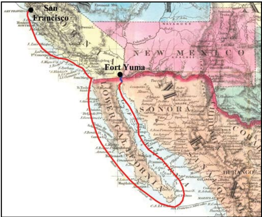
Figure 3. Map of the 1854 military supply route from San Francisco, around Lower California and by the Colorado River (shown in blue) to Fort Yuma.

Even though the newspaper report is inaccurate regarding the date the supply route commenced operations, the overall scheme outlined is correct. One historical source 4 includes great detail on the early steamboat operations on the Colorado River. Pertinent points are summarized in following paragraph.